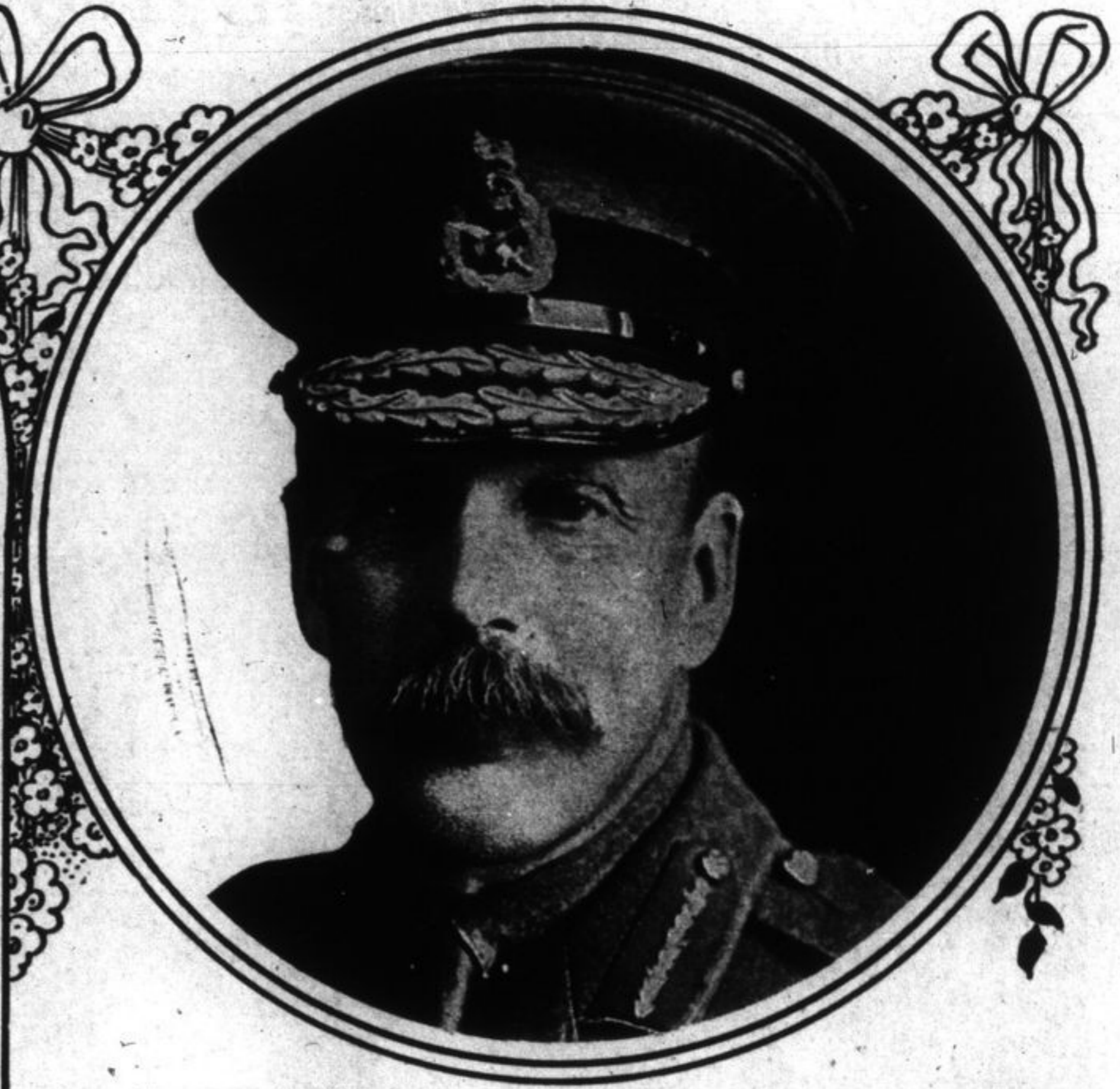
The Captor of Bagdad. Major-General Sir F. S. Maude, who was in command of the forces which captured Bagdad. Major Maude is well known in Canada, many years ago having been attached to the staff of the Governor-General.