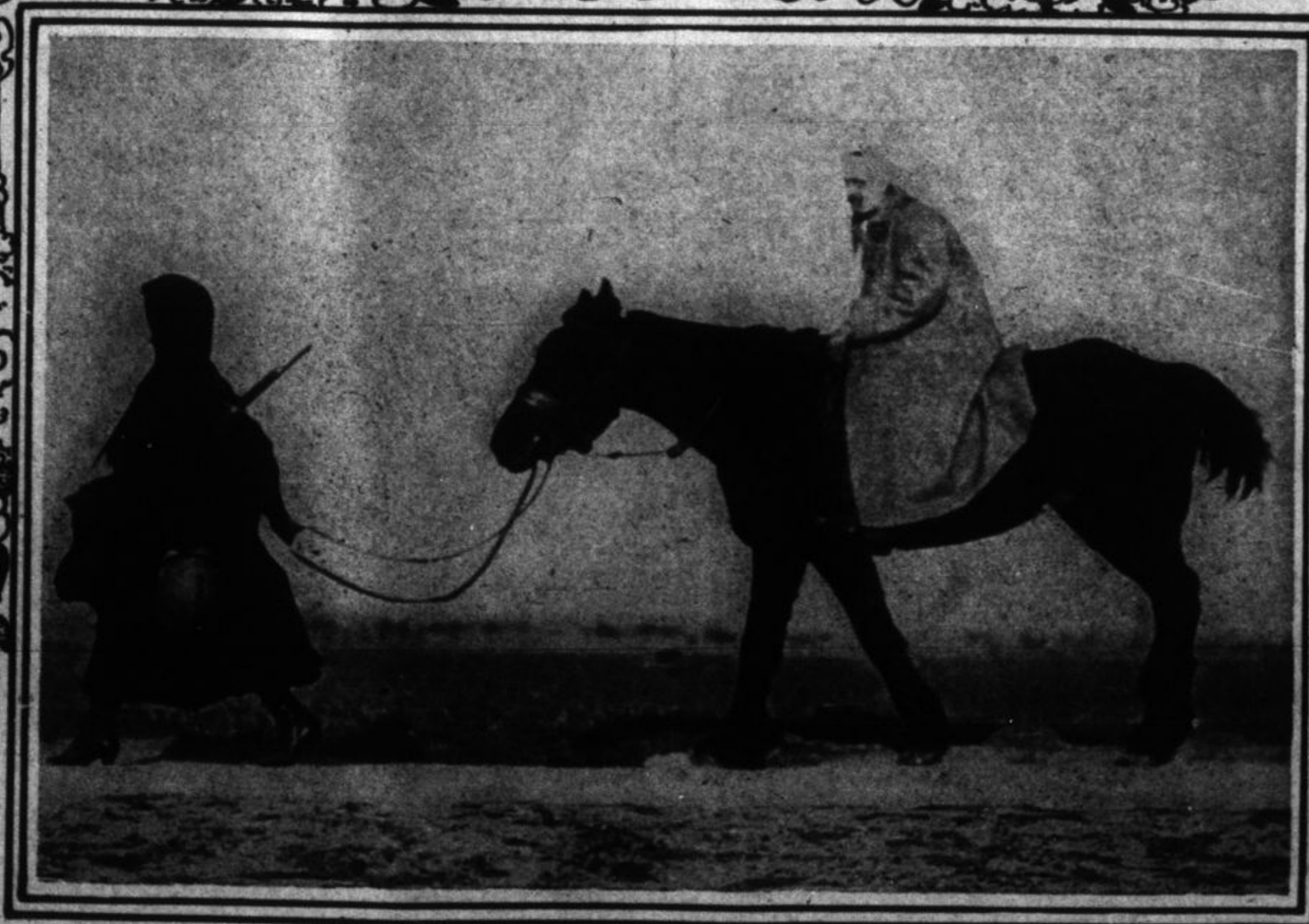
An incident on the Somme Front.—Not all the heroines of France have been decorated. Witness this devoted woman, who, after a recent Somme engagement, made many trips into range of German guns, to bring back wounded soldiers—walking cases—to the military hospital in her village.