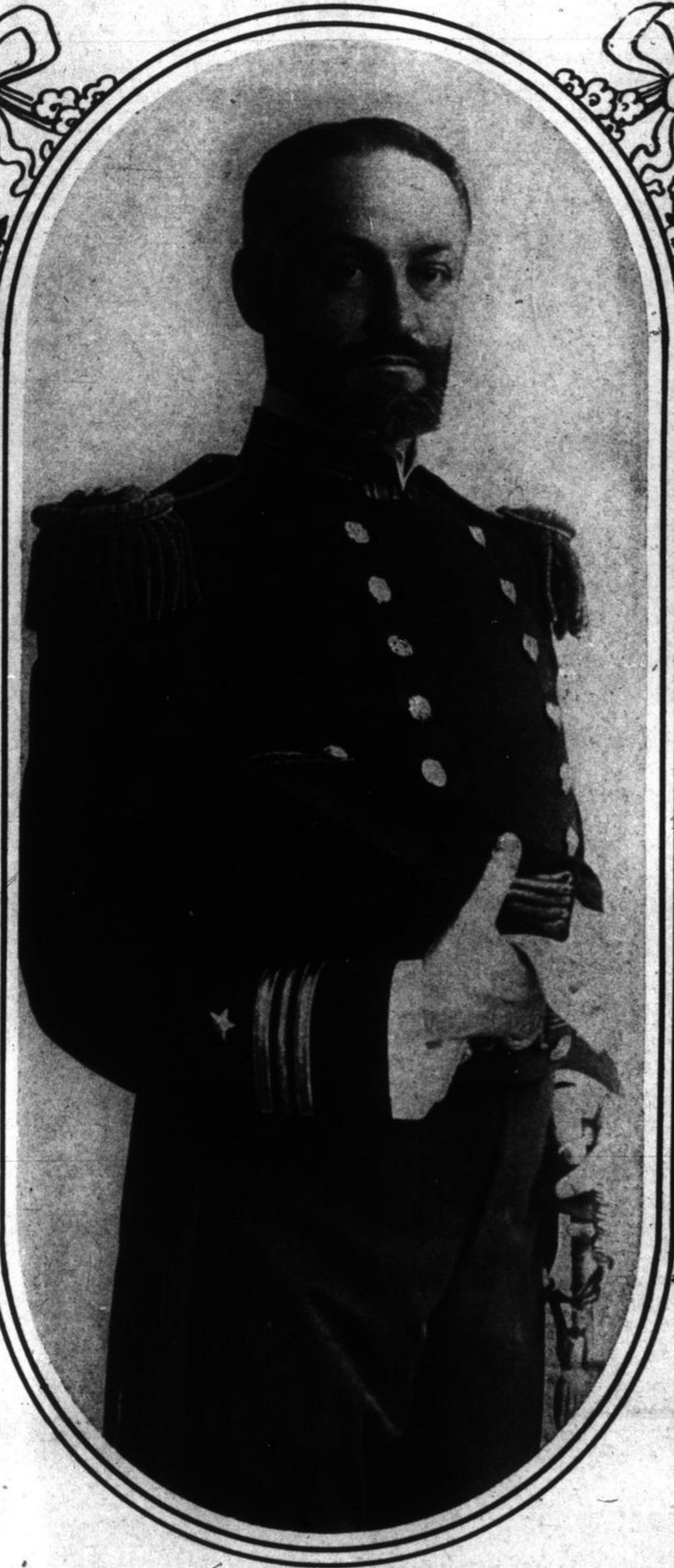
Rear Admiral Sims, of the United States navy, who has gone to England to advise with the British Navy Department on the conduct of the war in so far as it relates to the new allies.