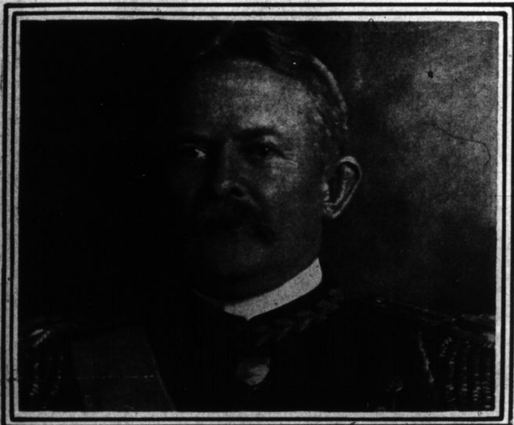
A new portrait of Gen. J. Franklin Bell, U.S., who succeeds Gen. Leonard Wood, as commander of the Department of the East, with headquarters at Governor's Island. General Bell is a native of Kentucky.