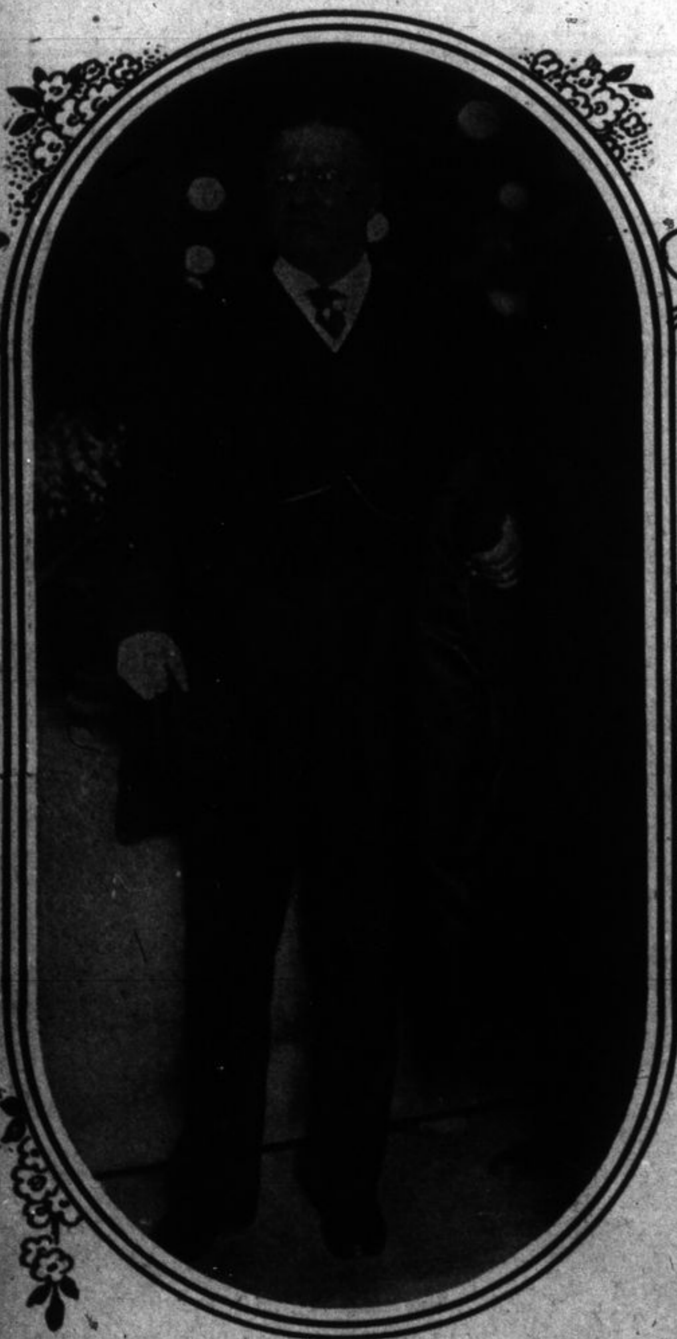
It is an absolute impossibility when publishing a newspaper to avoid running into "Teddy" Roosevelt every hour of the day. He is everywhere and everywhere. "A good fellow" and a staunch friend of the Allies is the irrepressible citizen Teddy of the United States. Here he is trying to look unconcerned at the recent New York Flower Show.