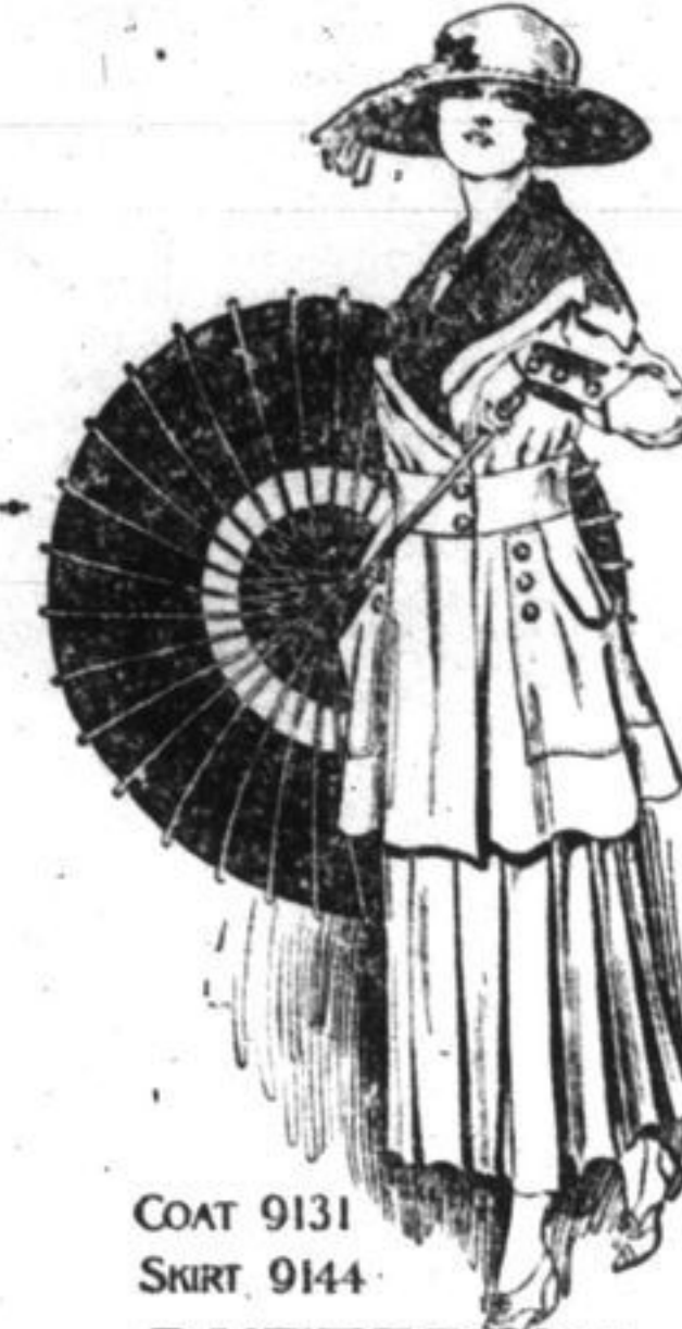
COAT 9131 SKIRT 9144

At a time when silks are so fashionable and when prices have advanced so much, we call attention to a large assortment secured at prices of last September, and these will be sold much below today's prices. Come and see them, even if not ready to buy.