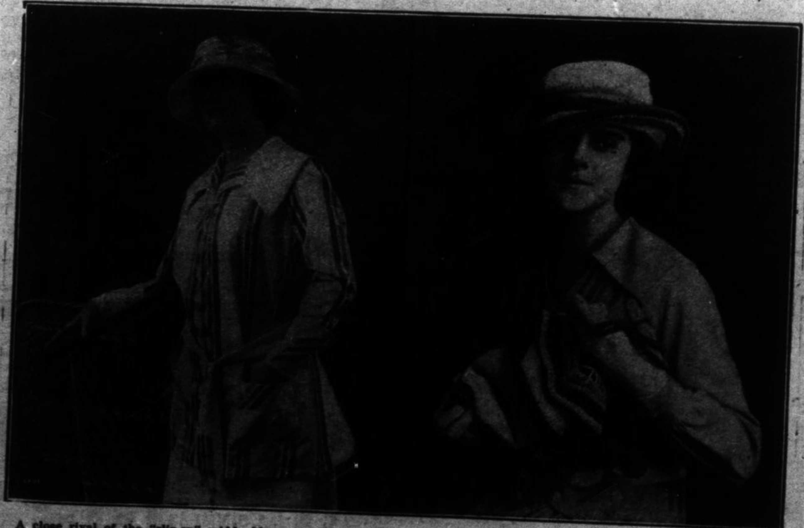
A close rival of the "slip-on" middie blouse is the sport shirt, belted loosely at the waistline, with huge collar, deep pockets and cuffs to accentuate its comfort. Illustrated here is one in two-toned, rose-striped taffeta, which fastens down the front with large pearl buttons. White taffeta supplies an interesting contrast on the pockets, collar and cuffs, also forming all but the border of the sash.