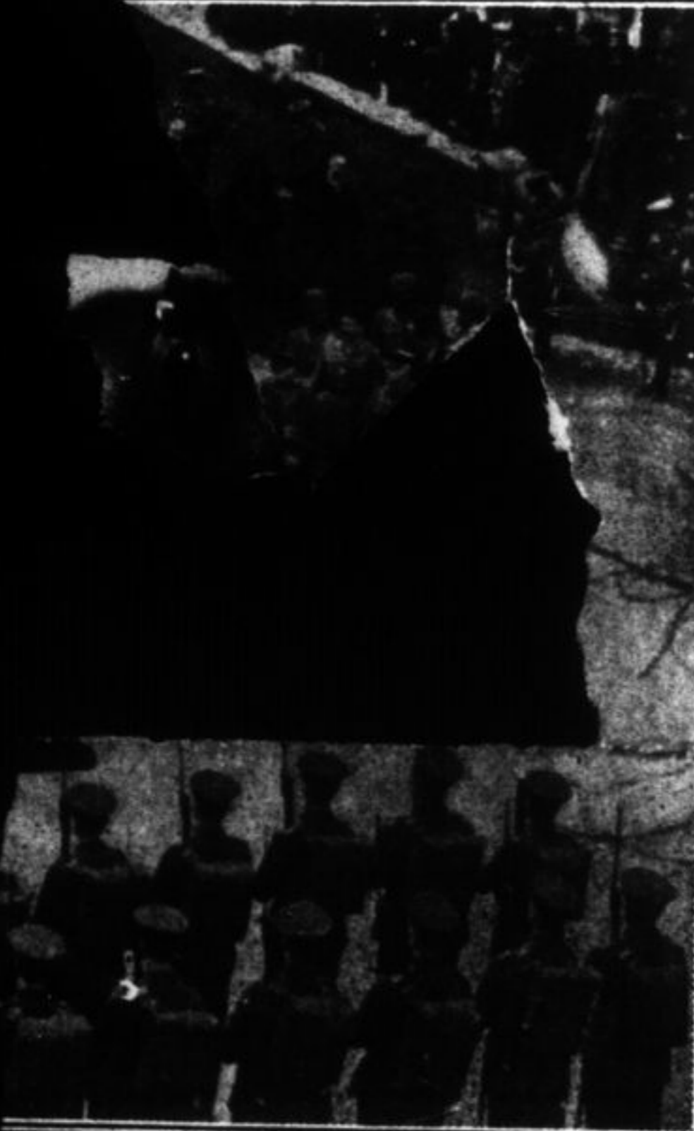
of Connaught, and other mourners.