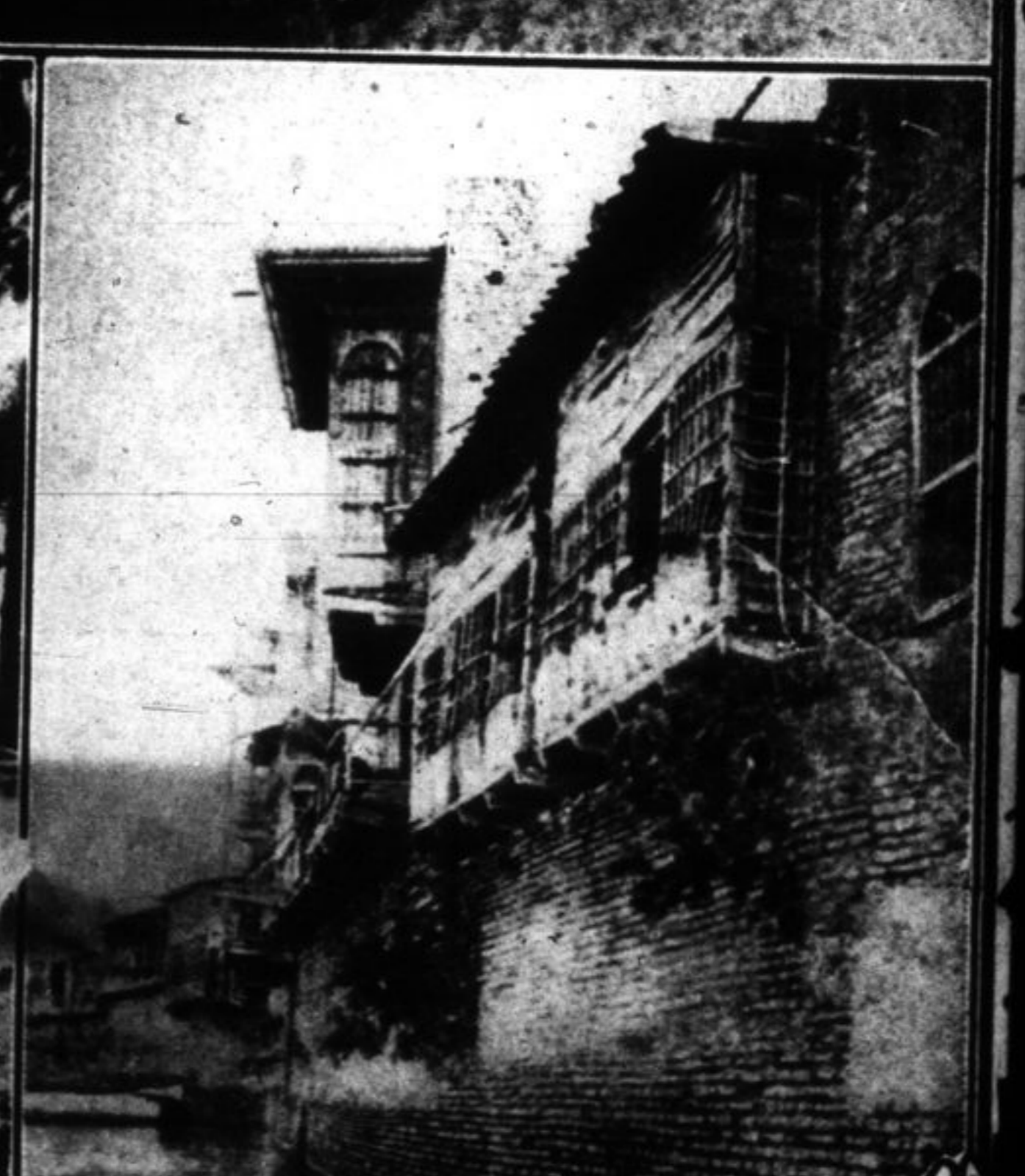
A wealthy man's house facing the Tigris, in a Bagdad suburb. Bagdad towards Mosul. (Up per illustration).