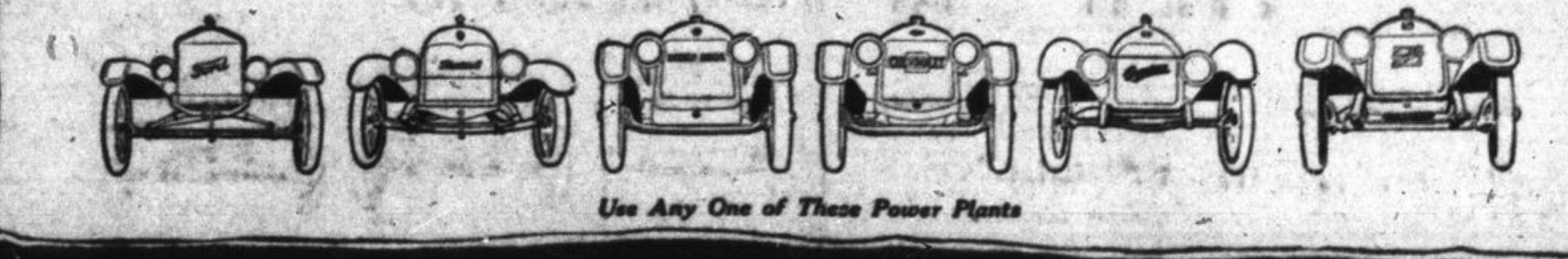
Use Any One of These Power Plants

W. F. KELLY OIL CO., Cor. Brock and Ontario Streets. Phone 486.