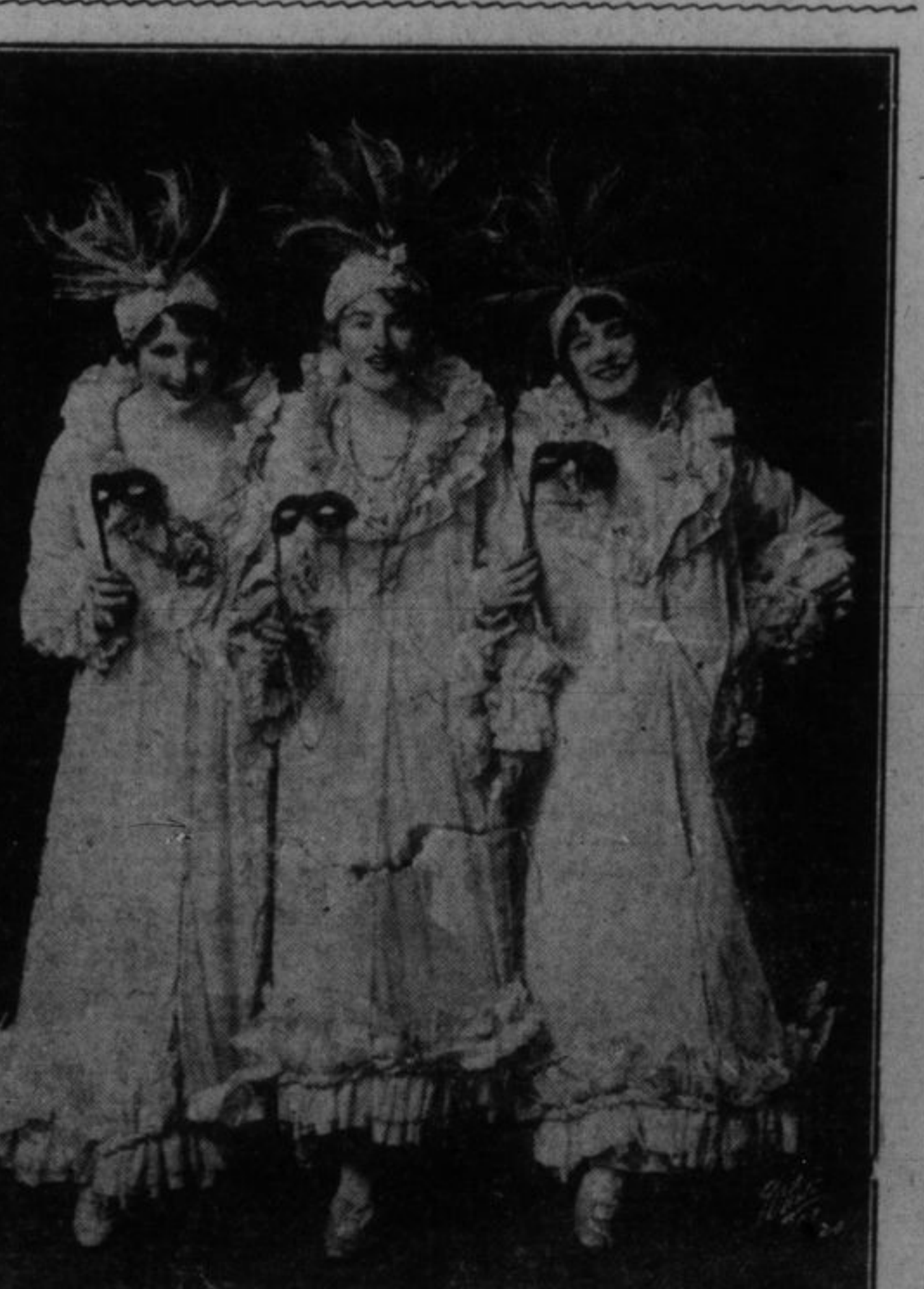
Some of the young charmers in "The Girl Who Smiles" at the Grand Opera House on Saturday, March 31st, matinee and night.

High Praise For Western Creamery. The firm in England which received the co-operative car of creamery butter shipped last October from the three Prairie Provinces states that this was certainly the finest parcel it had received from Canada. "If," it added, "the three Provinces maintain this quality there is no doubt but that your butters will command very high prices in the British markets."