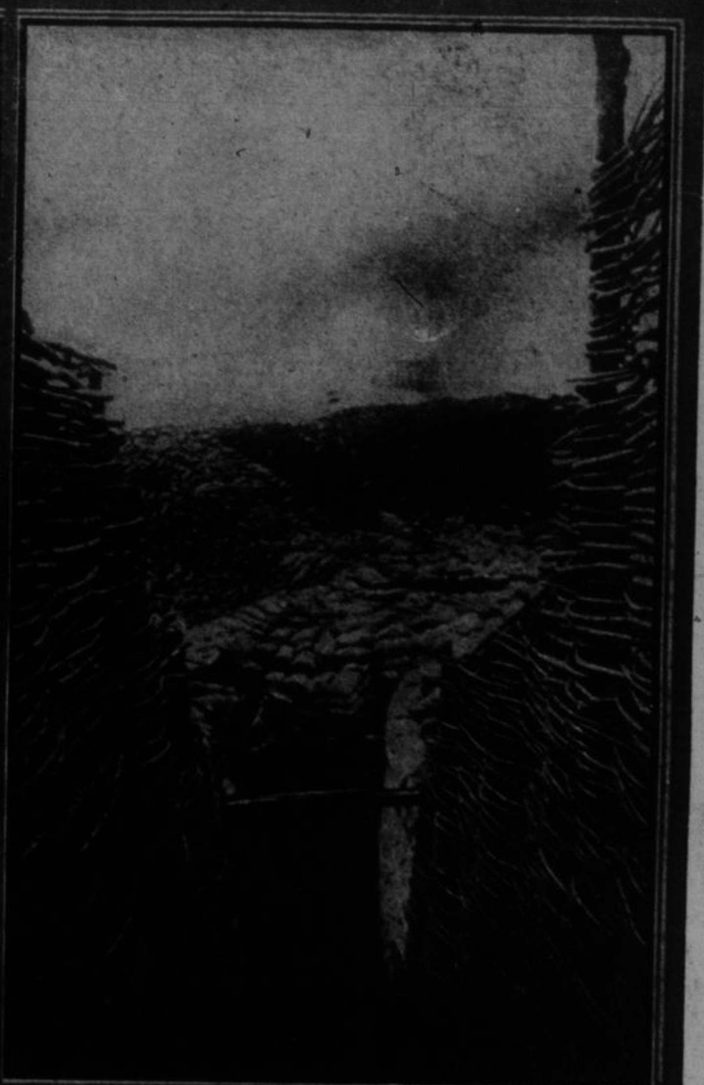
The objective of it all. An elaborately constructed system of German trenches on the western front.