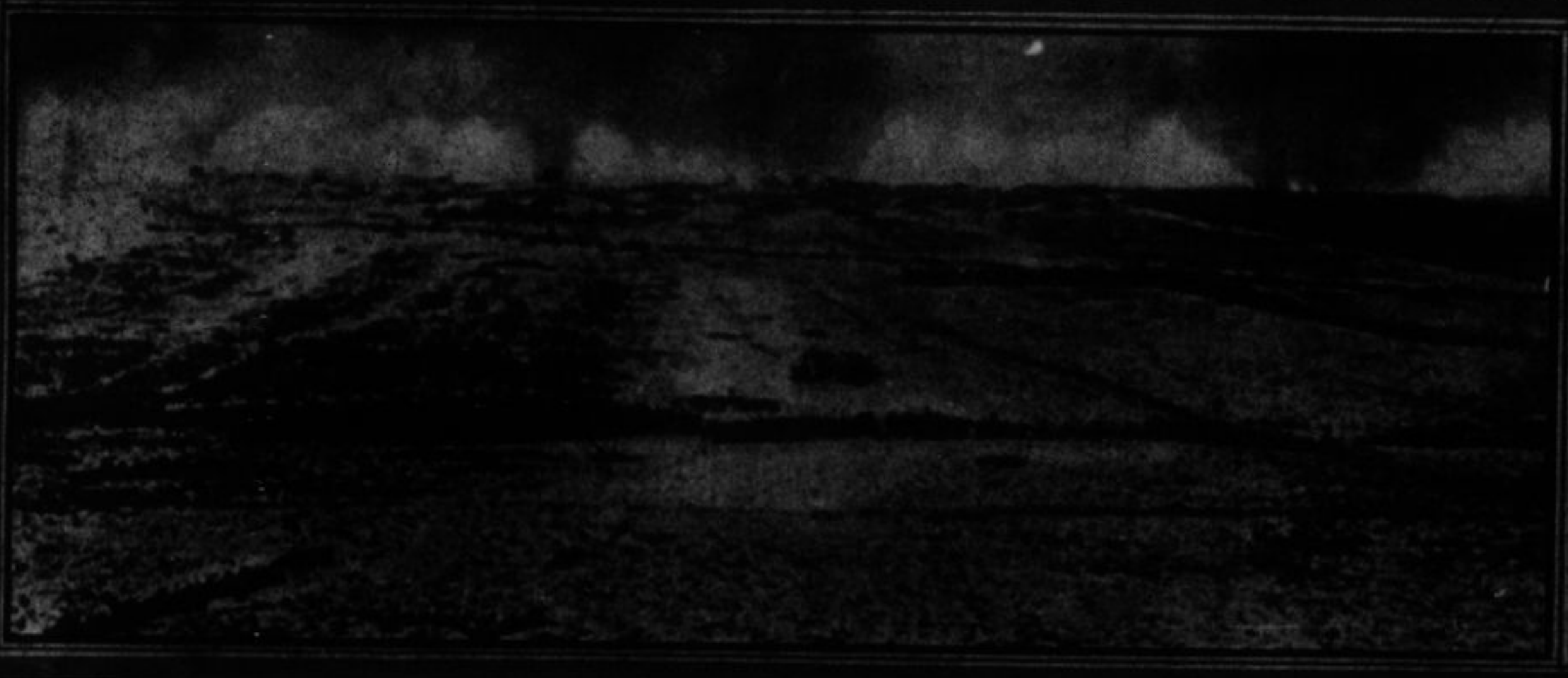
The barrage fire, Meurthe et Moselle sector, which uses up shells of the famous French 75's by the millions. This is a photograph of an actual bombardment.