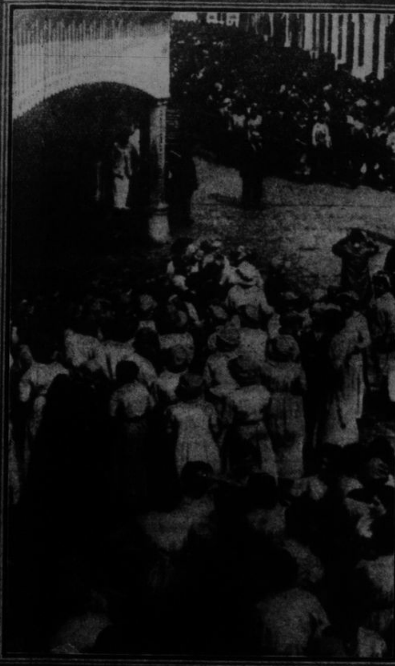
Two thousand French munition workers receiving words of praise from the Russian General, Gilinsky.