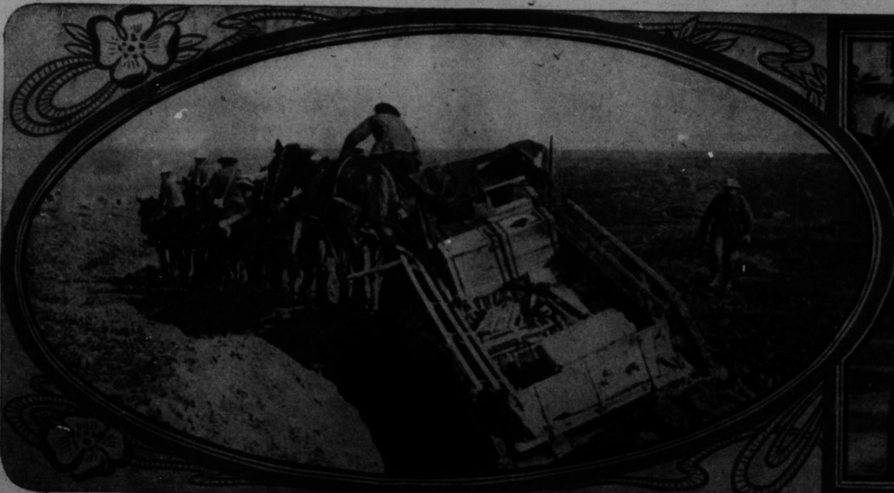
It is no easy matter getting an ammunition wagon over miry ground, for, after persistent rains, the soil is no firmer than cream cheese, and horses cannot get a grip.