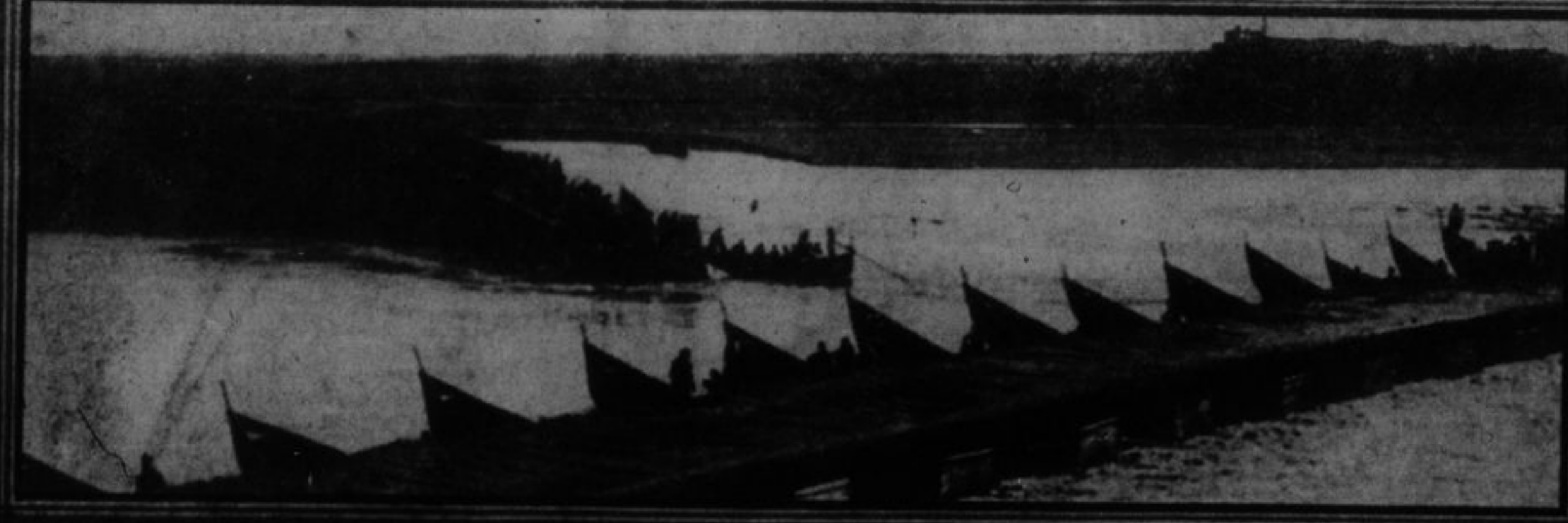
After a long and tedious campaign word comes from the Mesopotamia expedition that conditions are improving. The British have captured the city of Bagdad, and the Russians are pushing forward to the border. Major-General Maurice said recently that this success has completely upset Germany's plans in the East. The picture shows a Turkish military bridge over the Tigris at Mosul.