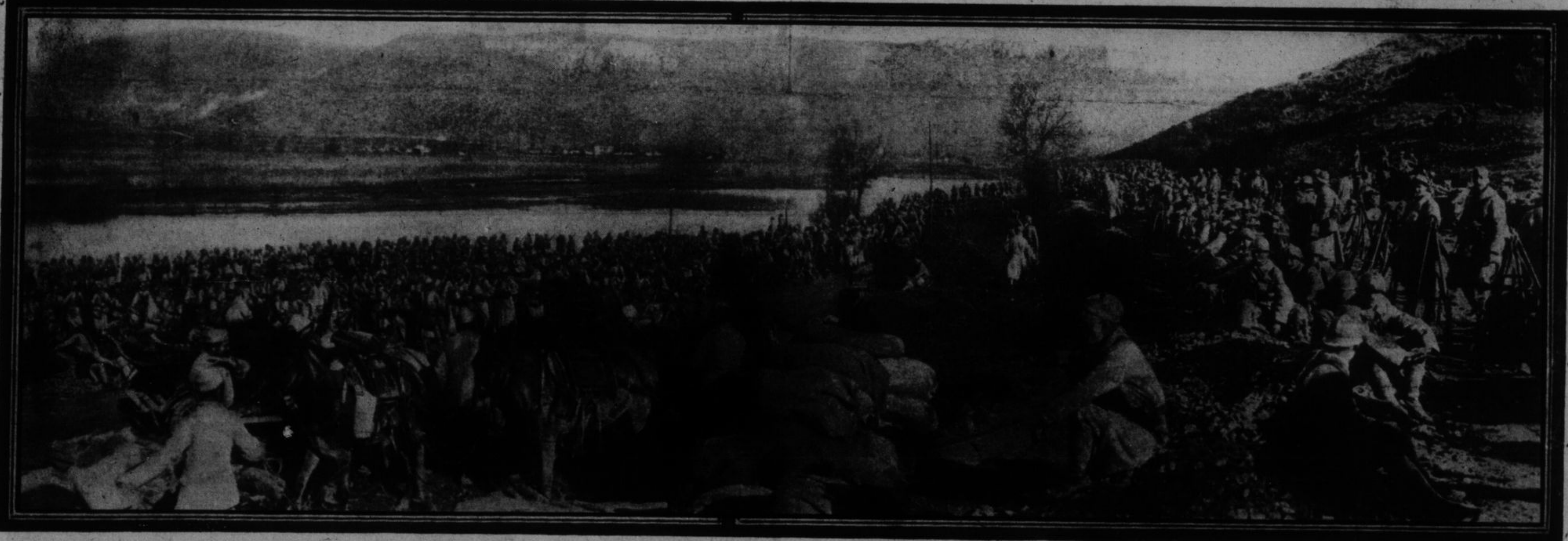
French troops on the march from Salonika to strengthen the advanced lines, bivouacked along the banks of the Vardar. The French now hold the centre of