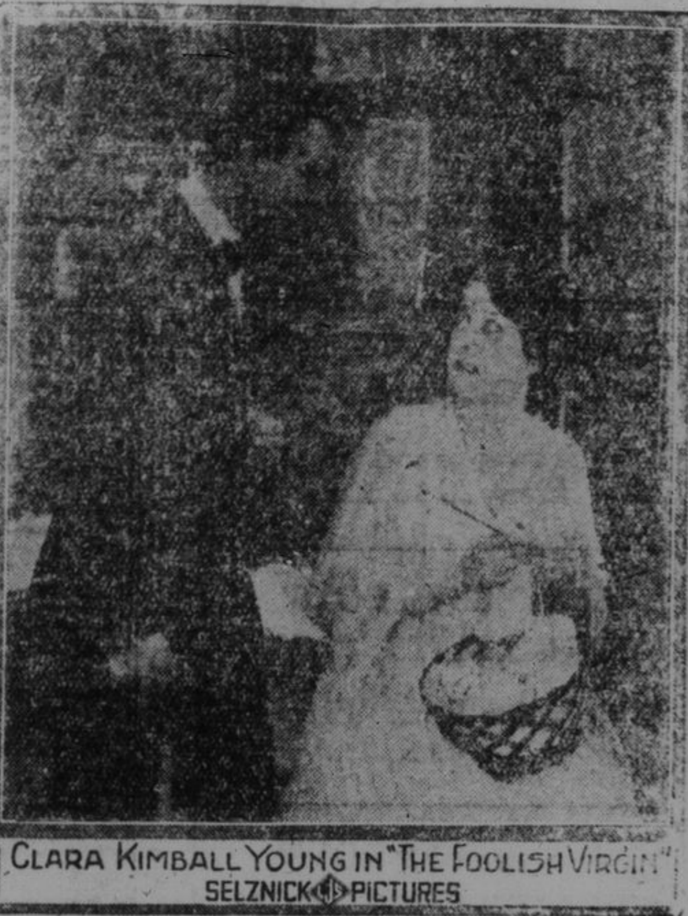
CLARA KIMBALL YOUNG IN 'THE FOOLISH VIRGIN' SELZNICK PICTURES