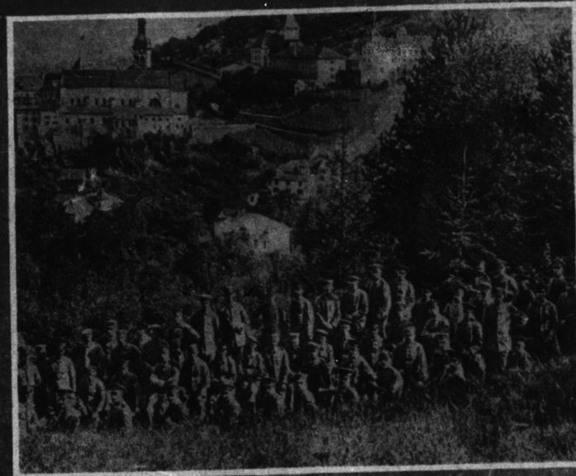
Seeking new strength amid the fir trees of Chur. The Swiss have made a humane arrangement with all the belligerent nations whereby convalescent prisoners are sent to recuperate in the upland valleys of the "Playgrounds of the World." It seems strange that these men, who but a few weeks previously had been fighting each other should "bury the hatchet" so completely, and even go so far as to enjoy one another's company.