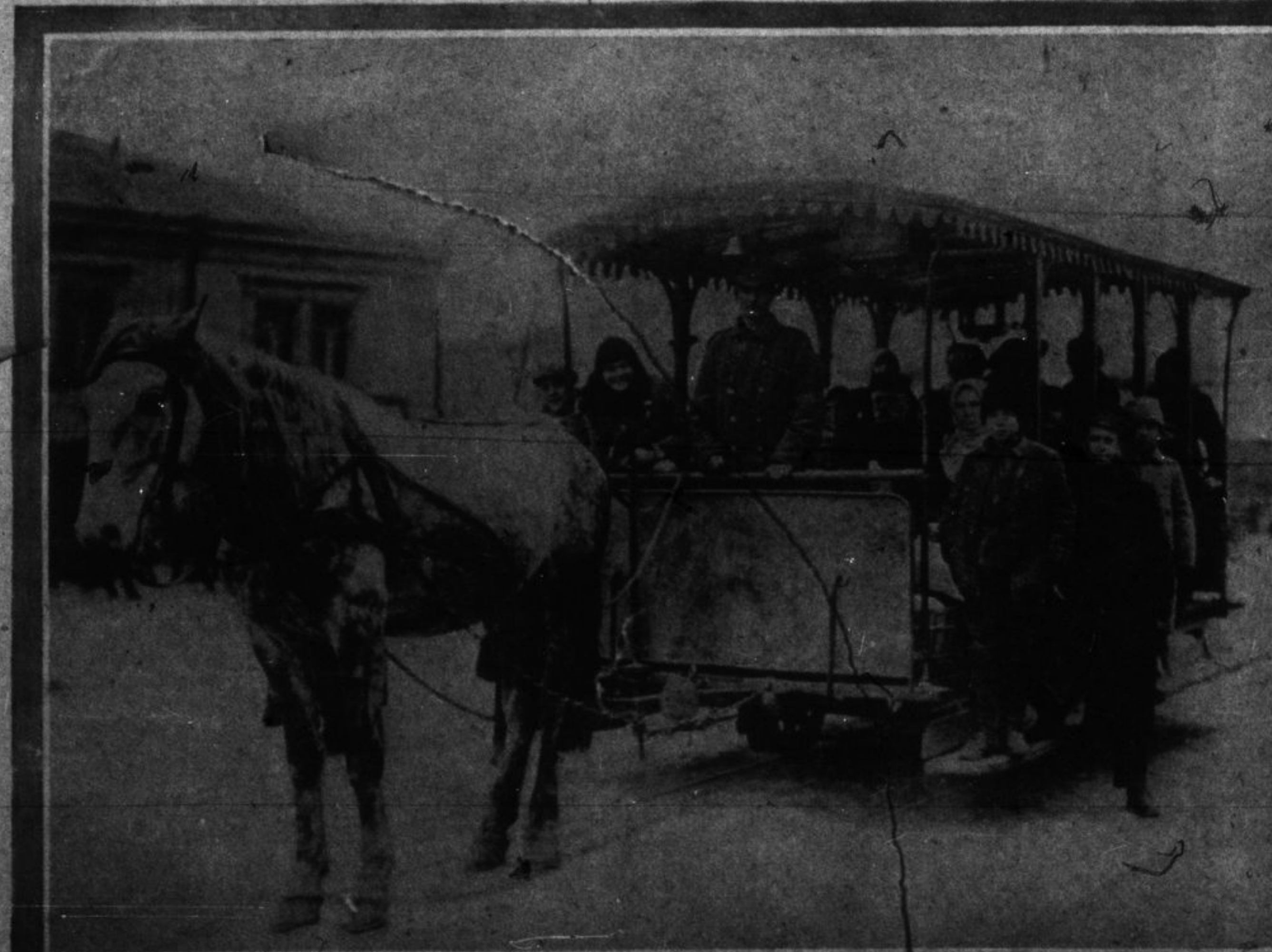
Prisoners of War Drive Tramway Cars in Russia.—Russia, who has captured an immense number of Austrians, does not permit them to live in idleness, and in many of the towns they are employed in driving the trams or street cars. They are not allowed, however, to collect fares, a duty which a woman conductor takes care of.