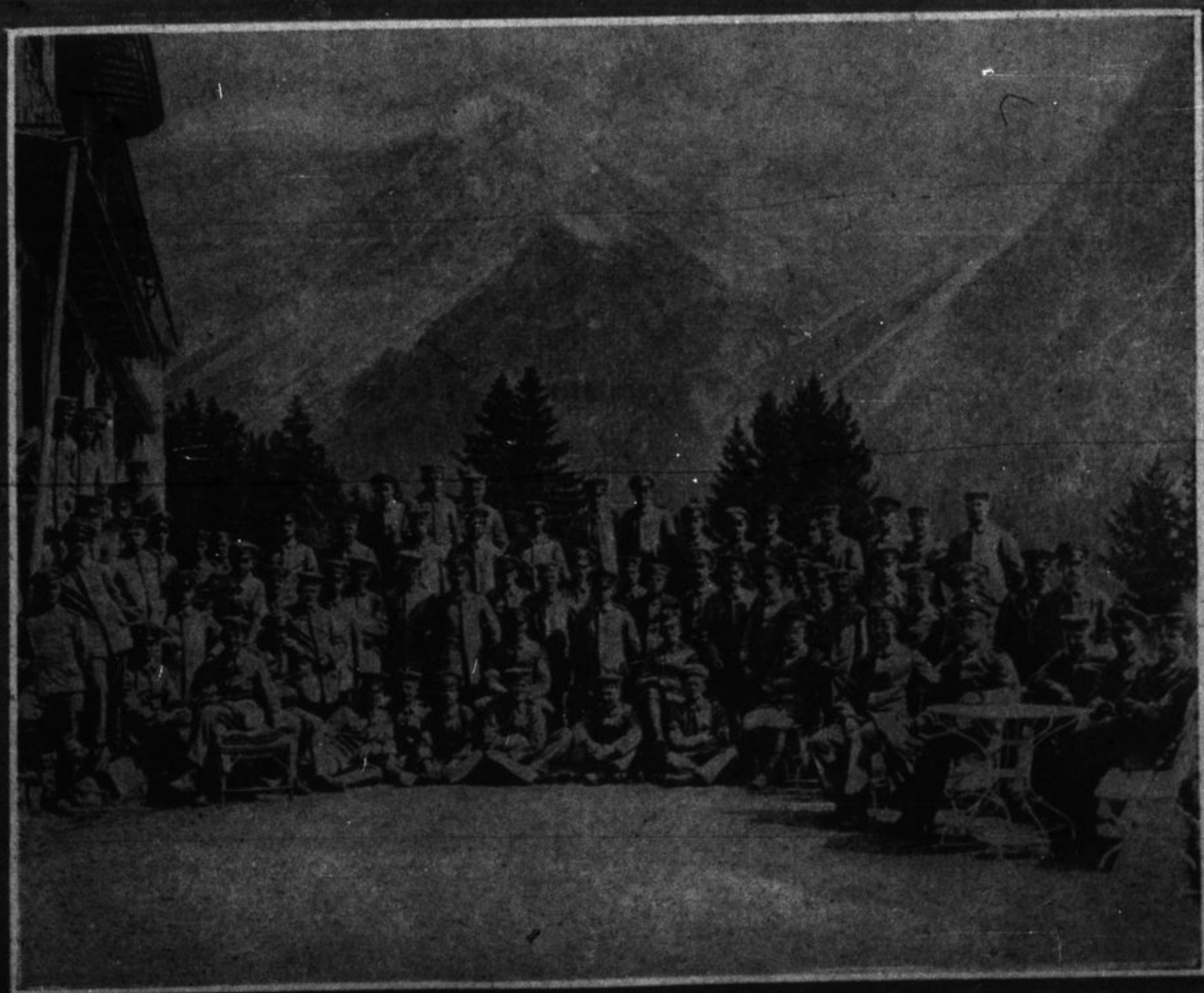
Here are shown a group of convalescent German prisoners. The surroundings are exceedingly beautiful, and the place is by no means dull. There are constantly arrivals and departures, and every man has a wonderful story to tell. The mountain range seen in the background gives an idea of the beauty and the splendid position that this camp occupies.