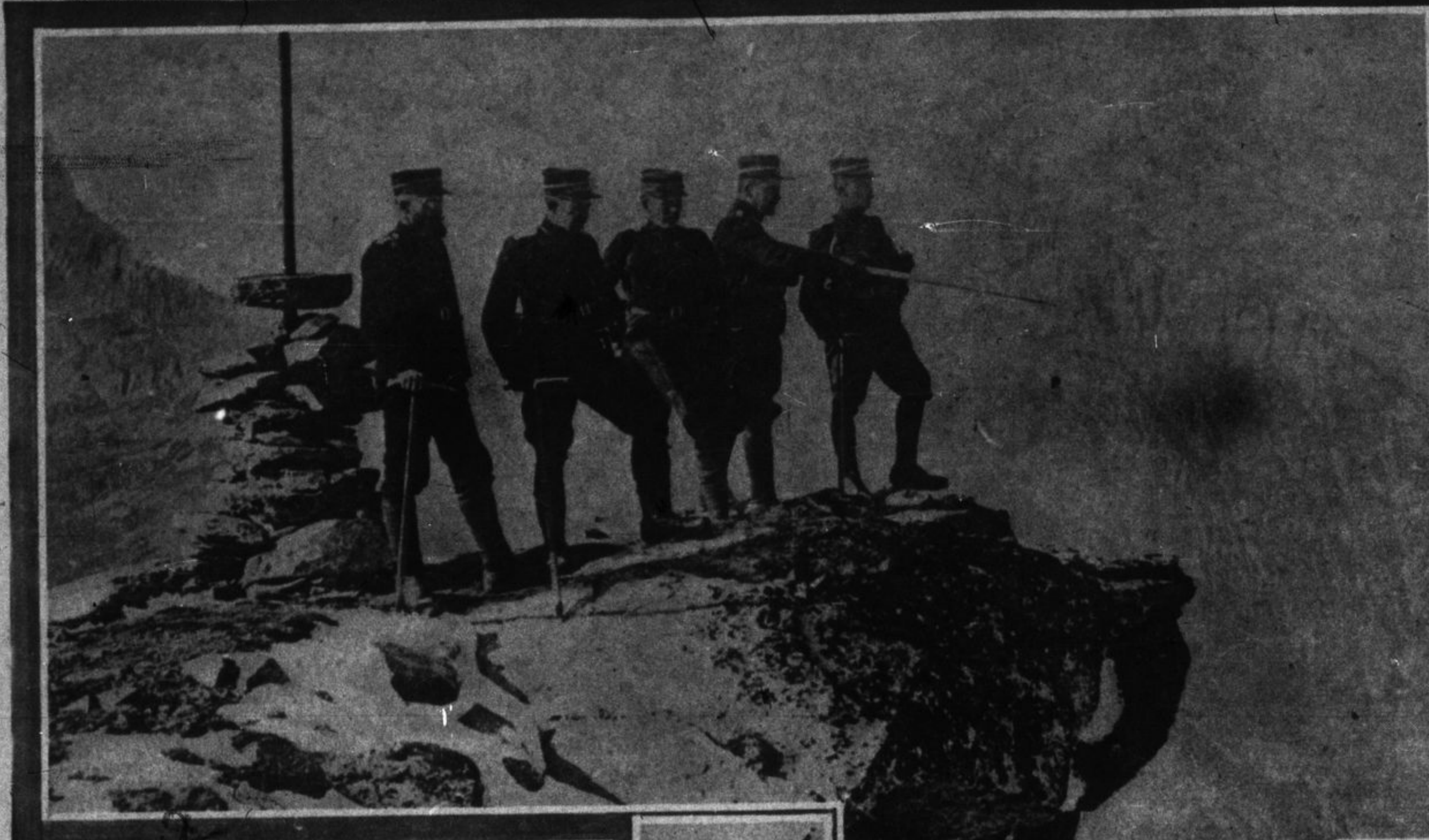
Switzerland Fears Invasion.—Officers of the Swiss fortress troops on the St. Gothard. As a precautionary measure the Swiss Federal Council has decided to mobilize immediately certain divisions of the army that have not as yet been mobilized according to despatches from Berne. There have been frequent reports recently of uneasiness in Switzerland regarding possible violation of her neutrality.