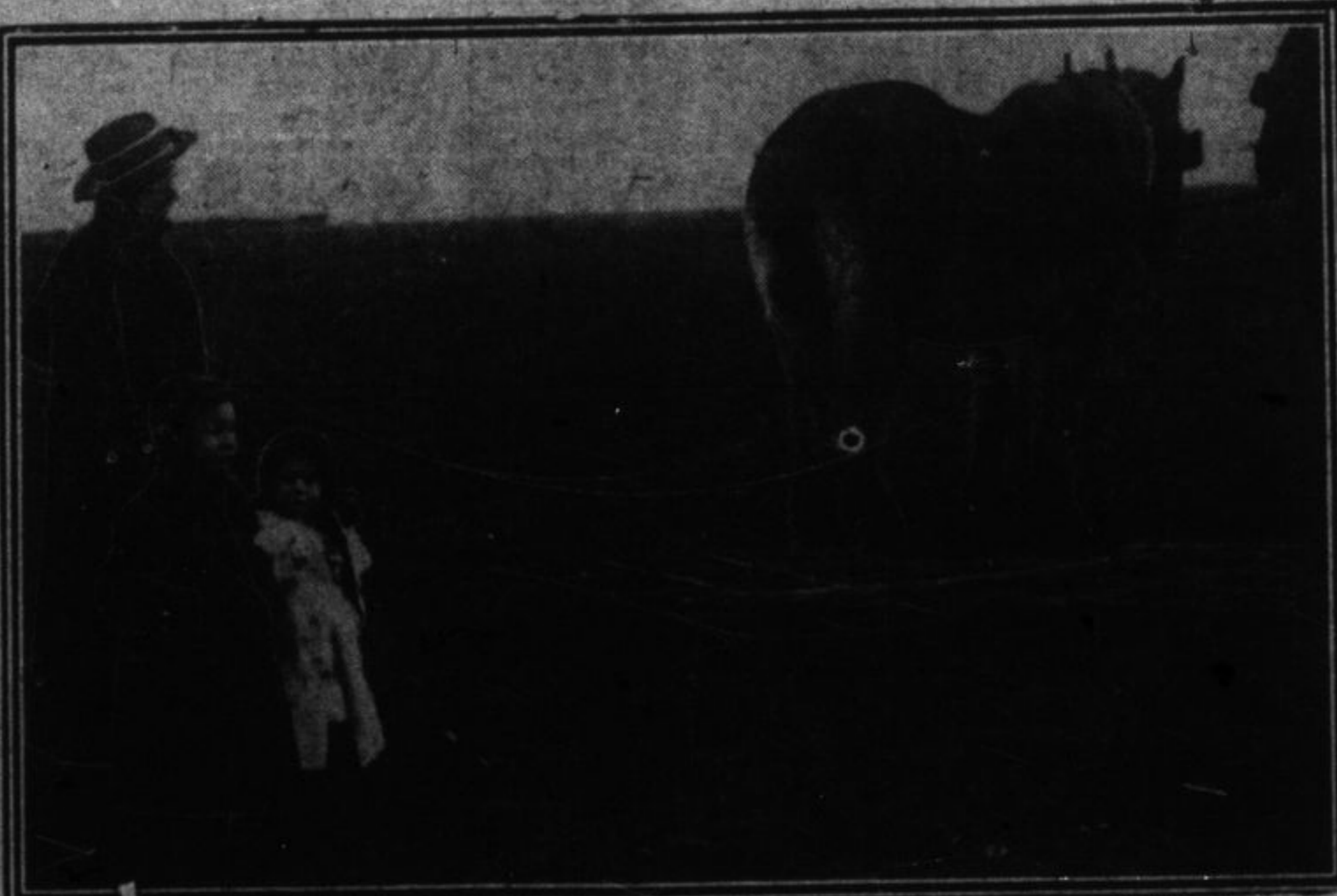
WOMEN PLOWING IN THE OLD COUNTRY. Women must work while their husbands must fight in old England. The picture shows a sturdy English farmwife guiding the harrows on the plowed field, while her two little daughters plod alongside her for company's sake. These are days of work and sacrifice in the Old Land.

If the proposed rule that the nearest fence or obstacle in a major league baseball park shall be no less than 270 feet from the home plate goes into effect, home runs will become a curiosity.