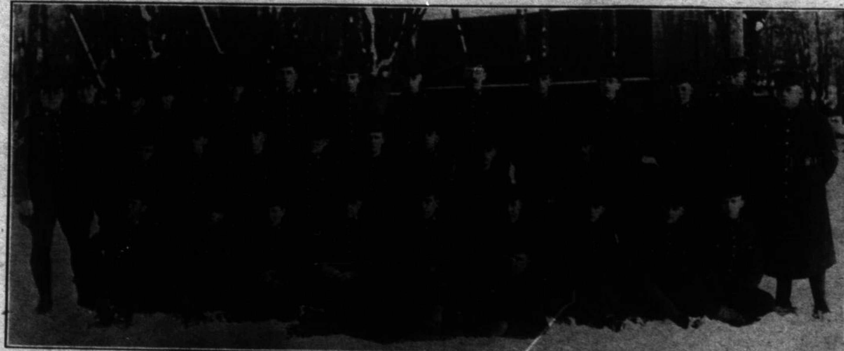
OVERSEA DRAFT FROM DEPOT AMBULANCE CORPS (QUEENS), KINGSTON.