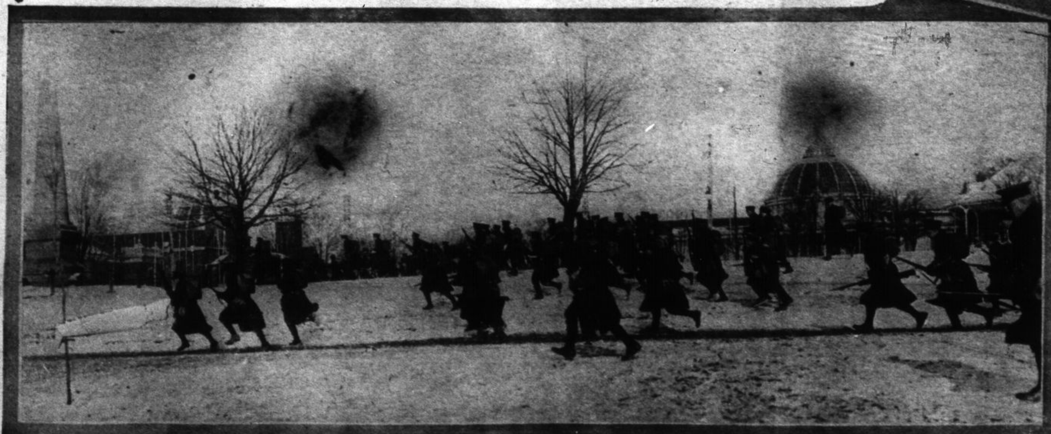
The 208th Irish Battalion after an inspection by the C. O., going through manoeuvres at Exhibition Camp.