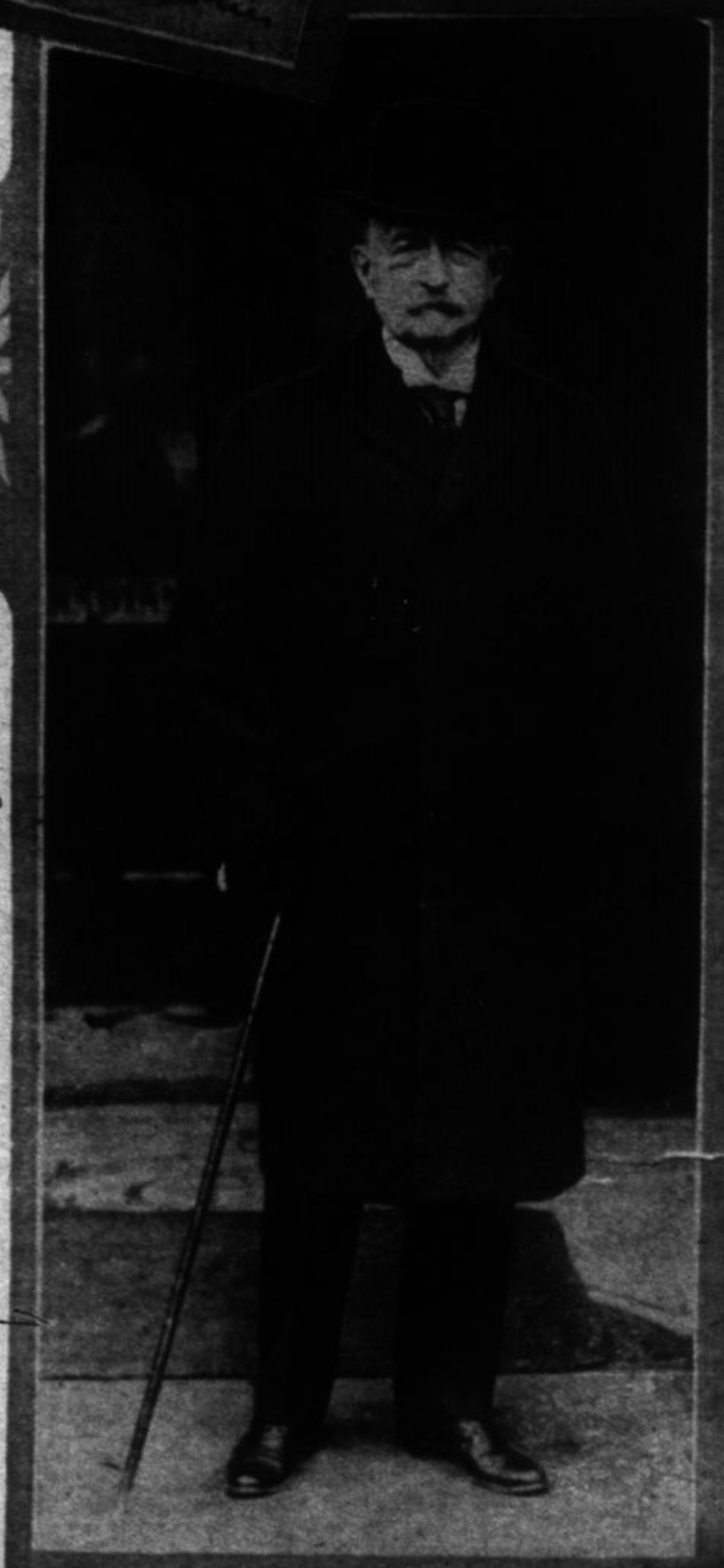
Lord Shaughnessy, the new Peer, leaving the Canadian Pacific Railway office at London, England, to take his seat in the House of Lords.