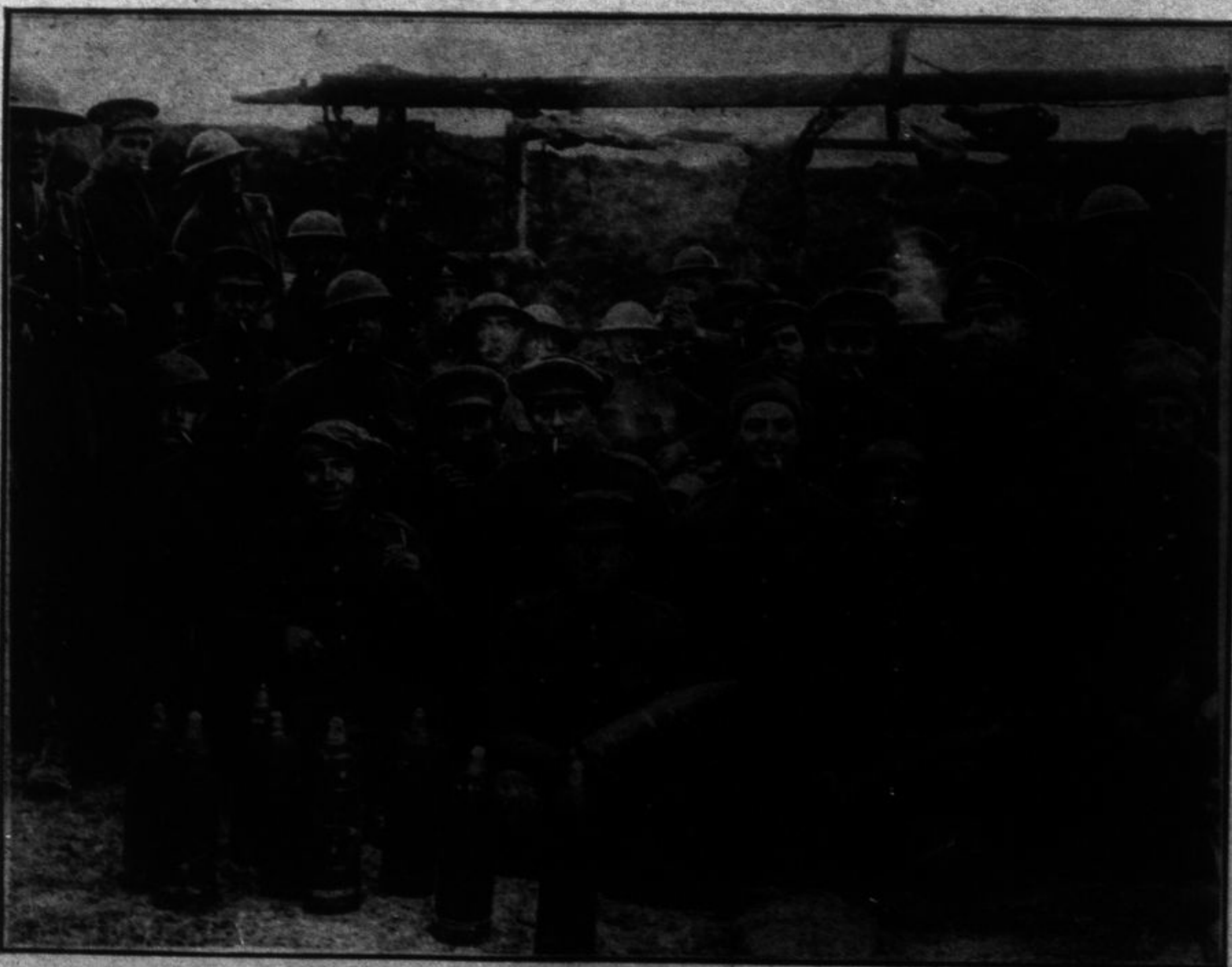
On the western front with the troops receiving gifts of cigarettes from the manufacturers. These remembrances are greatly appreciated.