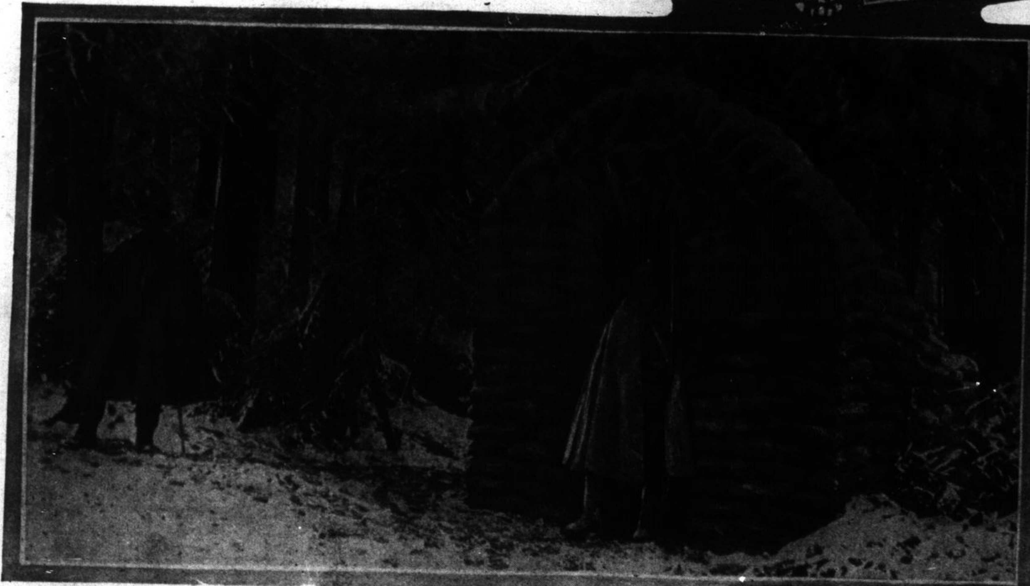
French sentry in the Vosges Mountains erects sand-bag shelter on classical lines, affording protection against hostile bullets as well as against rain and snow.