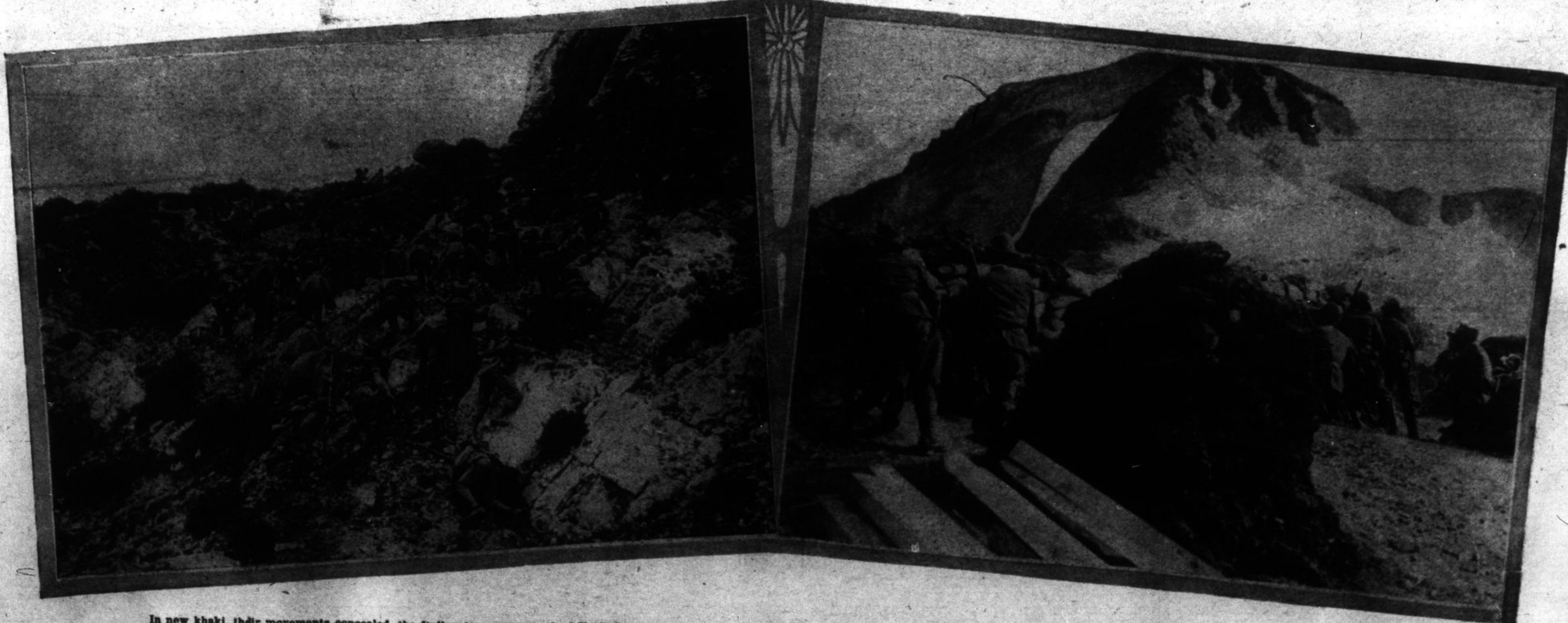
In new khaki, their movements concealed, the Italian troops swarm the hillside like ants.