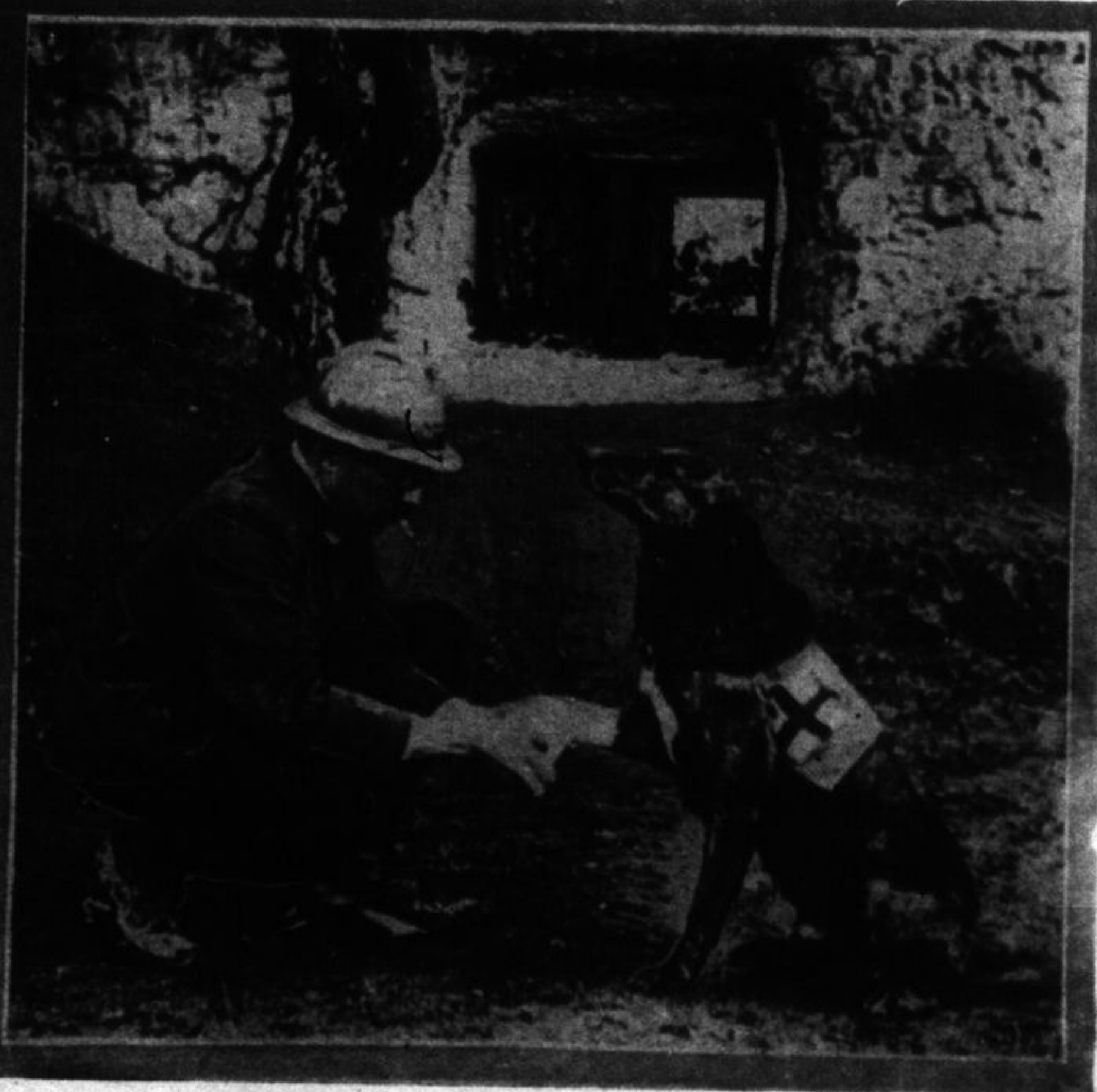
Taking care of a wounded Red Cross dog, wounded in action.