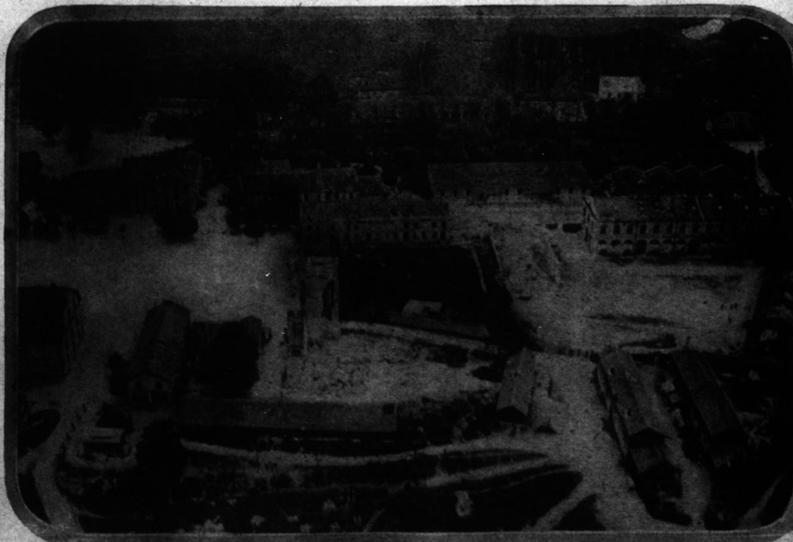
SUPPLY AND AMMUNITION DEPOT NEAR VERDUN. A locality in the Verdun region near the front where are the barracks repair houses and an ammunition depot. The heavy bombardment of the Germans is evident from the shell holes splattered over the roofs.