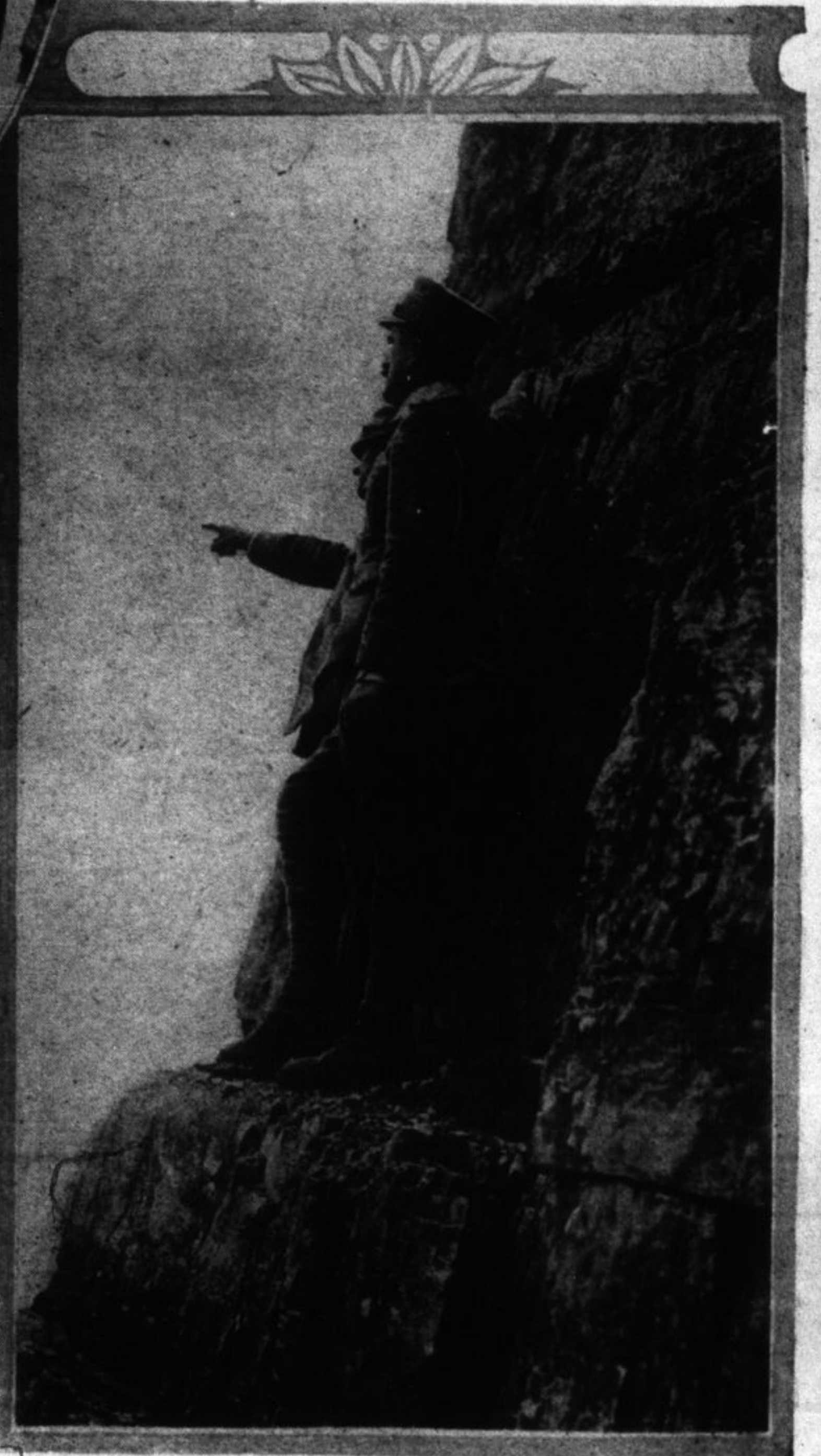
Italian officers observing the enemy.