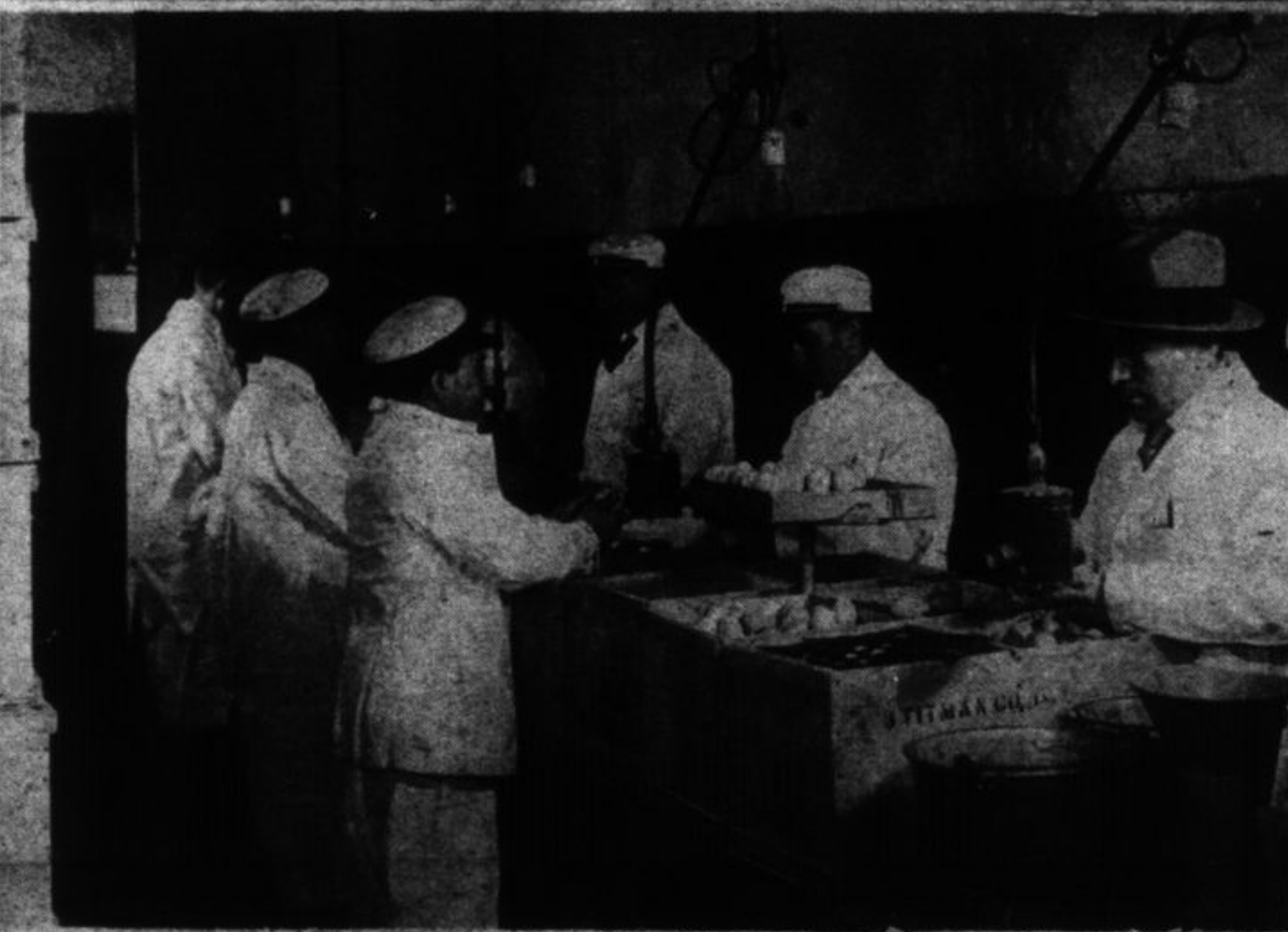
When England's colonial troops passed through one of the main streets of Paris a woman sprang out from the crowd of onlookers, and before anyone could interfere, succeeded in fastening a boutonniere in the straps holding a private's haversack. (Upper photo.)