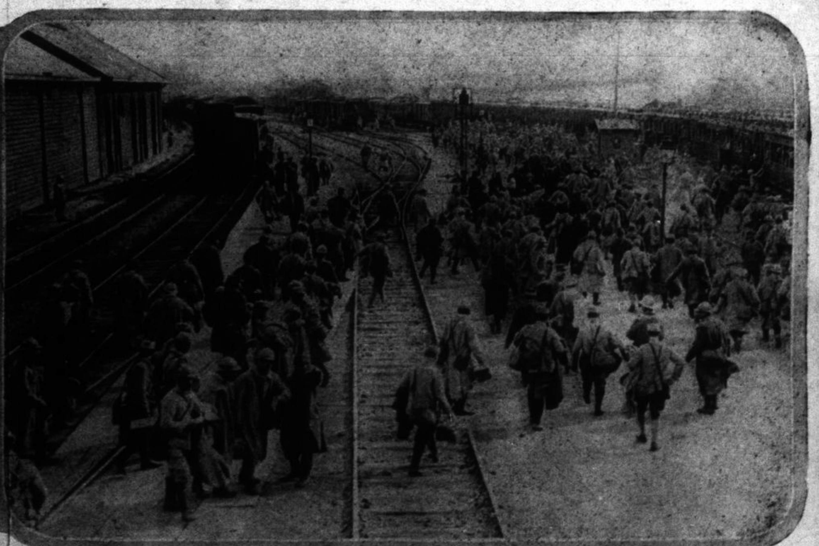
CROWDS OF "PERMISSIONAIRES" RETURNING TO THE FRONT. Large numbers of "Permissionaires" or soldiers on short leave taking train back to the fighting line. The men after their brief vacation eagerly return to their duties feeling quite at home in their trenches.