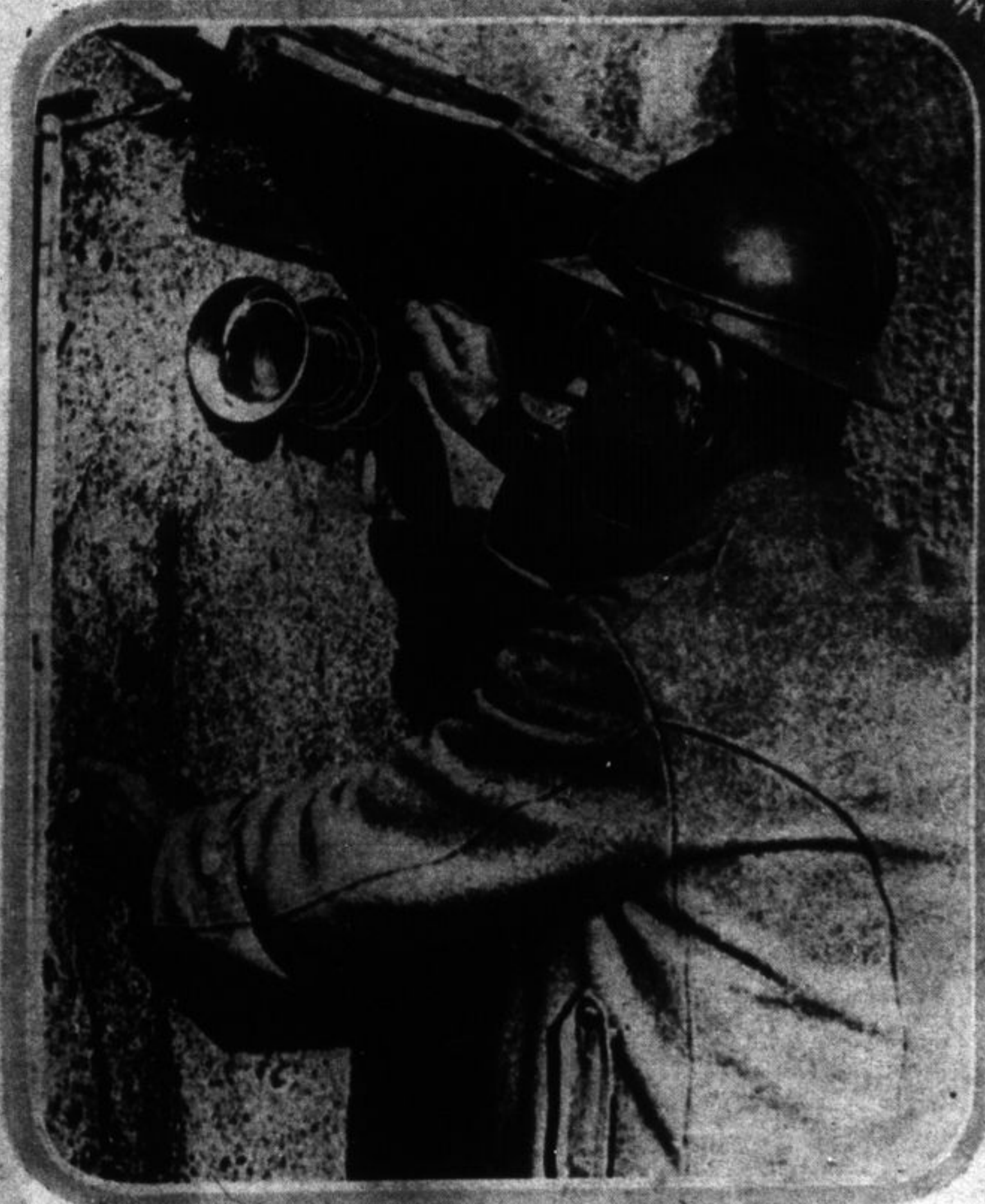
Below is a picture of an ambulance station on the Trentino front. In the background are the Toblach Peaks.

Auto sreecher used in the trenches to warn of intended gas attack.