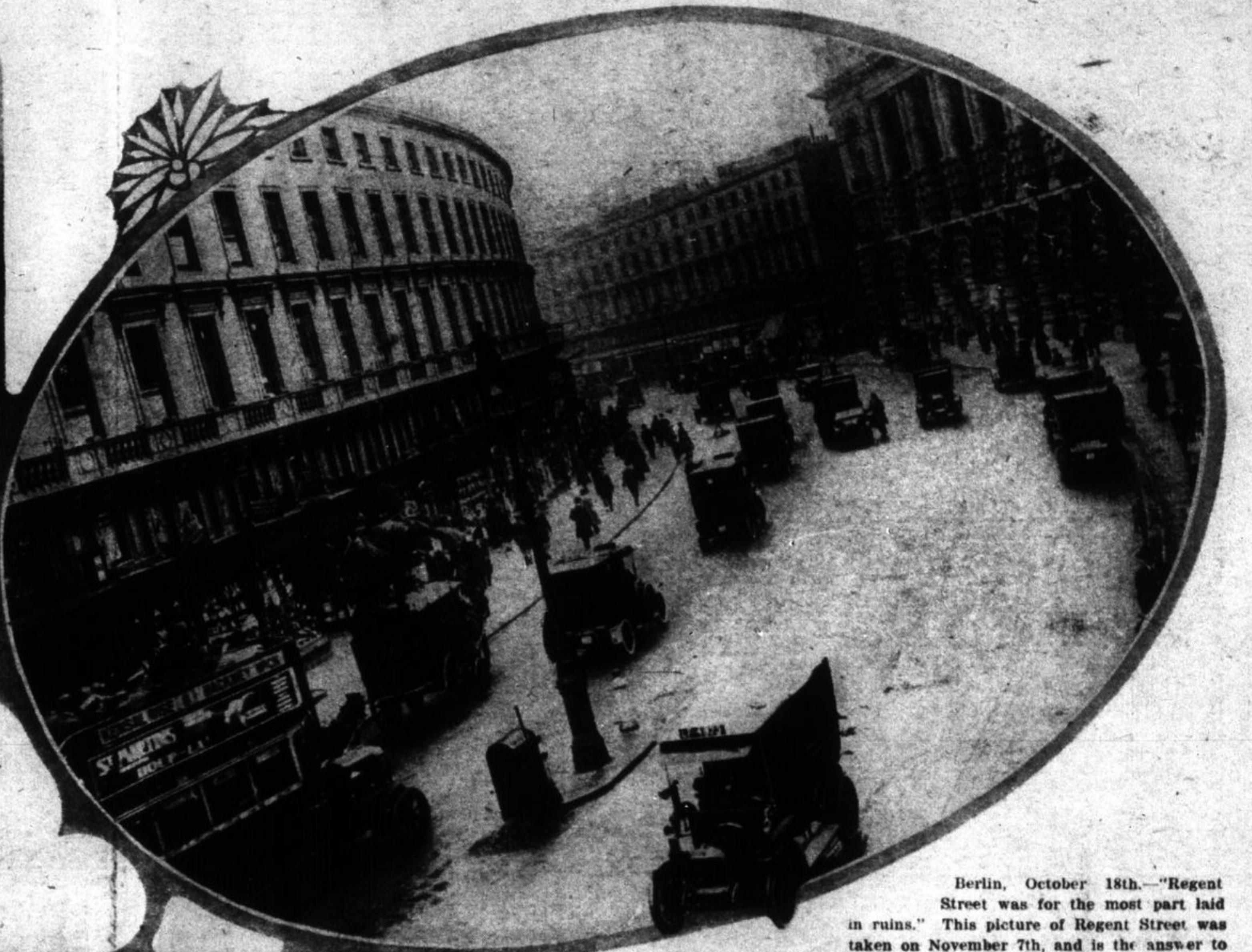
Berlin, October 18th.—"Regent Street was for the most part laid in ruins." This picture of Regent Street was taken on November 7th, and is the answer to the German report. The advertisement on the motor bus proves that the picture was taken since the alleged raid.