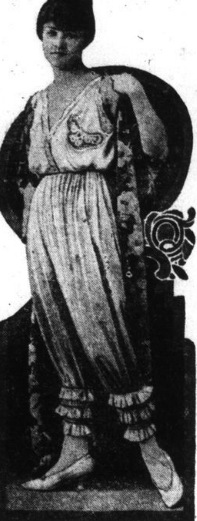
BOUDOIR TOGS. loons are of rose silk jersey with three ruffles of self-toned taffeta. A brocade robe in poppy colors is suitable for fastidious loafers.