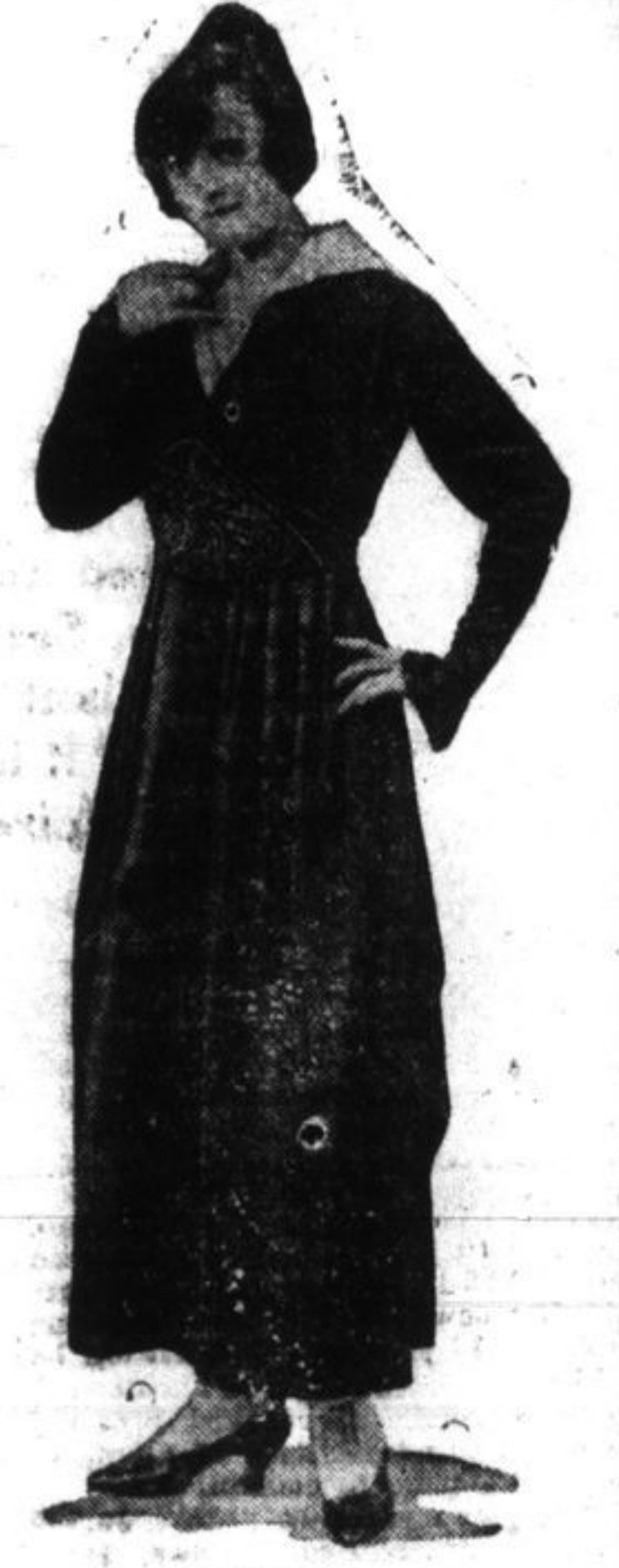
NEW MODEL. The gown distinction, however, are the dashes of metal embroidery around the knees and a triangular patch on the bodice.