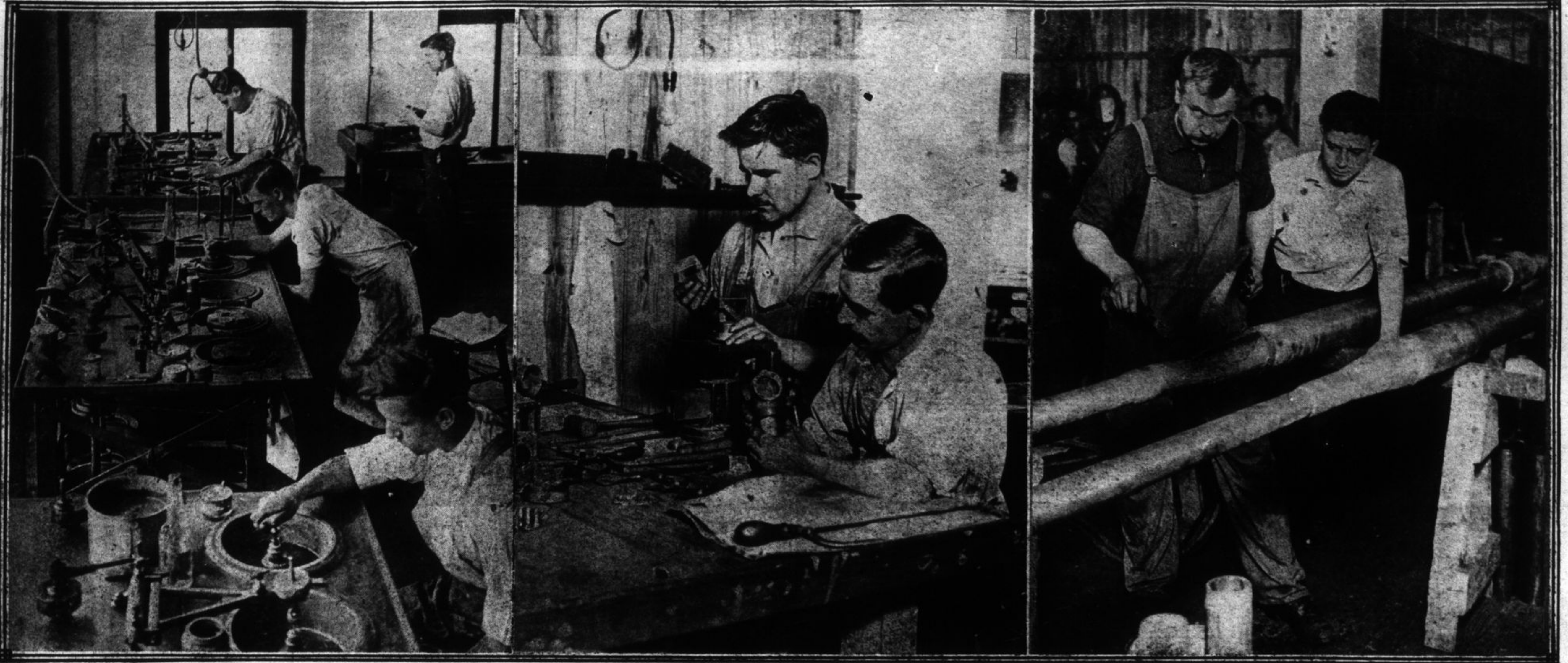
This picture shows workmen in a Brooklyn factory grinding and polishing the lenses for submarines ordered for Great Britain.