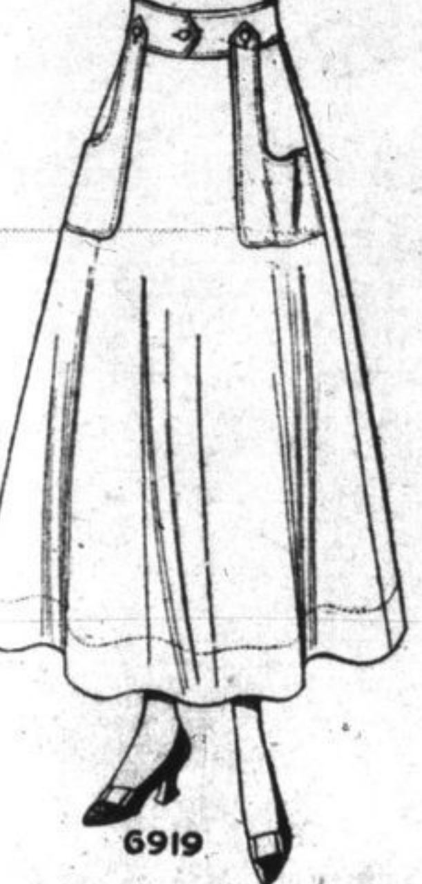
Meeting all the requirements of chic simplicity is this two-piece circular skirt. Although fashionably wide at the lower edge the skirt shows no decided flare.

It is remarkable how smart a simple skirt can appear, if properly made. Any soft material that will