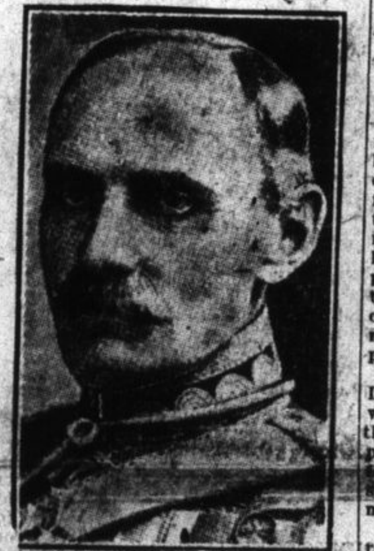
GENERAL PIERRE HOQUES, French Minister of War, who has reached Salonika on an important mission.

Ottawa, Nov. 8.—Protest against proposals which have been made to have oleomargarine placed on the free list are being received by the Government.