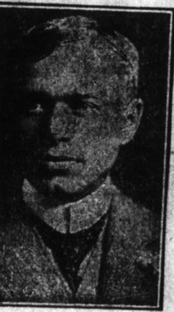
SIR MAX AIKEN The Canadian Hero-Witness has been made a baron.

Price 50c per box, three boxes for $1.25 at all dealers, or mailed direct on receipt of price by The T. M. Milburn Co., Limited, Toronto, Ont. Specify "Doan's" if ordering direct.