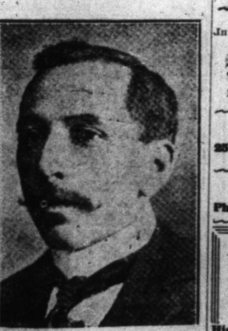
PREMIER W. MORRIS HUGHES OF AUSTRALIA