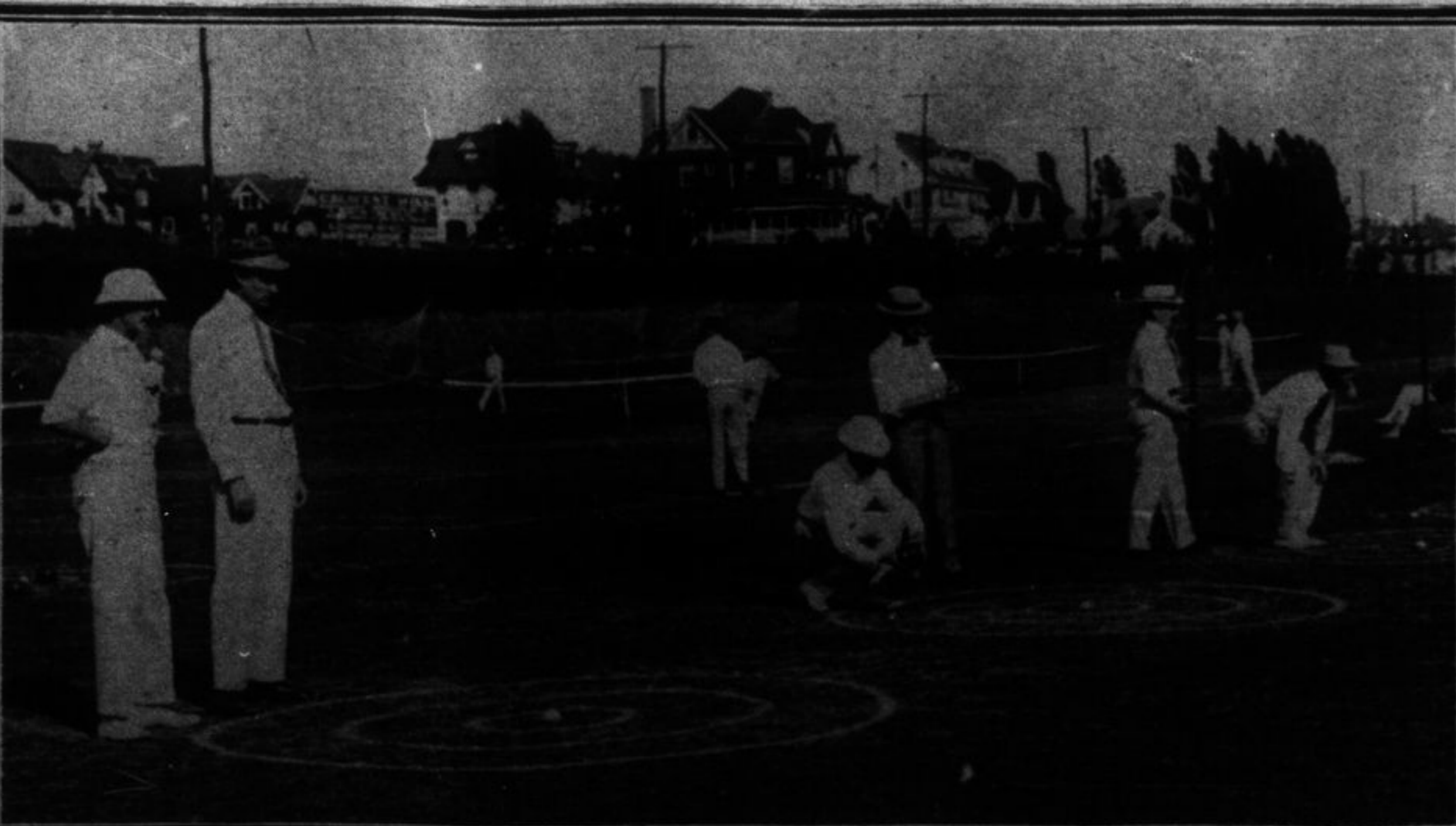
LAWN BOWLING IS PRACTICALLY NEW IN THE STATES. The Crescent Athletic Club of Brooklyn, N.Y., has many "allies" and is endeavoring to popularize the sport. They held a sort of tournament recently, when members of the Royal Yacht Club of Toronto, Canada, visited their allies, and the matches attracted quite an amount of attention.