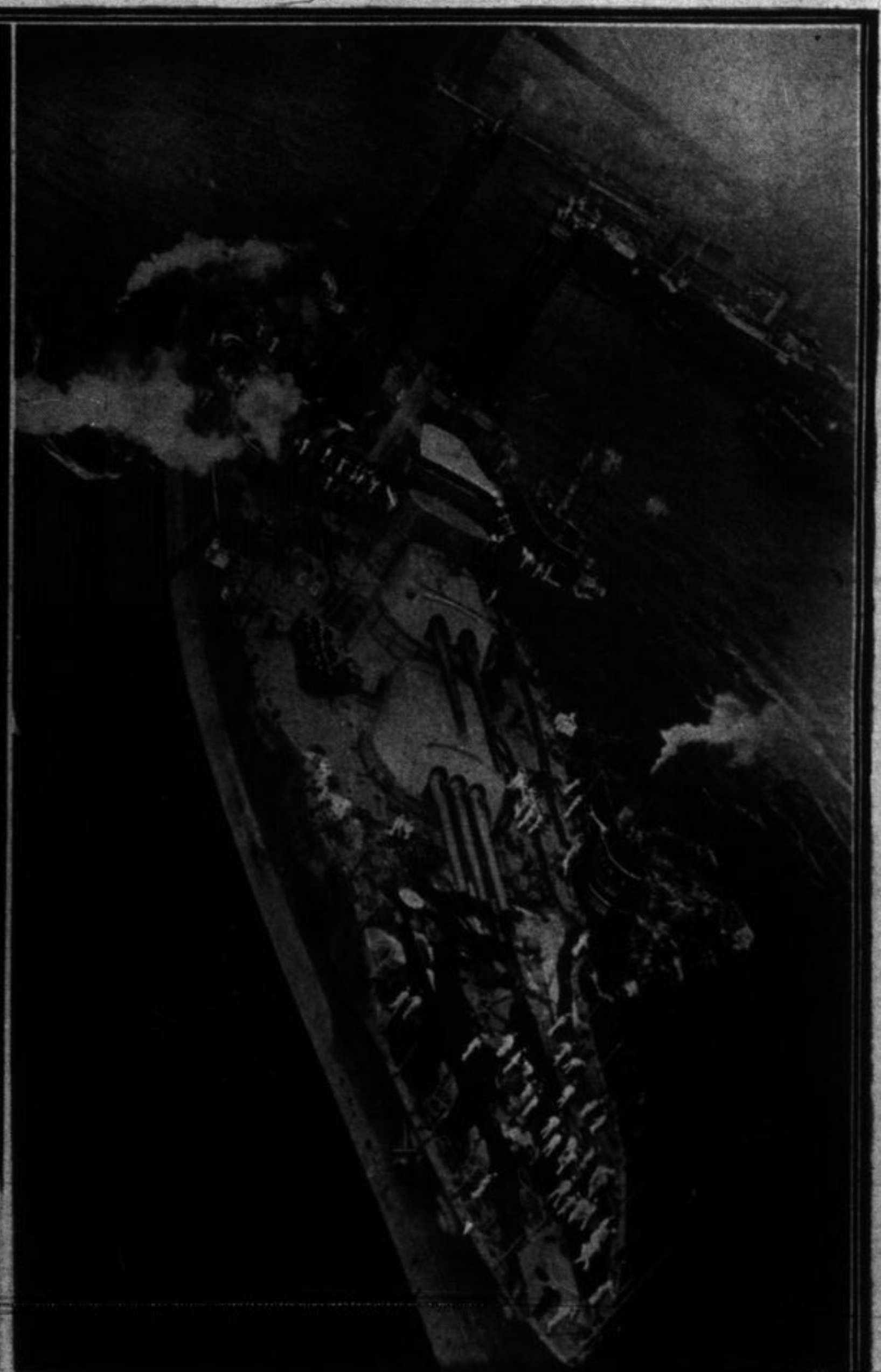
AN EXTRAORDINARY VIEW OF A BATTLESHIP.—The battleship "Nevada" passing up East River. Two turrets of the "Nevada," which carry three fourteen-inch guns, are to undergo changes that will make the firing of the battleship more efficacious. Improved gears are to be put in the gun carriages. Our photo shows the vessel, passing up the East River to the Navy Yard.