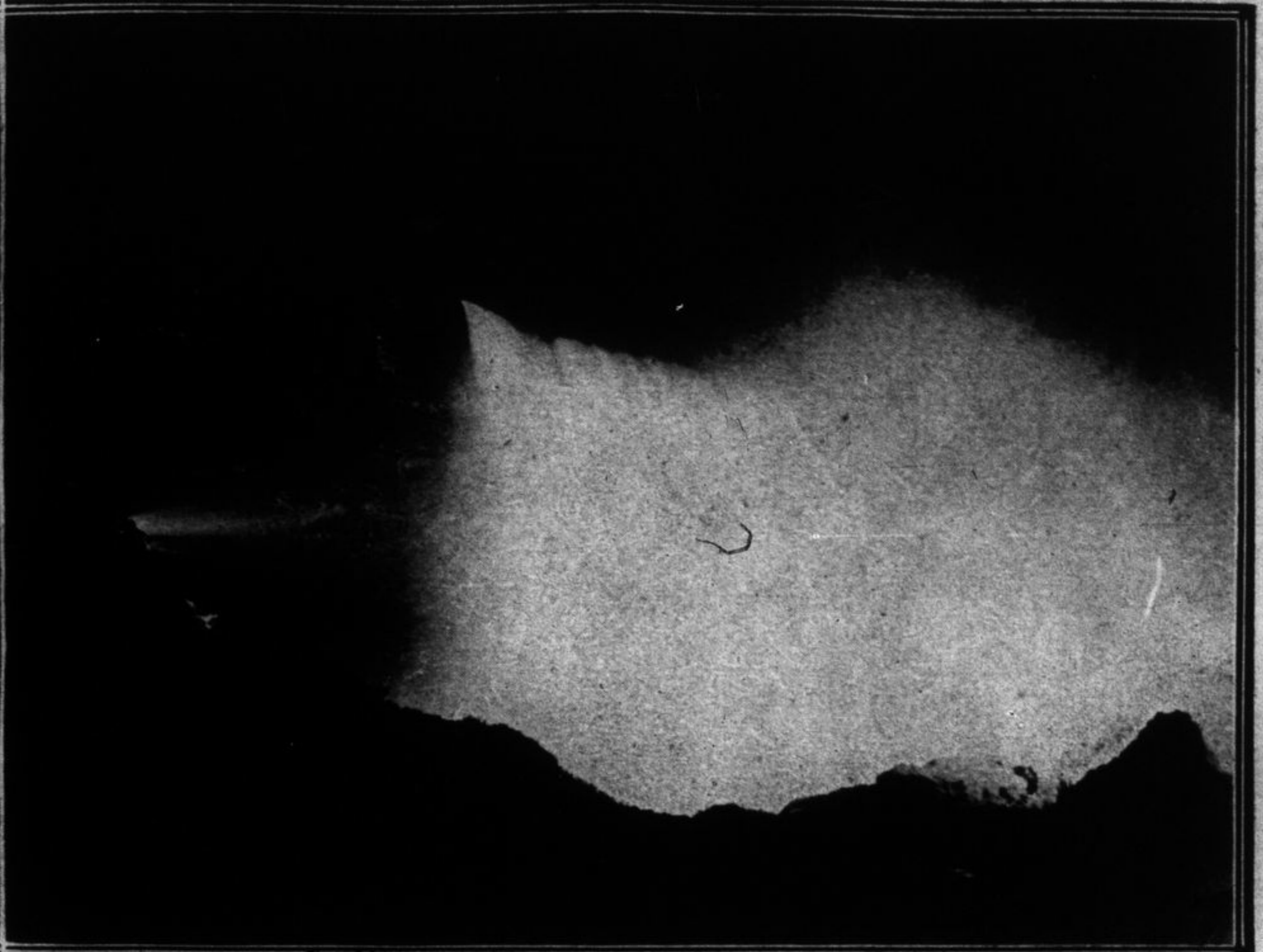
ATTEMPTS IN THE PAST TO ILLUMINATE THE NIAGARA FALLS at night have never been as successful as that which is now lighting up the Falls. One hundred huge electric lights, each of 500,000, have been arranged along the falls and rapids. The flow of radiance is said to be of startling beauty. The lamps are hidden in day time behind barriers of rock so as not to spoil the natural beauty of the falls.