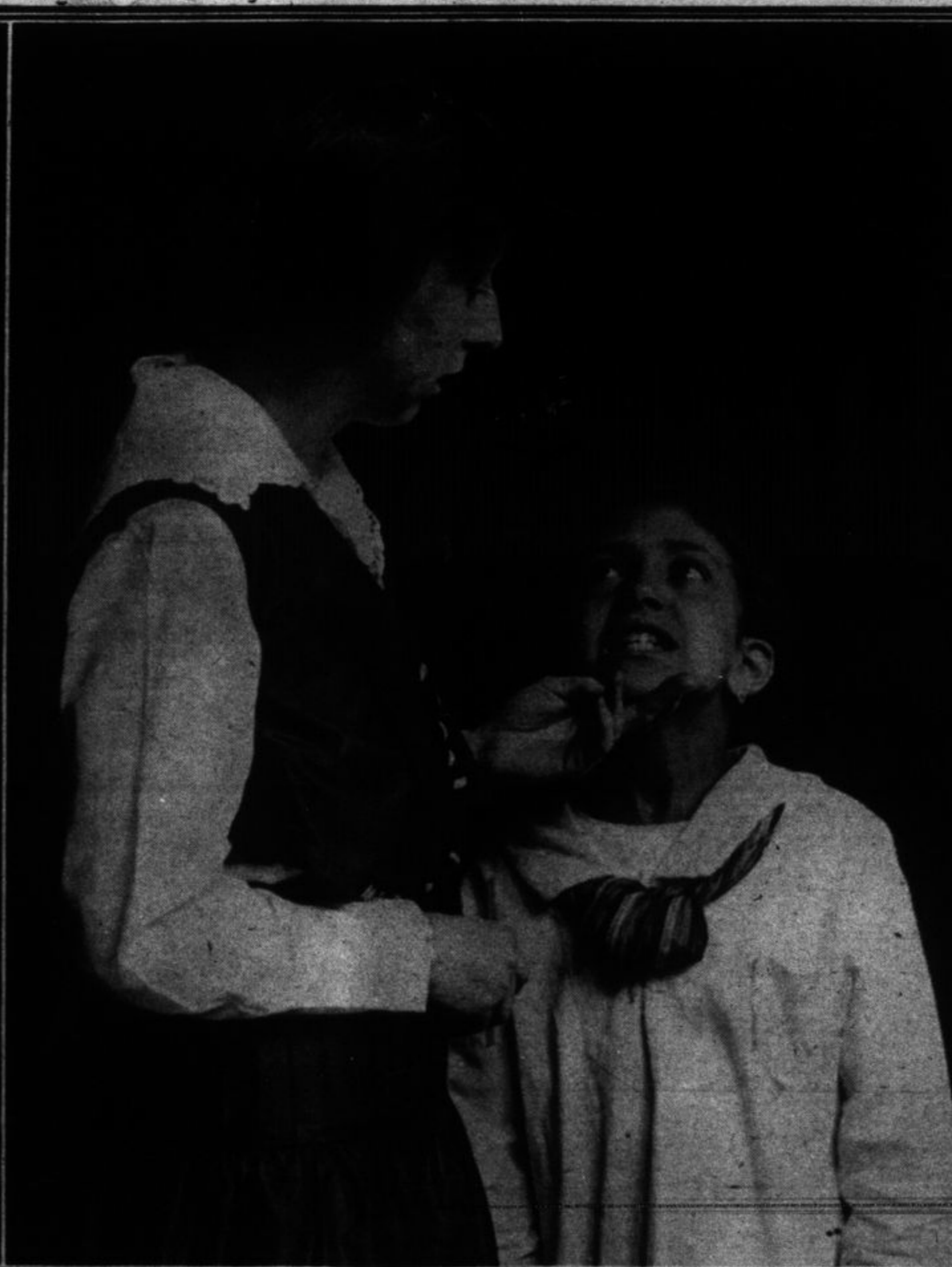
OPENING OF PUBLIC SCHOOLS IN NEW YORK. Doctor examining the teeth of a scholar.