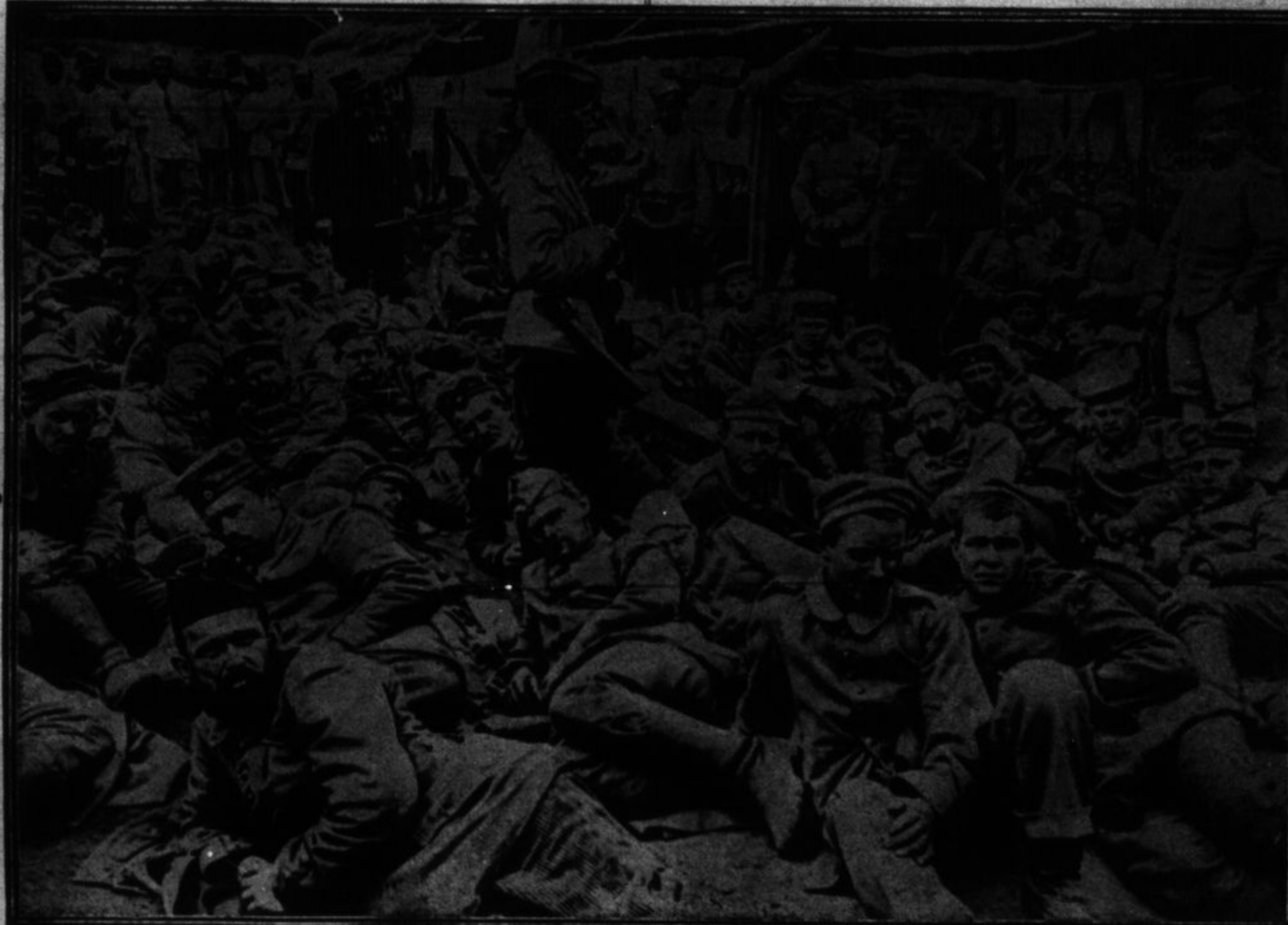
CAPTURED ON THE SOMME FRONT. German soldiers who have been made captive by the French during the offensive on the Somme.