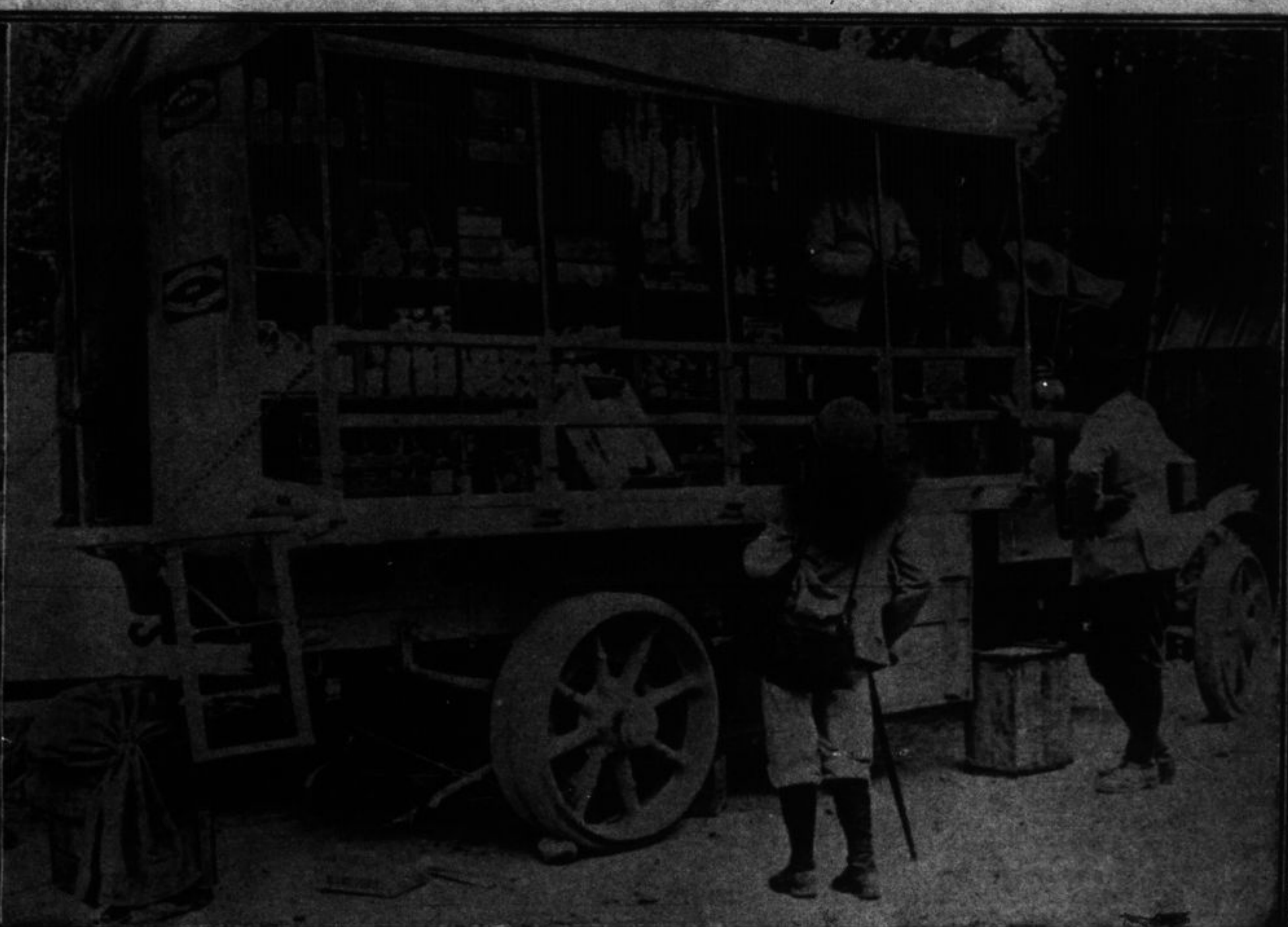
MOTOR GROCERY STORE ON FRENCH FRONT. In order to eliminate the profit of the middleman, who have made a habit of charging exorbitant prices for dainties purchased by the soldiers at the front, these travelling delicatessen stores, vending tid-bits, have been organized by the government, and edibles can be purchased by the soldiers for little money.