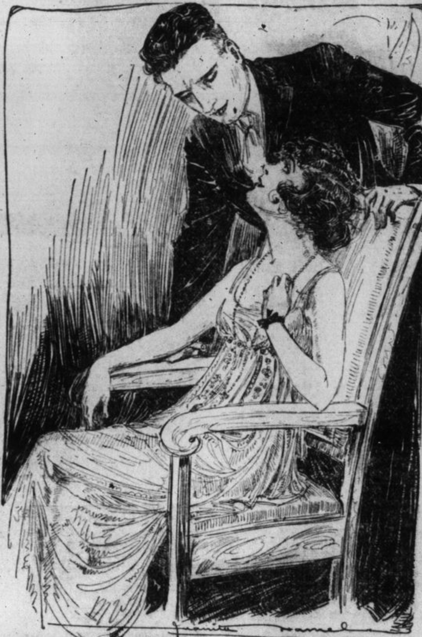
Arthur came over and kissed me. "You look tired," he said.

Dr. Pierce's Golden Medical Discovery is a blood cleanser and alterative that starts the liver and stomach into vigorous action. It thus assists the body to make rich, red blood, which feeds the heart, nerves, brain and organs of the body. You feel clean, strong and vigorous.