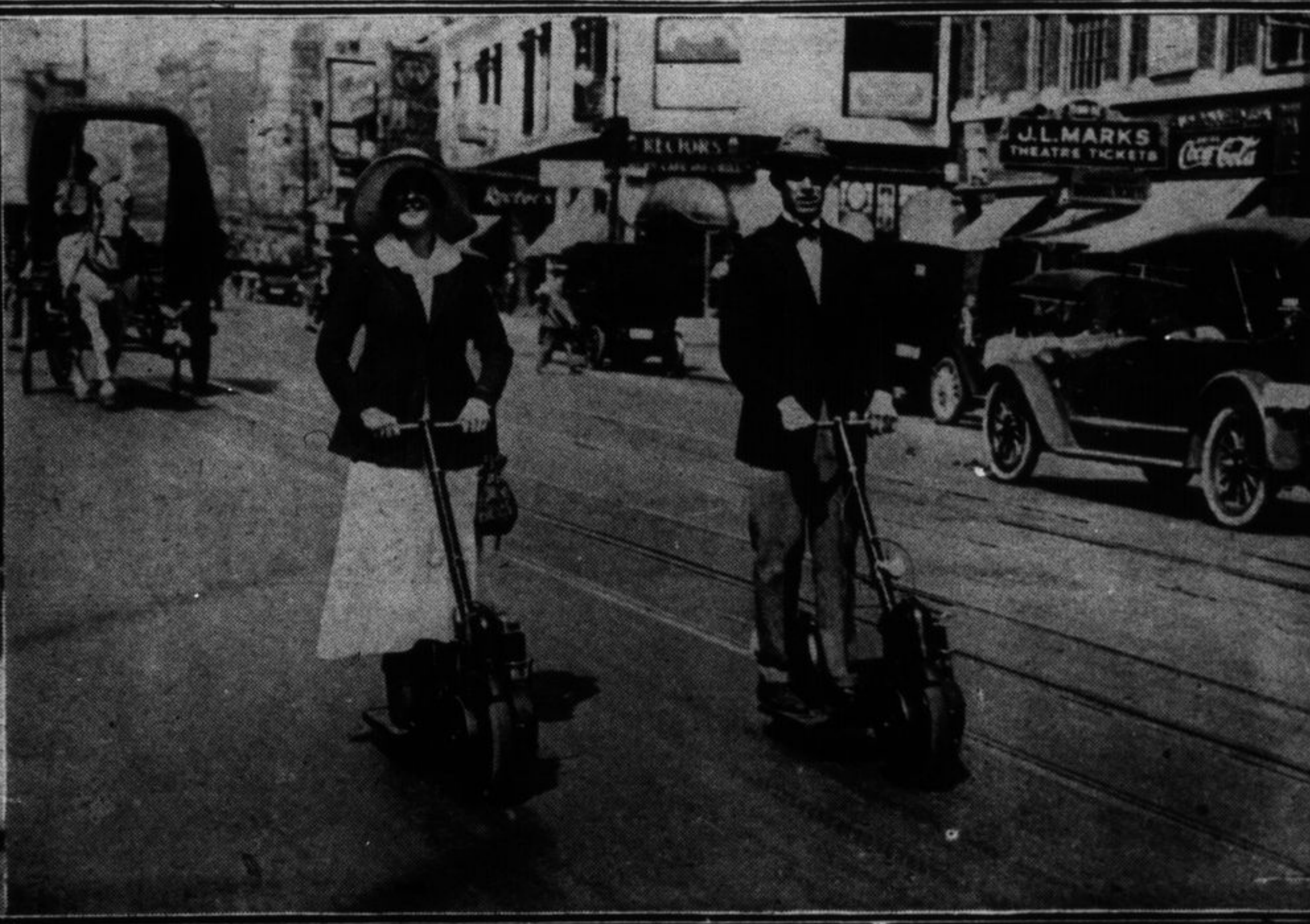
LATEST MEANS OF LOCOMOTION.

For the second time in a month New York city is facing a tie-up of its transportation. Half of the street cars are idle and many enterprising auto owners reaped a harvest of quarters and half-dollars by carrying home from work those who were unable to squeeze into the subway and "L" trains.