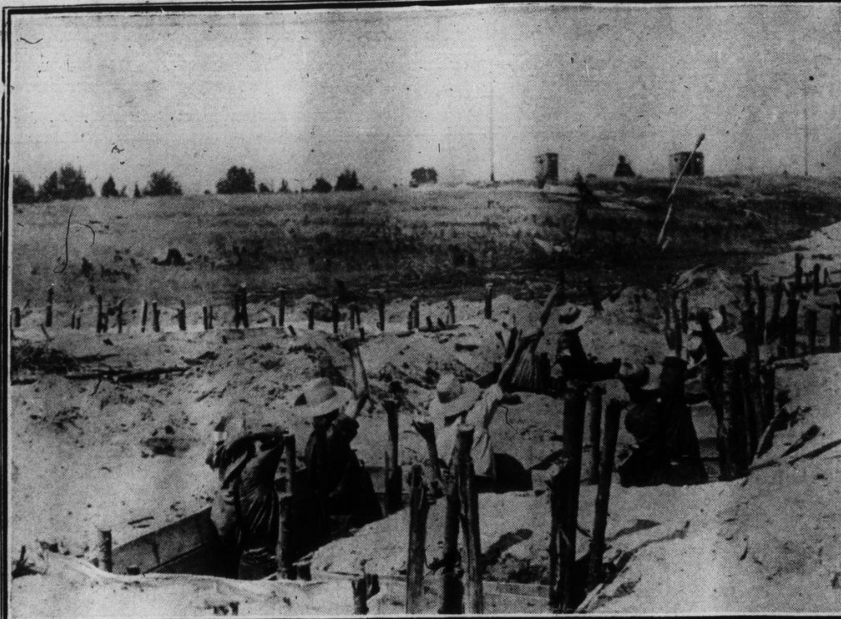
THE 9TH AMERICAN LEGIONERS AT VALCARTIER LEARNING THE ART OF TRENCH FIGHTING. Trench squad being instructed in the ways of bomb throwing.