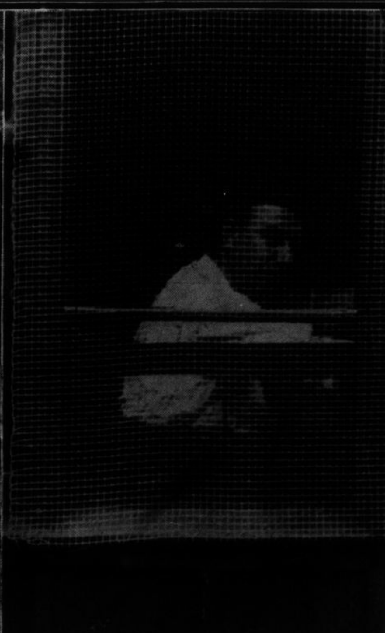
How the motormen of the subway and elevated trains in New York are being protected from strikers.