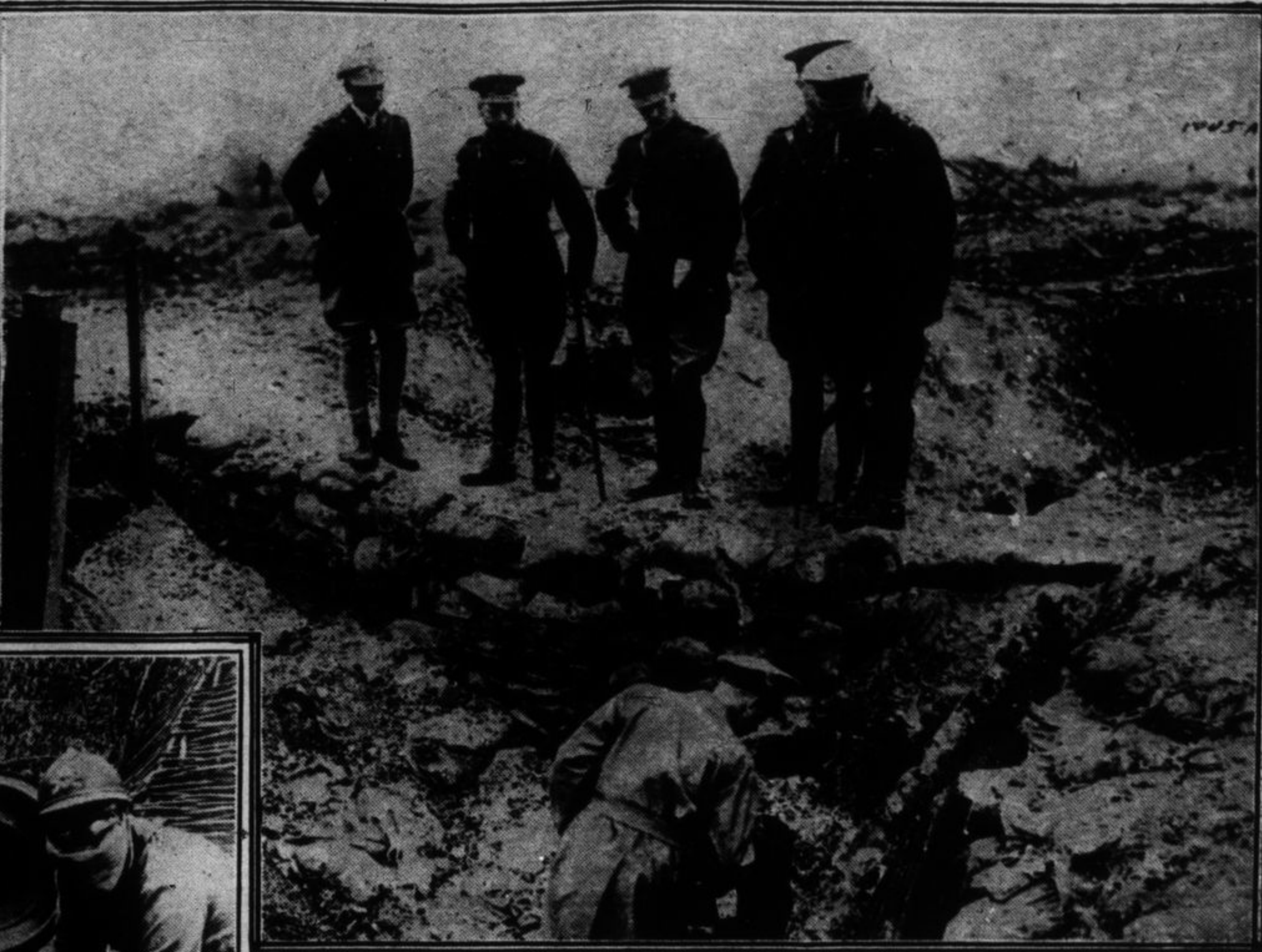
PHOTOGRAPH OF KING GEORGE'S VISIT TO THE SOMME FRONT. The King and the Prince of Wales (in trench) visit a captured German trench at Fricourt.