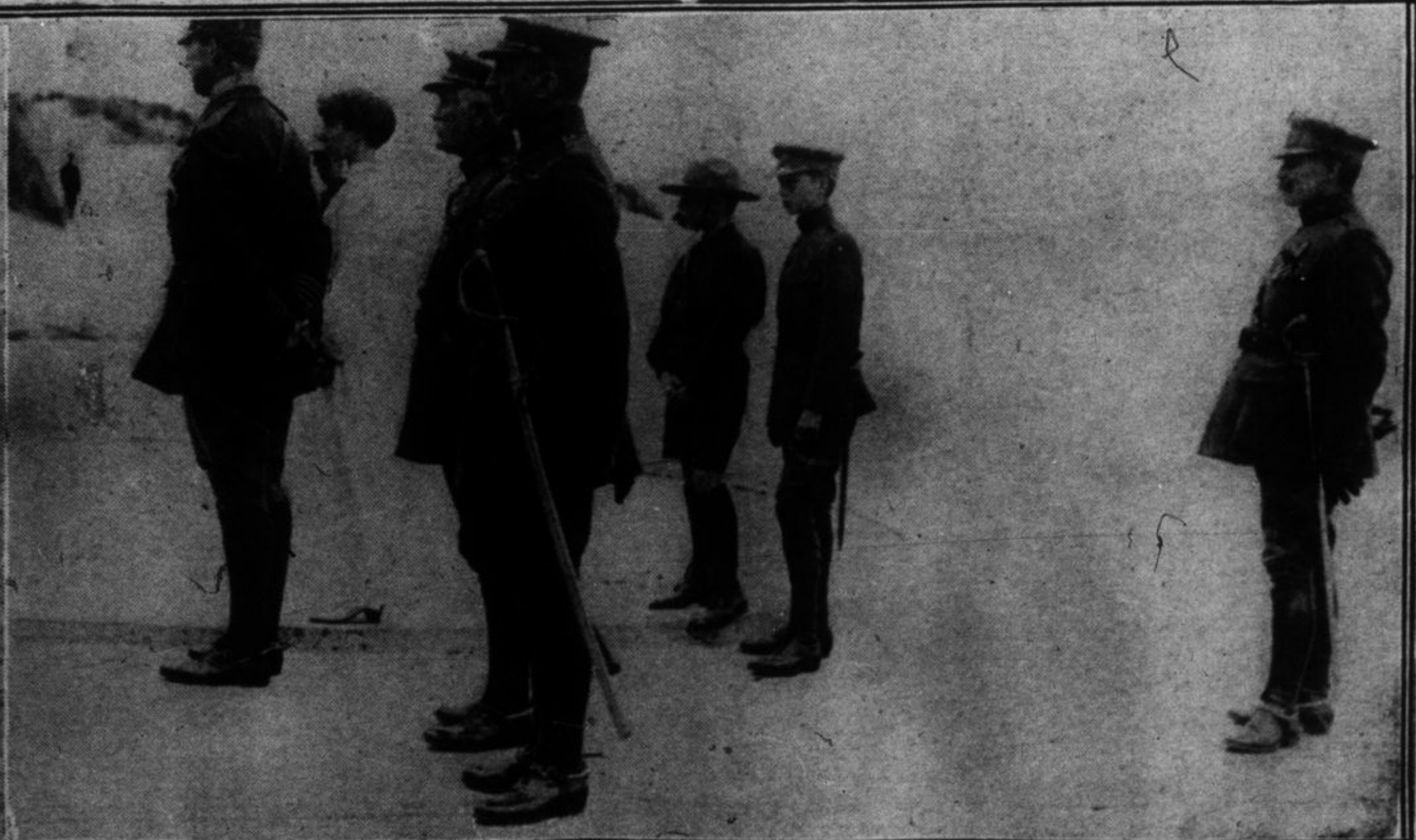
KING AND QUEEN OF BELGIUM VISIT THE SOMME. Photograph shows King Albert and the Queen of Belgium and their sons visiting the Somme.