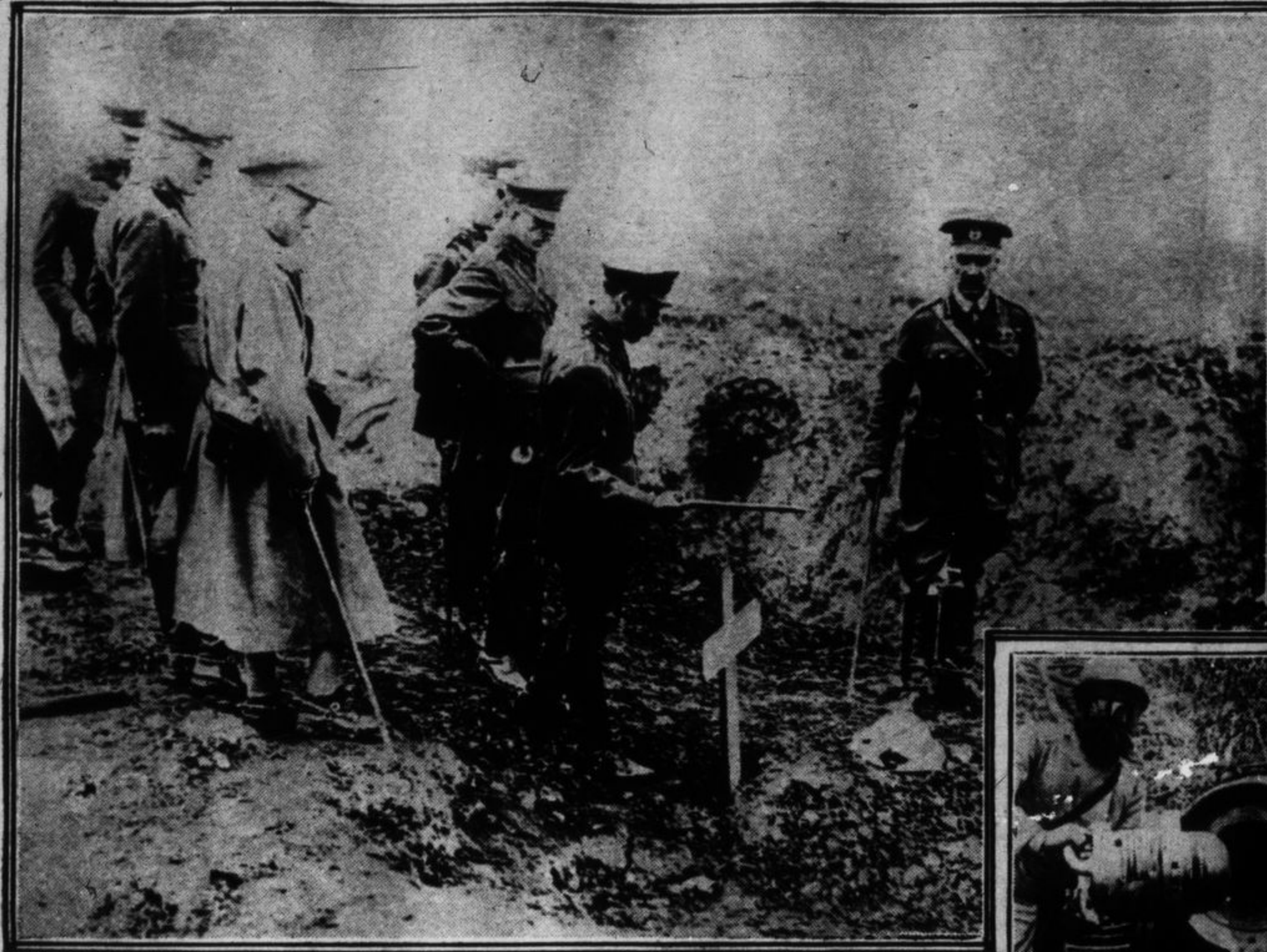
PHOTOGRAPH OF KING GEORGE'S VISIT TO THE SOMME FRONT. The King at the graveside of Pennington, on the Somme battlefield.