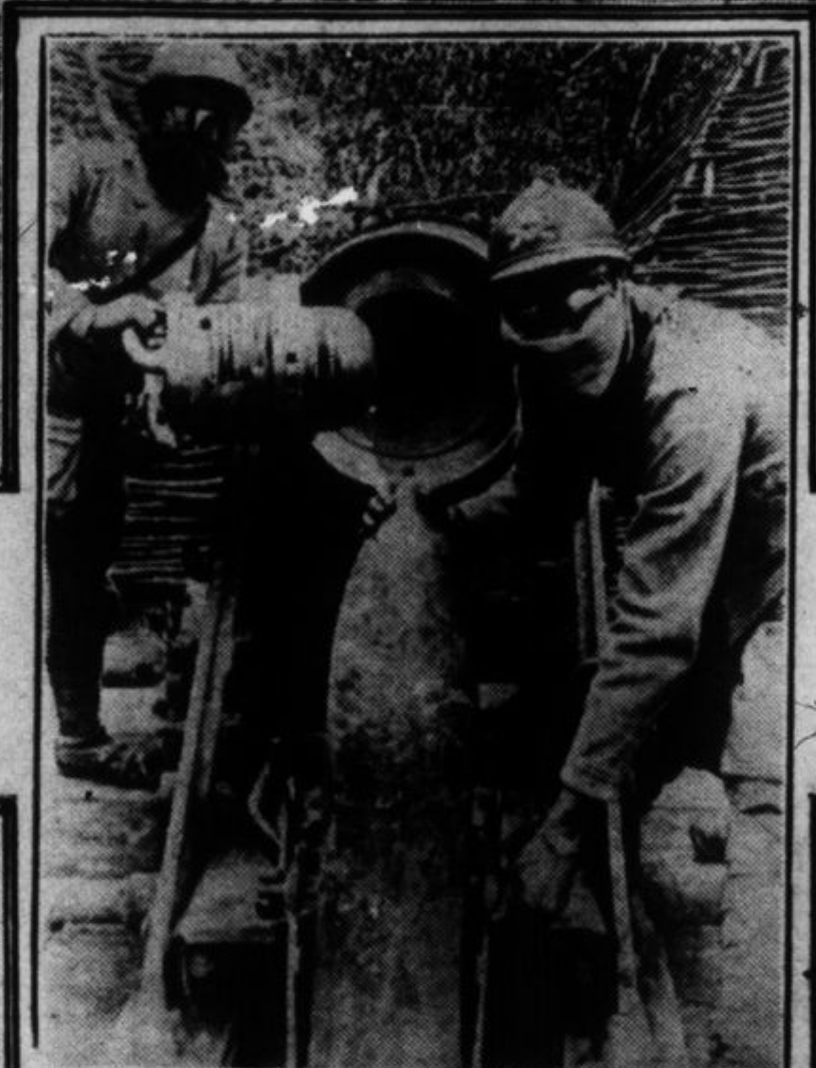
ON THE SOMME FRONT.—A shell of 155 millimetres being set into place. The men are equipped with gas masks. On one of the gunners can be seen a wrist watch, which is welded to his arm, and is stamped with the wearer's number, which is recorded in Paris for identification purposes.