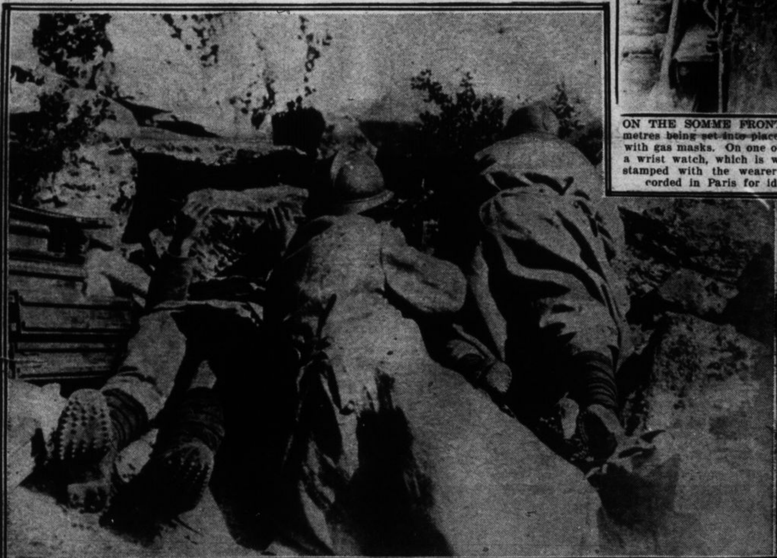
WITH THE FRENCH FORCES ON THE SOMME FRONT. Gunnery with rapid fire gun behind barrier of rocks. Note how the soldier holding the cartridge belt must lie on his back while the gun is being fired.