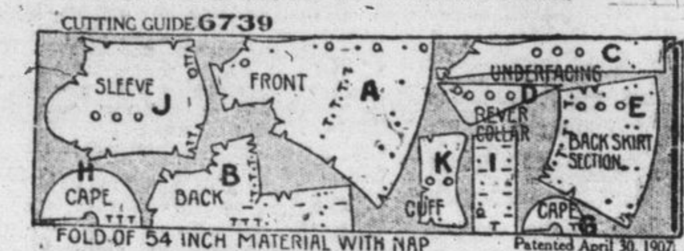
Pictorial Review Jacket No. 6739. Sizes, 34, 36, 38, 40, 42 and 44 inches bust. Price, 15 cents. Skirt No. 6787. Sizes, 22 to 32 inches waist. Price, 15 cents.

The front of the jacket may be finished simple with revers and a flat collar, if this be preferred to a more elaborate effect.