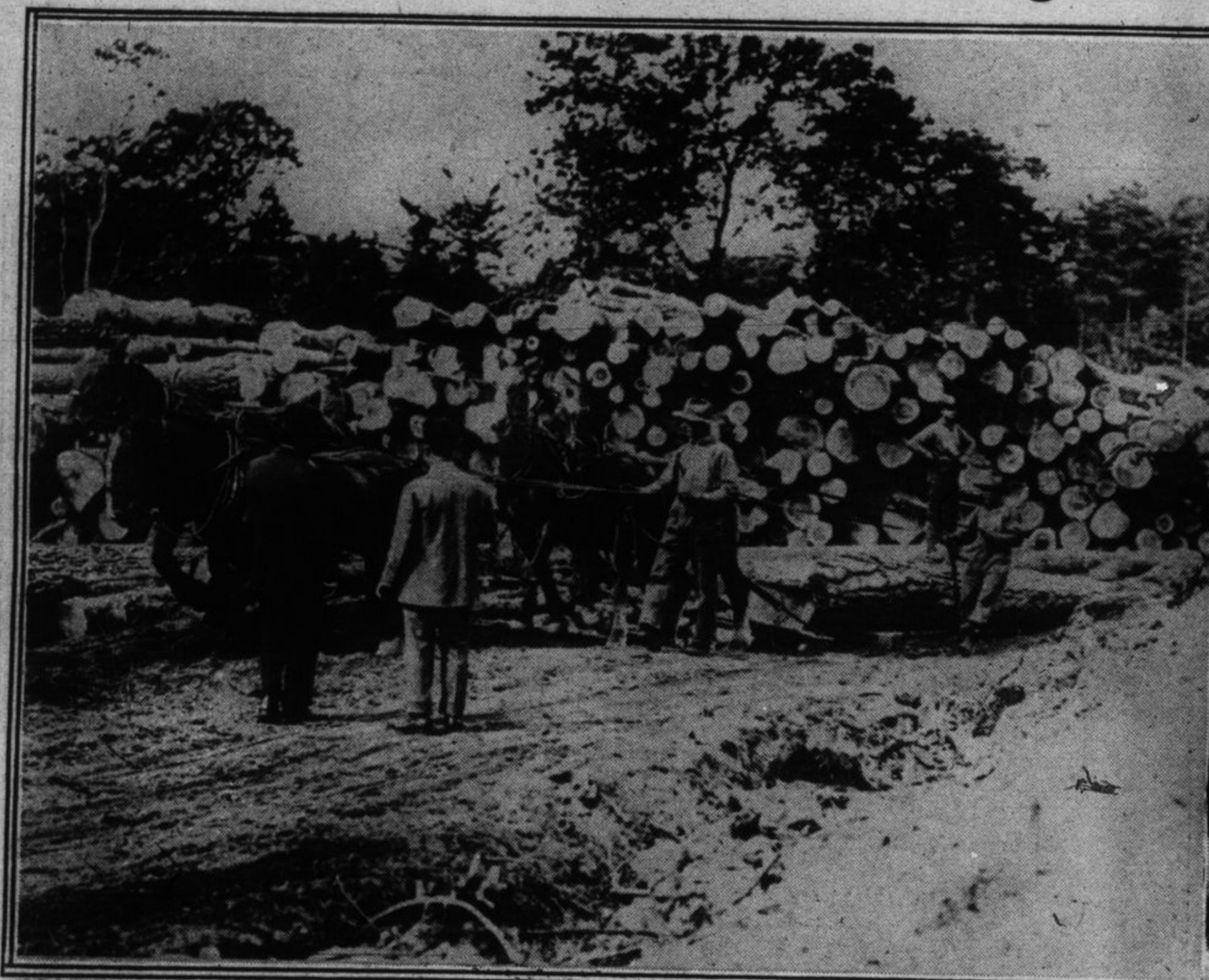
A Canadian lumber camp in an English forest. The Canadian Forestry Battalion at work in Windsor Forest, at their new saw mill, where the felled trunks are sawn up into planks. A large part of these boards will be used for supports in the trenches. Four horses are used to draw one of the heavy trees. Note stack of logs behind.