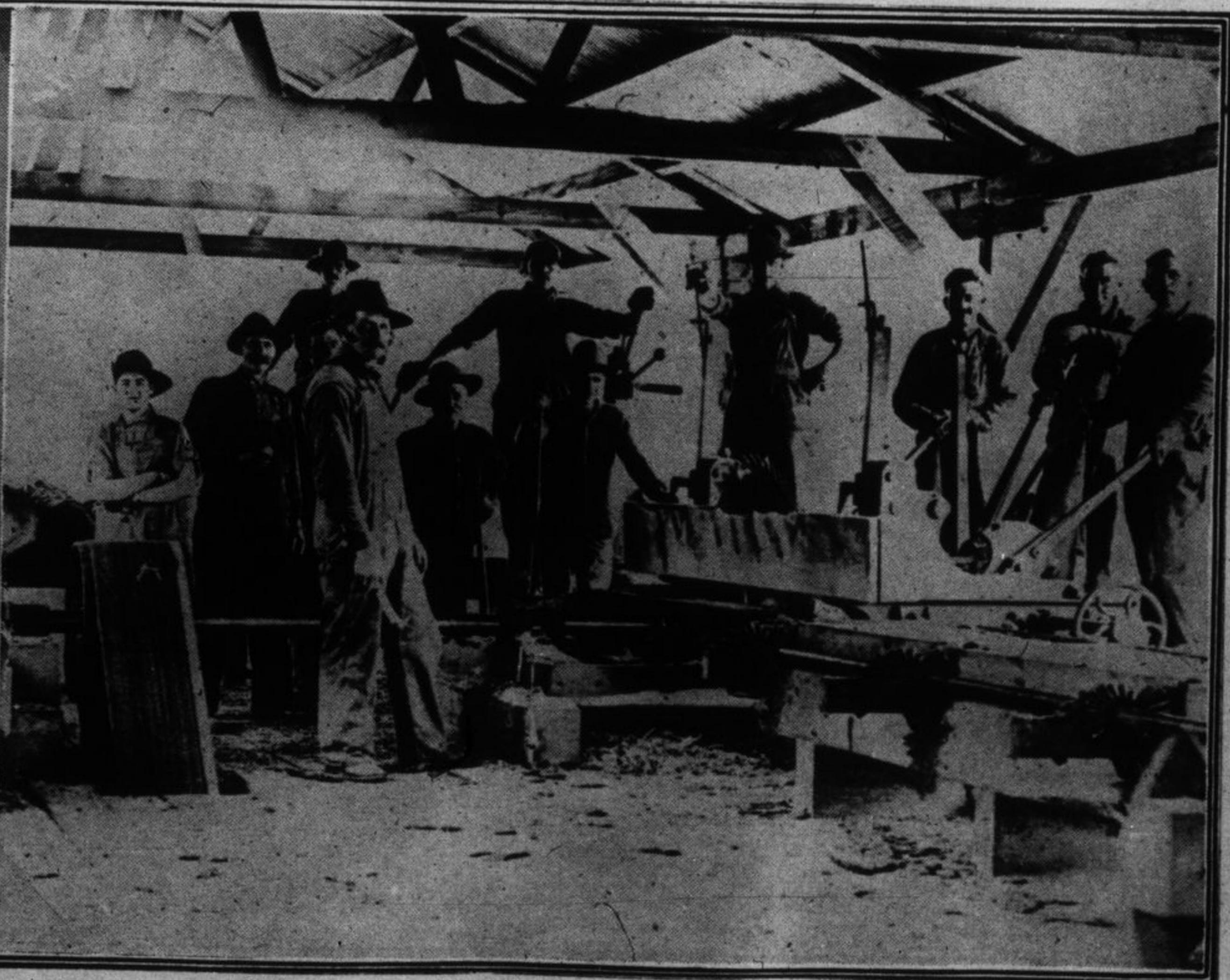
Inside the saw mill. The circular saw cutting up the trees into planks.