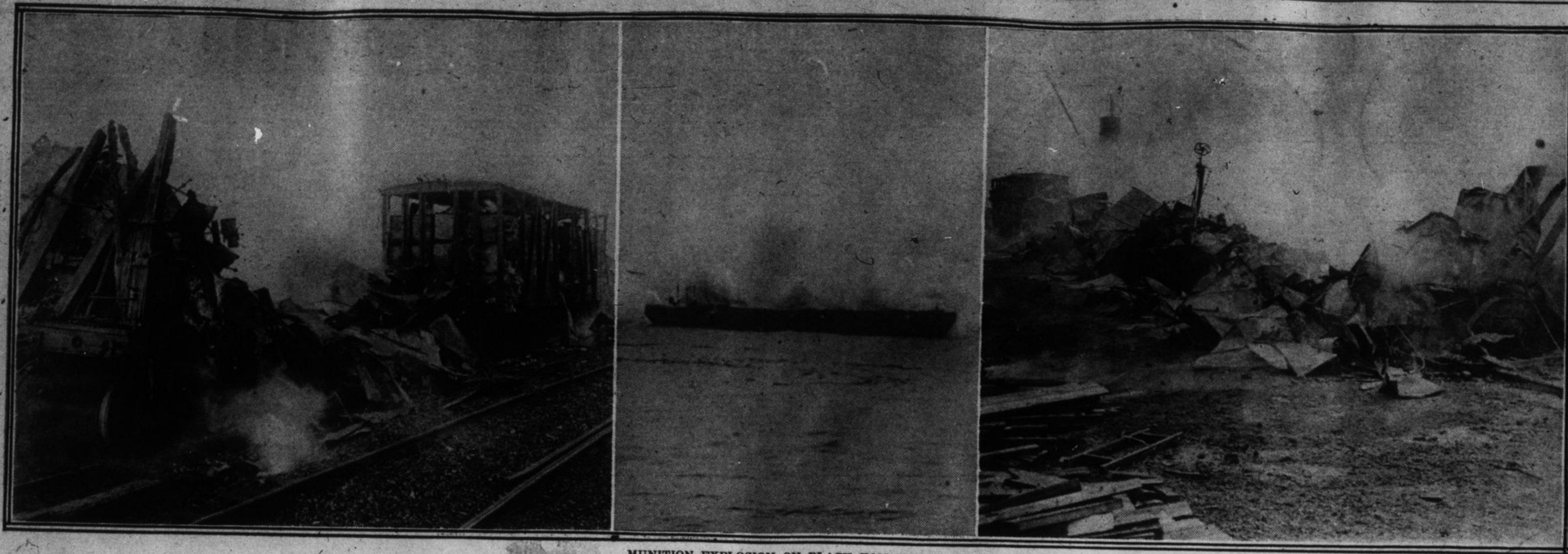
MUNITION EXPLOSION ON BLACK TOM ISLAND.

Just a few of the hundred freight cars that contained shrapnel and ammunition that were destroyed by the explosion.