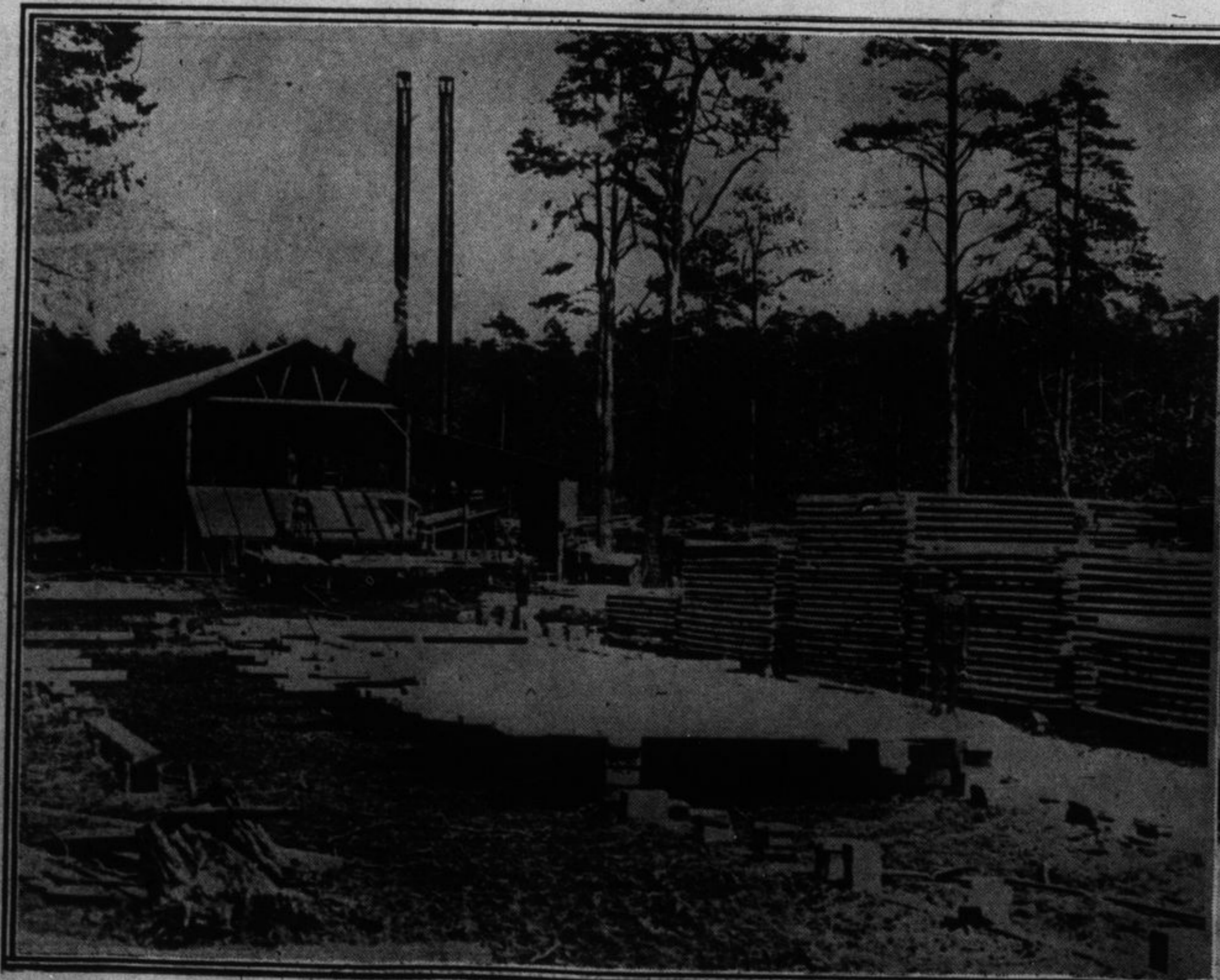
View of the mill and part of the camp where the cut timber is stacked to dry.