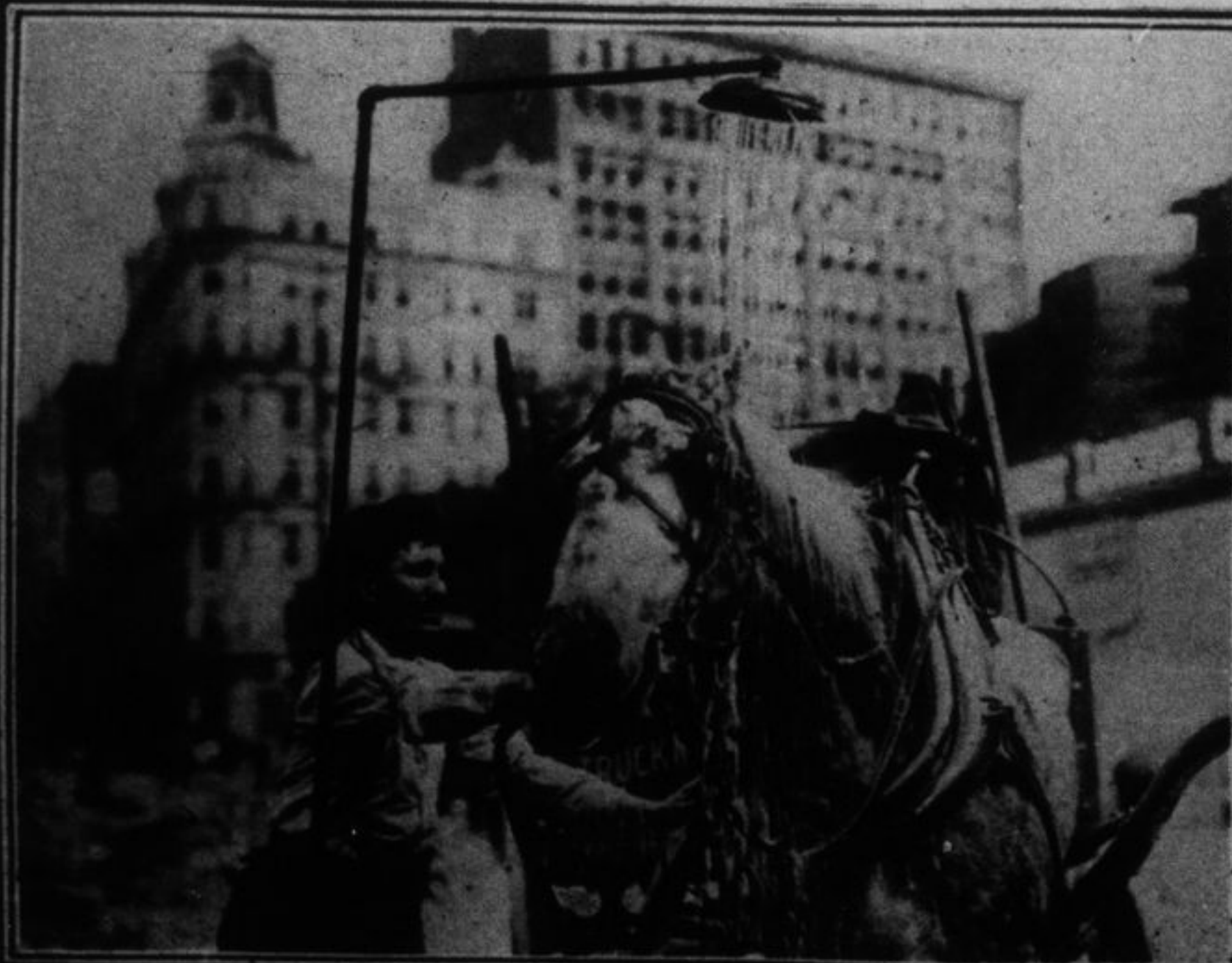
SAVING THE HORSES—One humane person in New York has hit upon a good way to lessen the heat burden on the city's horses. Just off Broadway, where the traffic is always great, he has erected a showerbath, which can be moved along the side of the animal, wetting it complete with a gentle shower from head to tail. This way is far superior to the old, where the water is thrown on the horses by the bucketful.