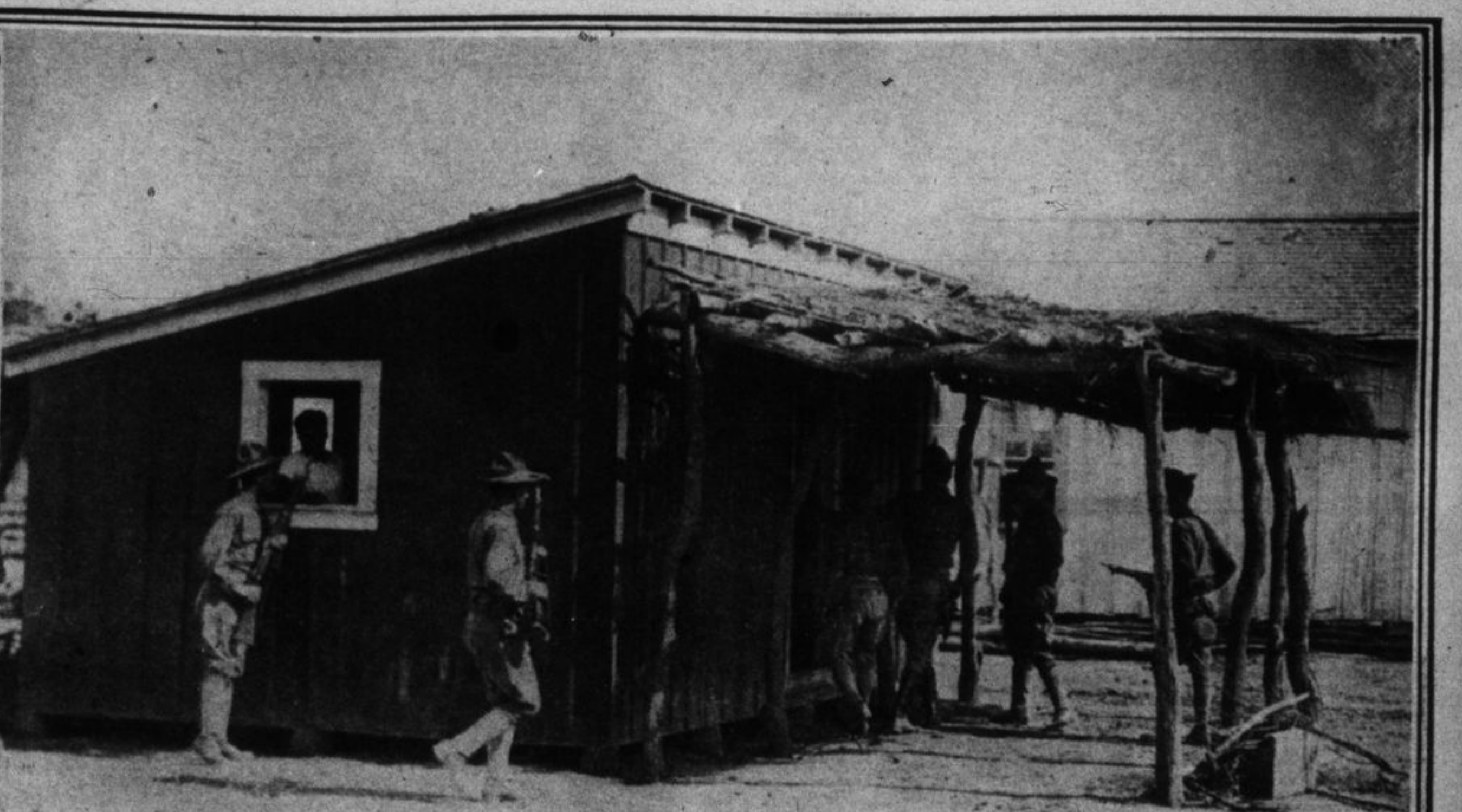
Every precaution is taken to prevent sniping by the Mexicans in any of the Texas towns where the boys are stationed. Photo shows members of the 2nd Regiment of Texas searching home of Mexican in Madero City, Texas, for weapons.