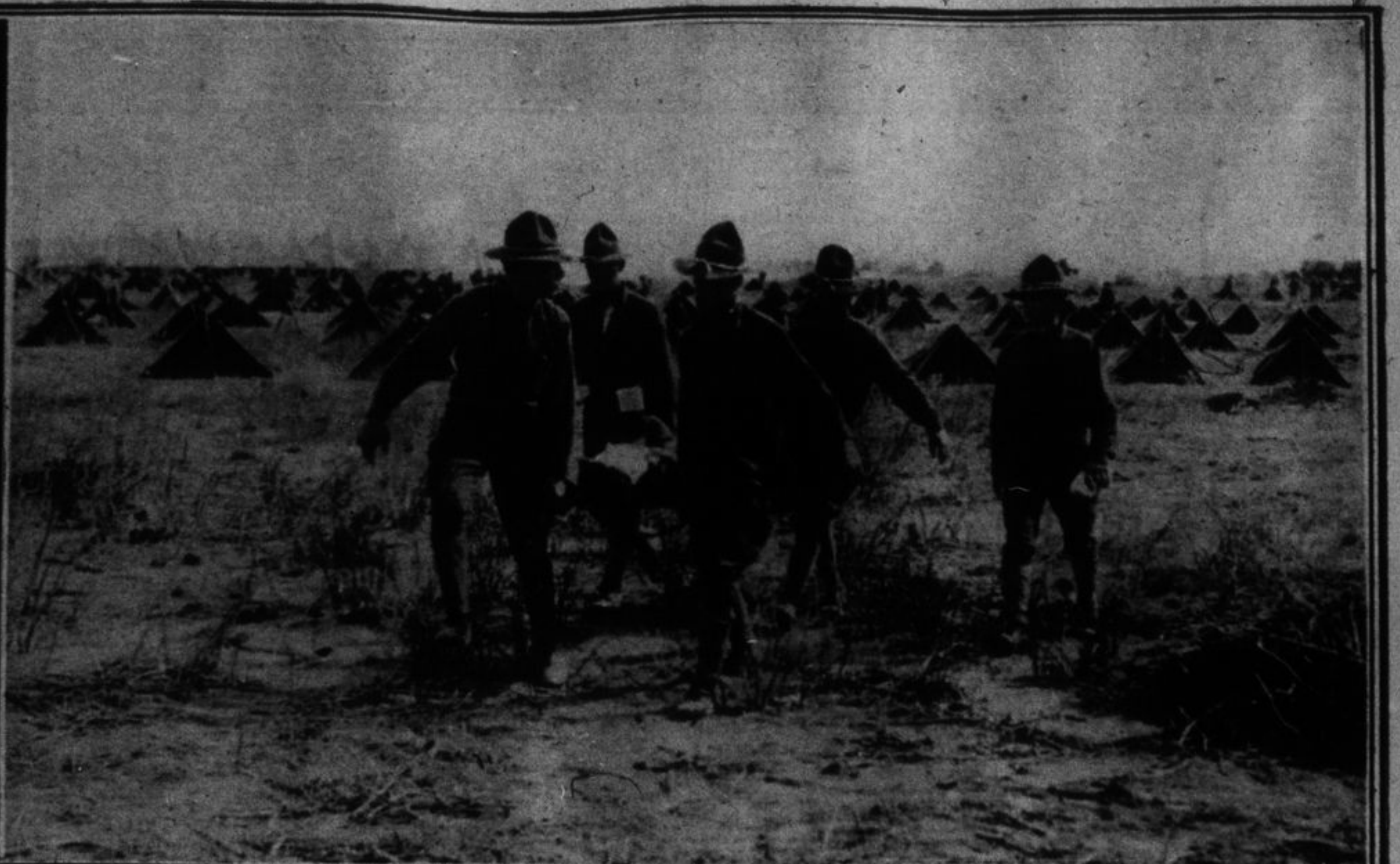
Many of the militiamen stationed at the border have been victims of the terrific heat, which scorches and blisters. Photo shows comrades removing member of 12th Regiment to hospital, after being overcome by the heat.