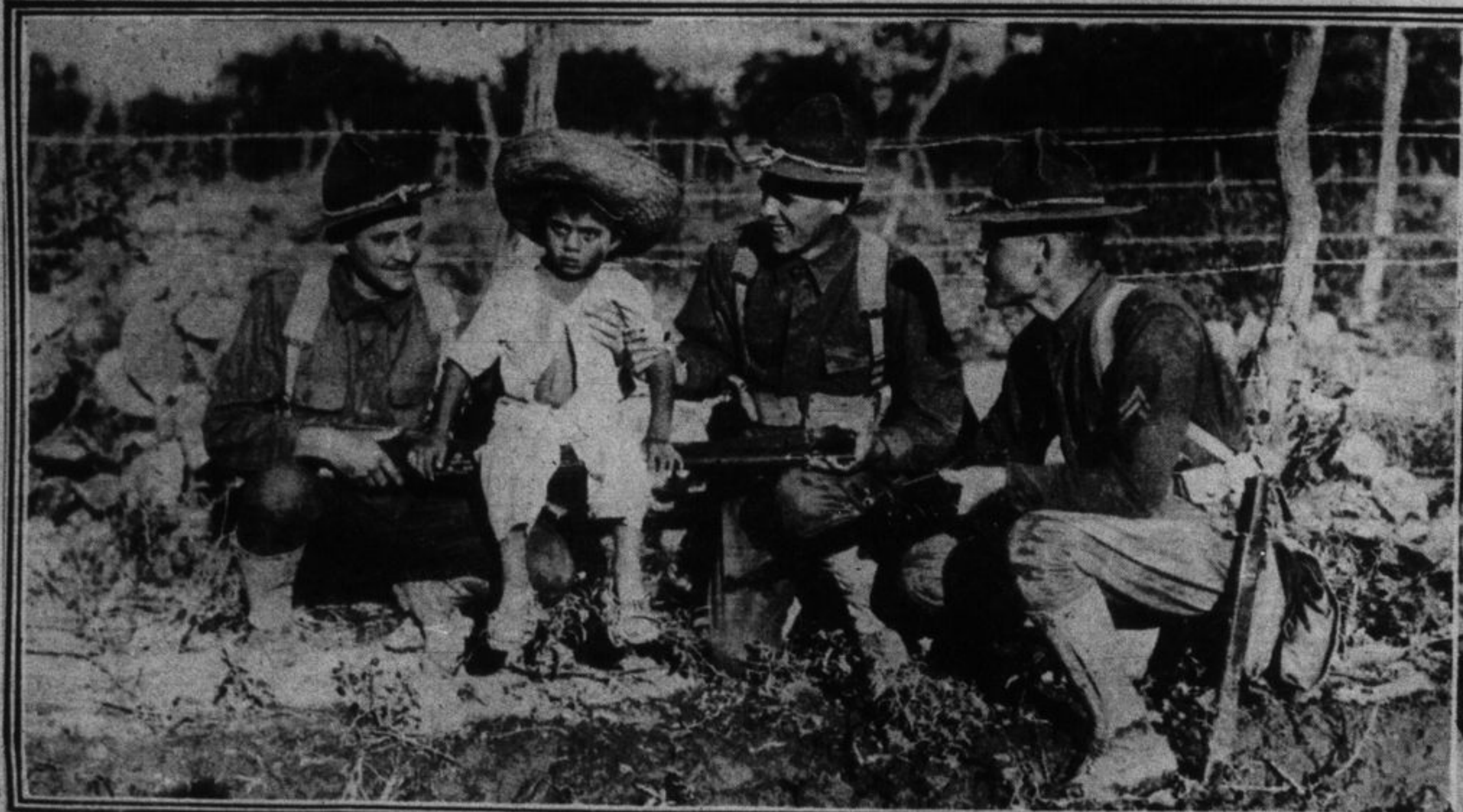
ONE FRIENDLY MEXICAN, AT LEAST. Members of the New York 71st make friends with a little Mexican boy at McAllen.