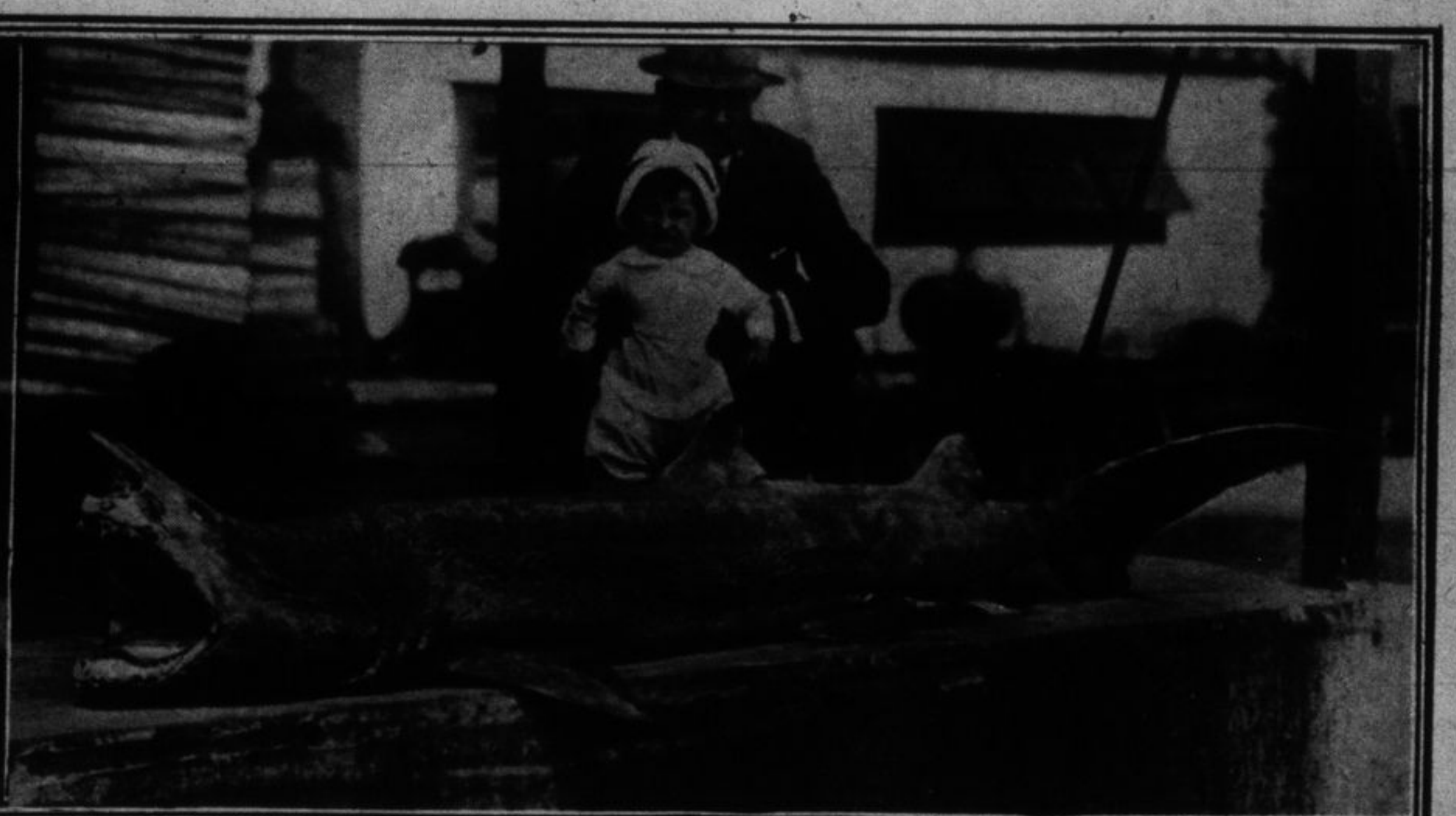
The capture of an eight-foot shark by fishermen off Asbury Park, N.J., on Thursday has again been the cause of thousands of bathers to forsake the surf for the safer environs of the beach. The shark, said to be a man-eater and certainly looking the part, is shown here in comparison with a child.