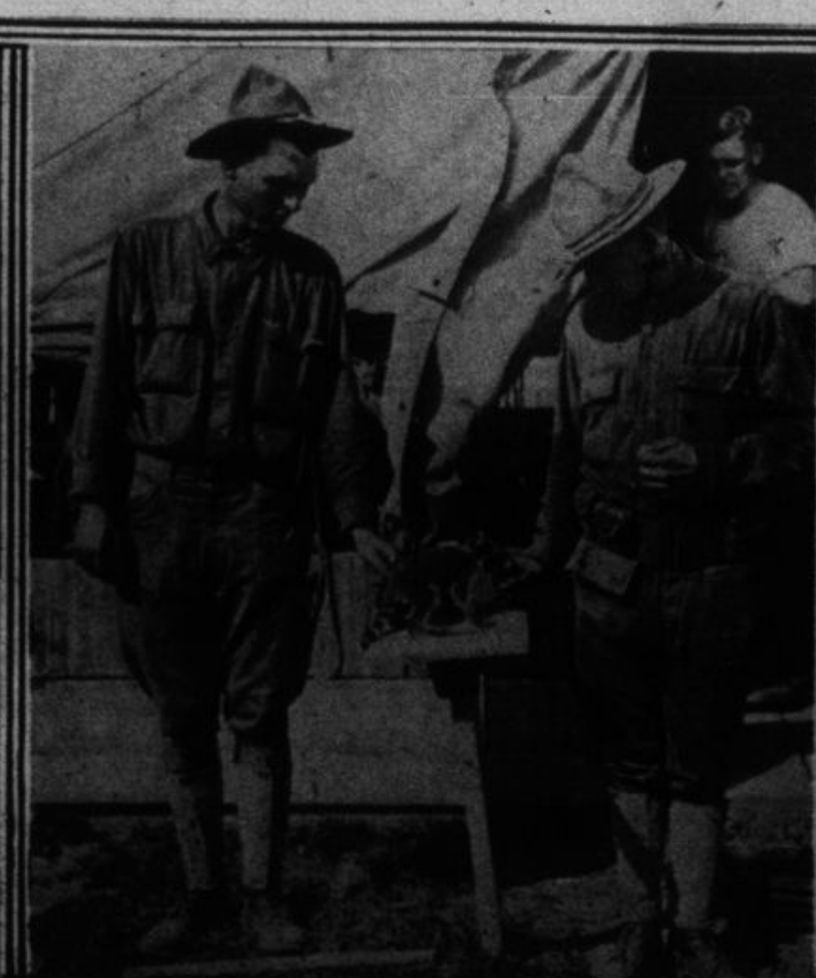
ODD MASCOT OF THE TEXAS 2ND REGULARS; a baby raccoon, which was captured when its mother was killed by the troopers, and it is now the pet of the regiment. The regiment is stationed at Madero City, Texas.