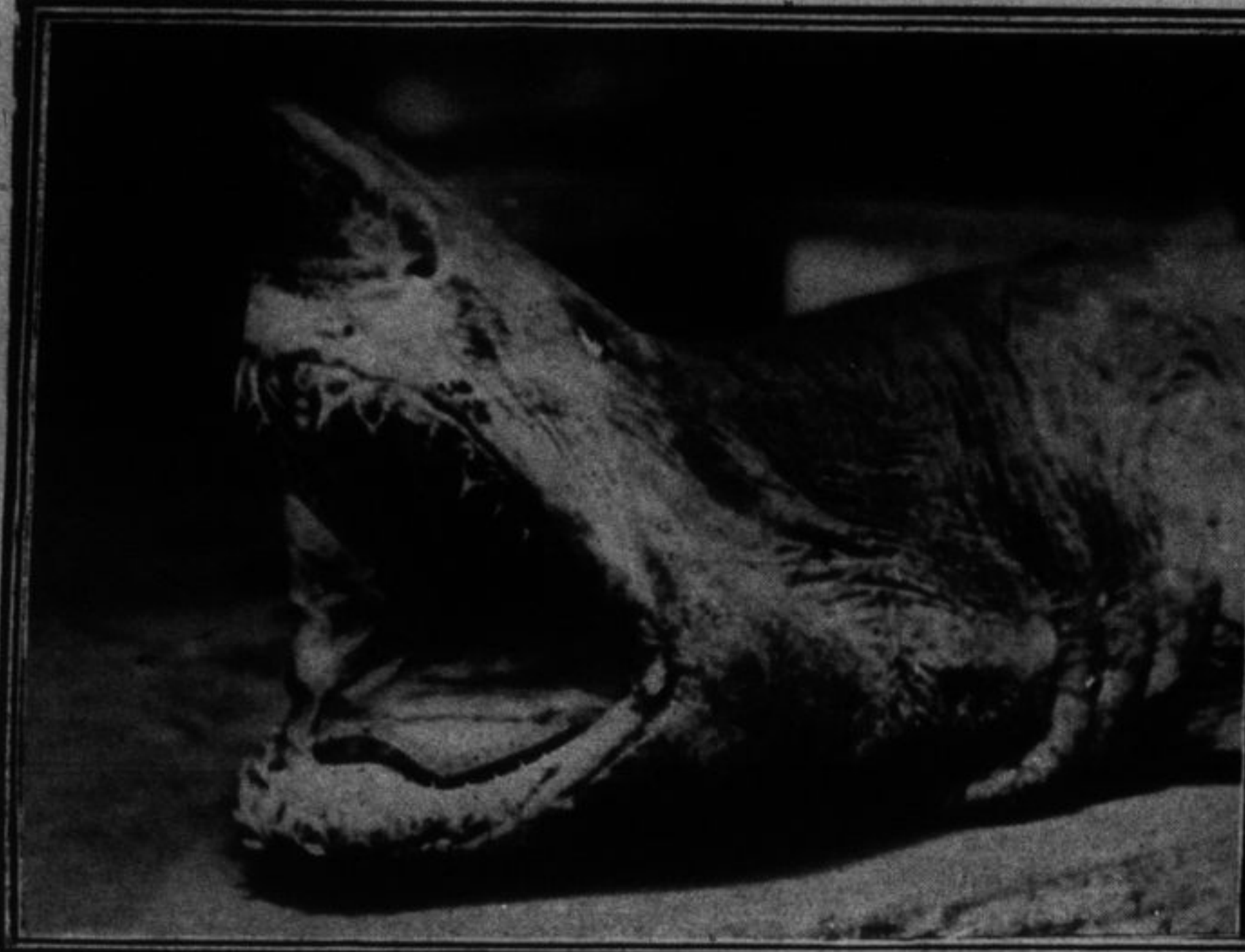
Large mouth and teeth of the white shark, which was captured in the ocean off Asbury Park, N.J. The fish weighed 250 lbs., and measured eight feet.