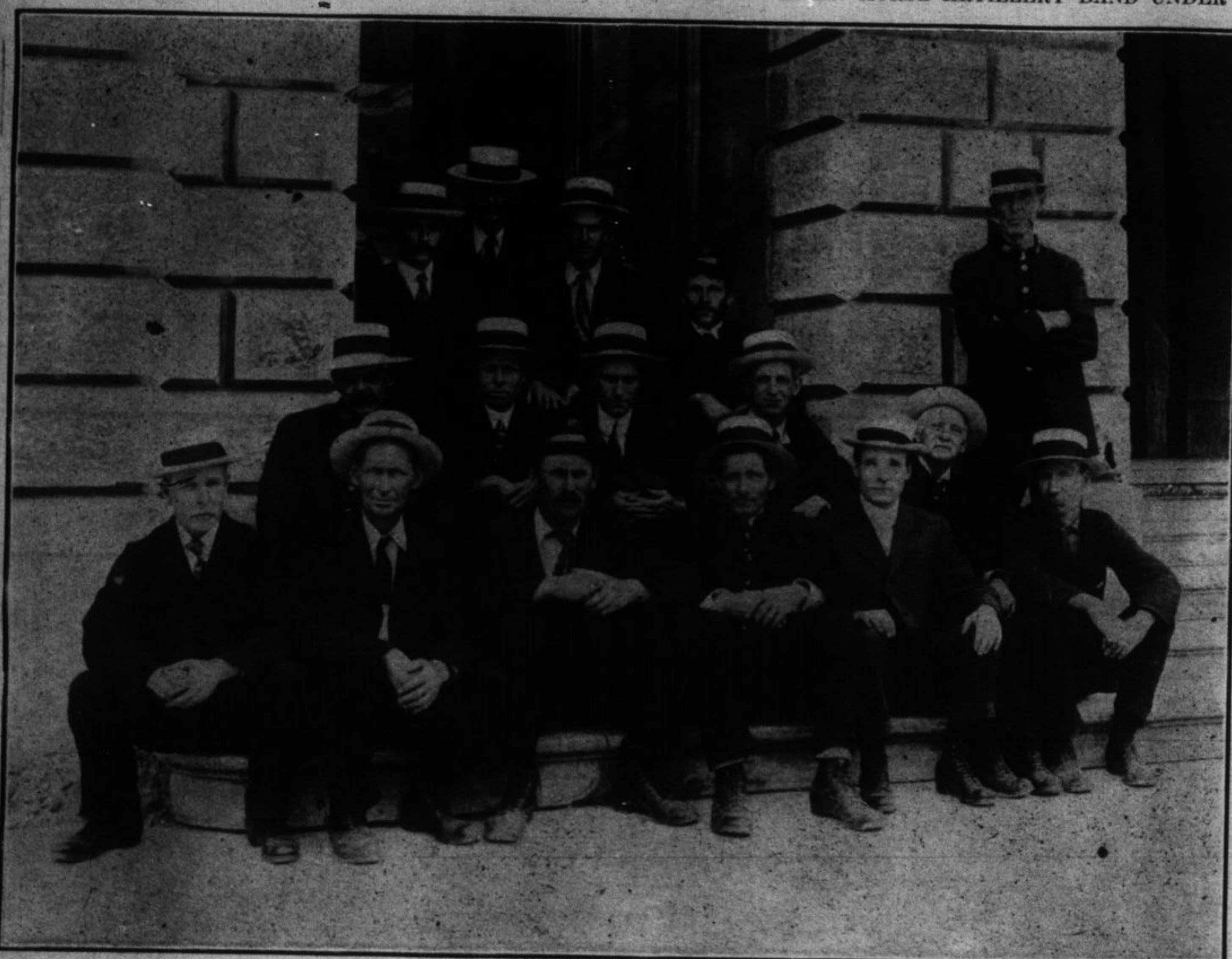
KINGSTON'S "POSTIES"—THE FINEST EVER.