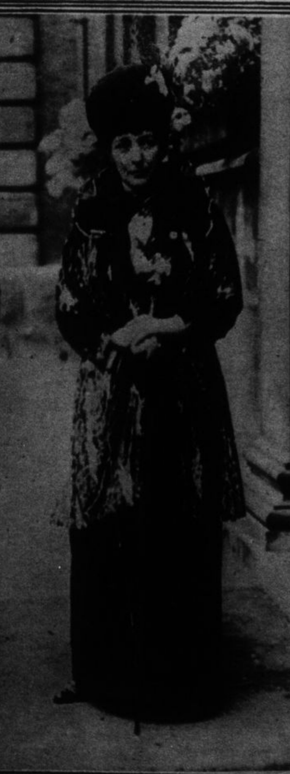
ALEXANDRA DAY was recently observed in England in honor of the Queen Mother Alexandra. Our photo is one that was specially posed in front of the Marlborough House in London.