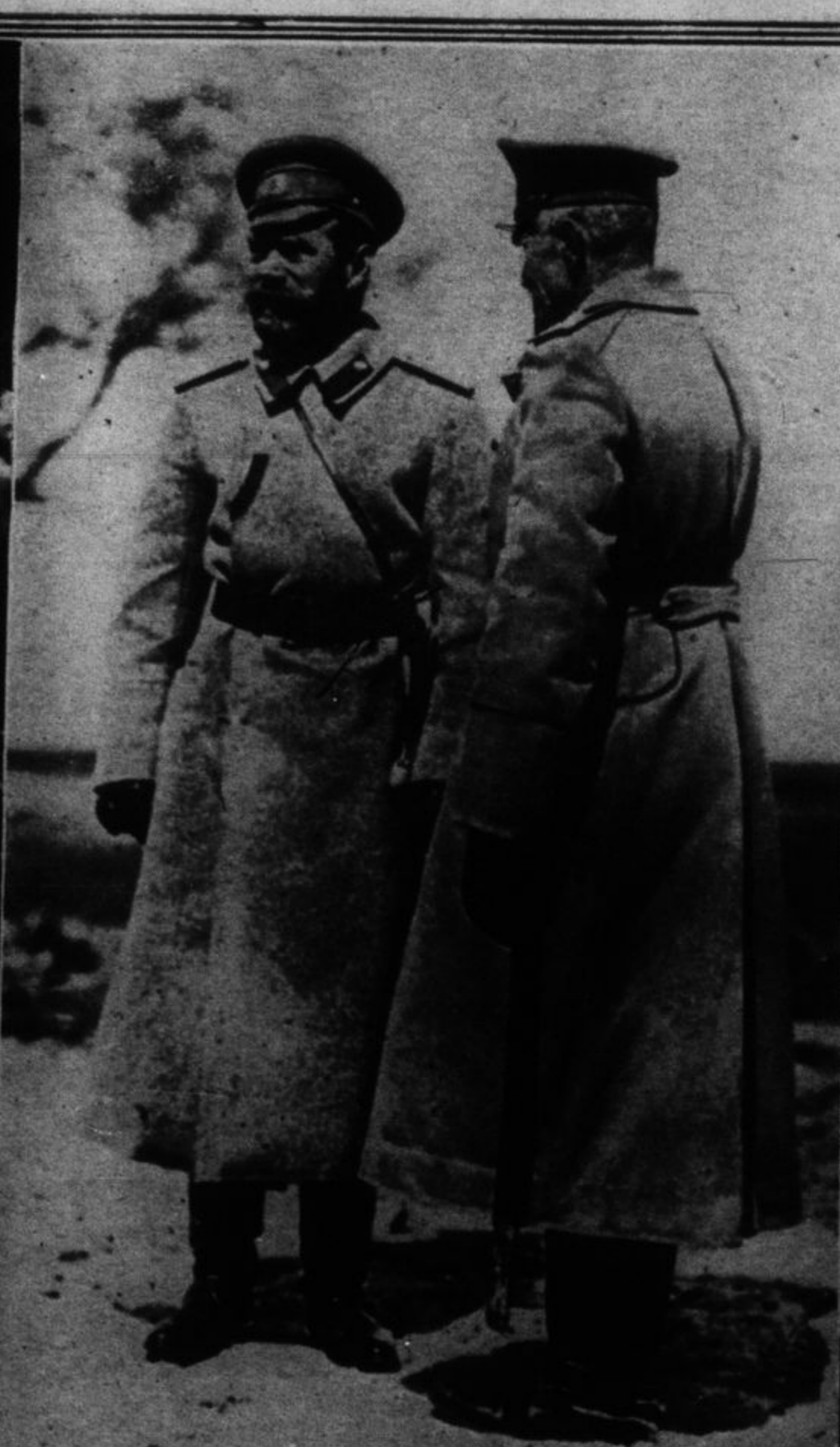
THE CZAR OF RUSSIA pays a visit to his successful commander in the south, General Broussiloff, who is conducting the campaign in Bukowina and the Carpathians.