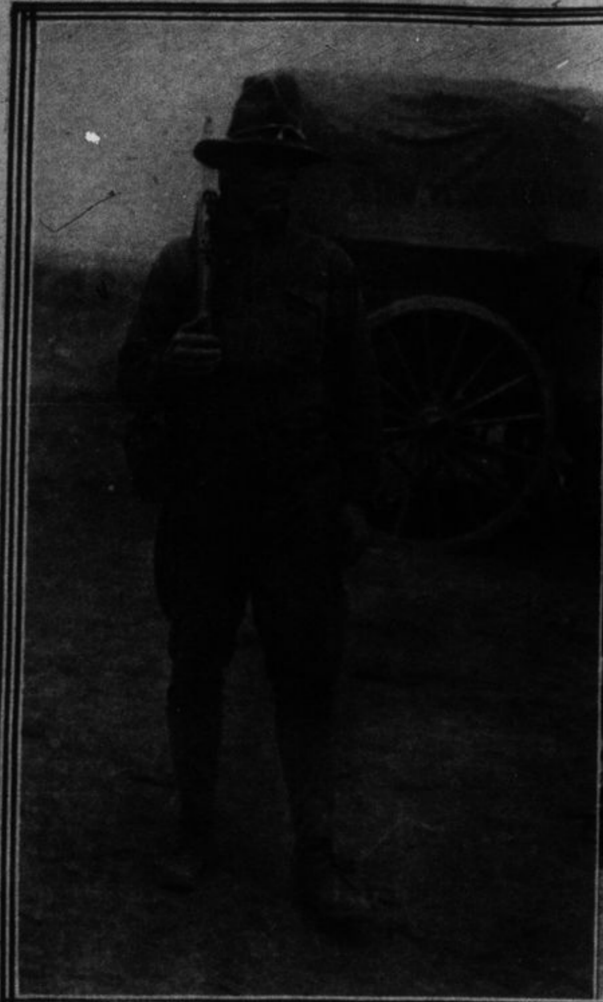
NORMAN SELBY (KID McCOY) FORMER PUGILIST. Doing sentry duty with the 71st Regiment at the border.