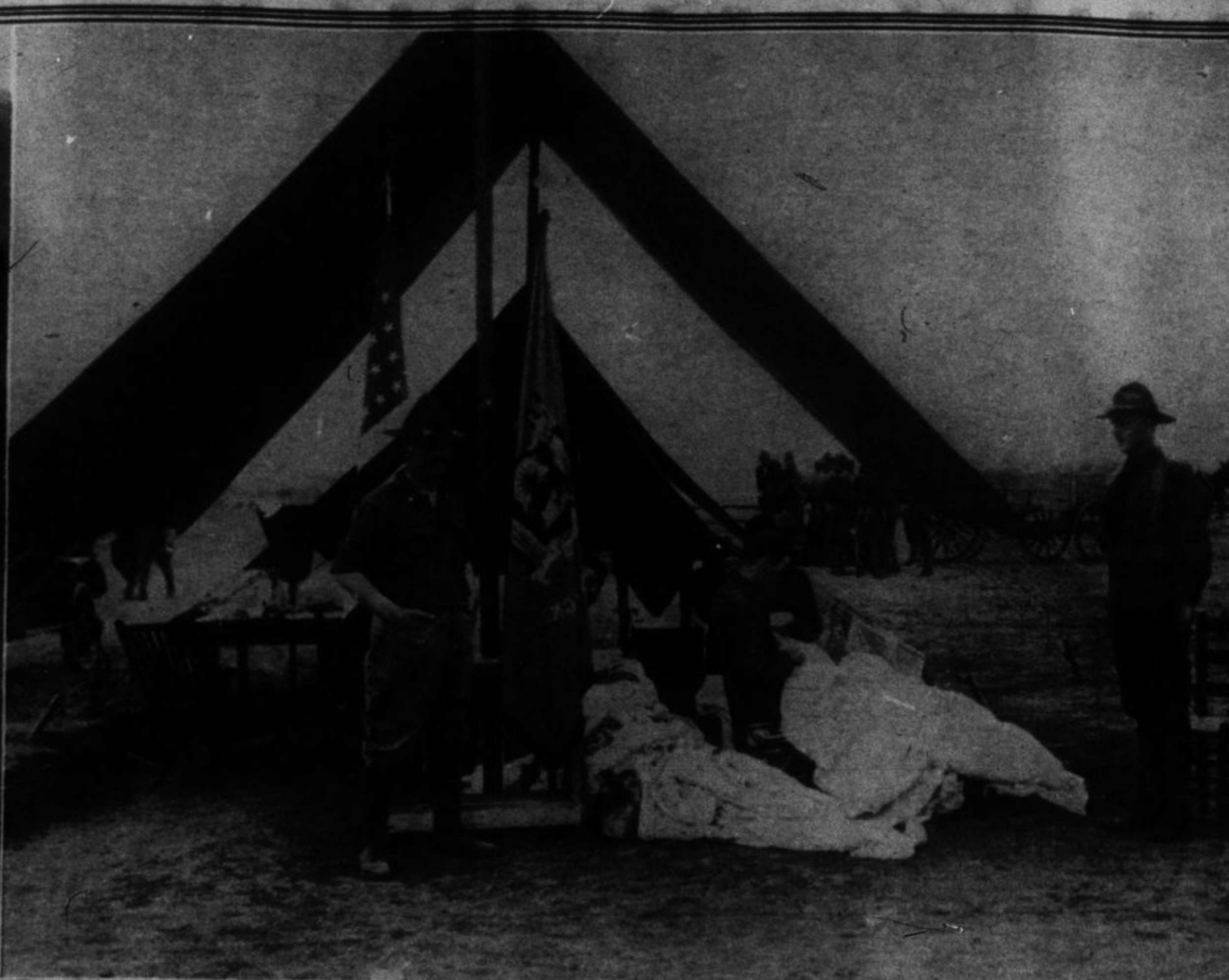
TO PREVENT SUFFERING AMONG THE HORSES. Canvas shelters to protect the cavalry and artillery mounts on the border are being constructed by the men of the various regiments stationed there. Our photo shows Col. Fiske of the 7th showing his men how to sew the canvas for the shelters.