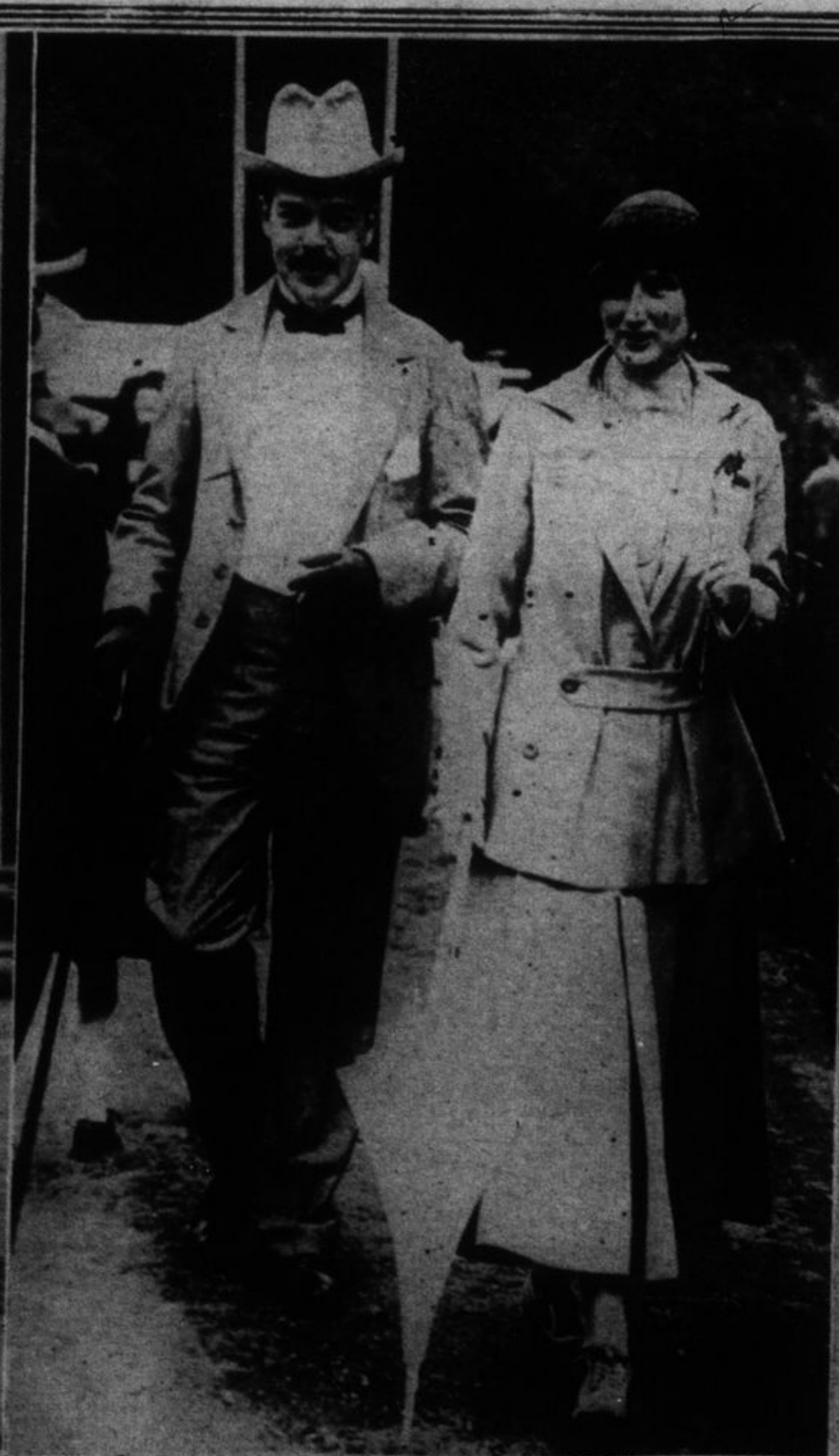
EX-KING MANUEL OF PORTUGAL AND HIS WIFE. Ever since the marriage of ex-King Manuel and Princess Augusta several years ago rumors have been rife that the couple had parted or were soon to part. This picture, taken but a few weeks ago, shows the two attending the Chelsea Flower Show in London.