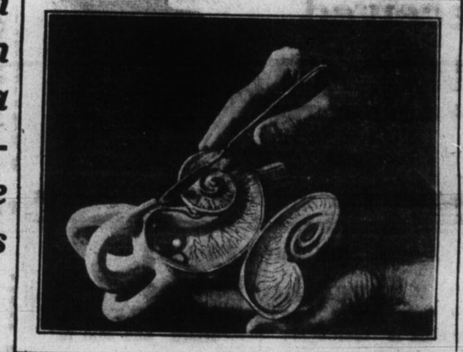
The Delicate Mechanism of the Human Ear Exposed to View Under the Anatomist's Knife.