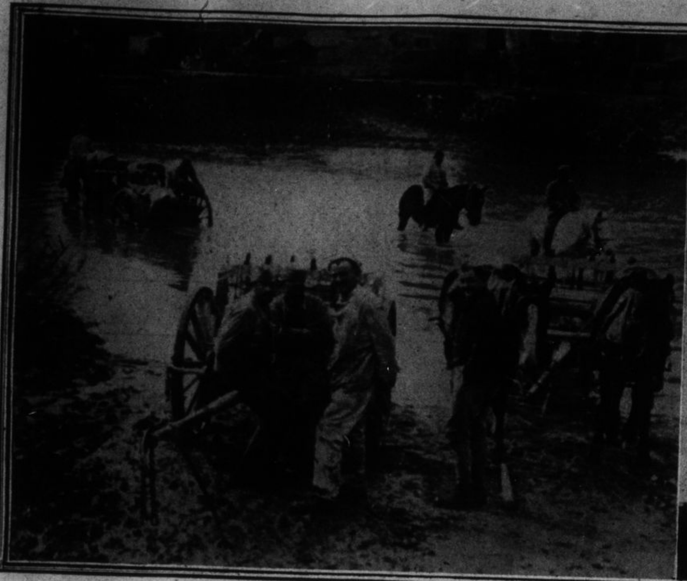
FRENCH TROOPS GIVING THEIR 75'S A MUCH NEEDED WASHING IN THE RIVER MEUSE.