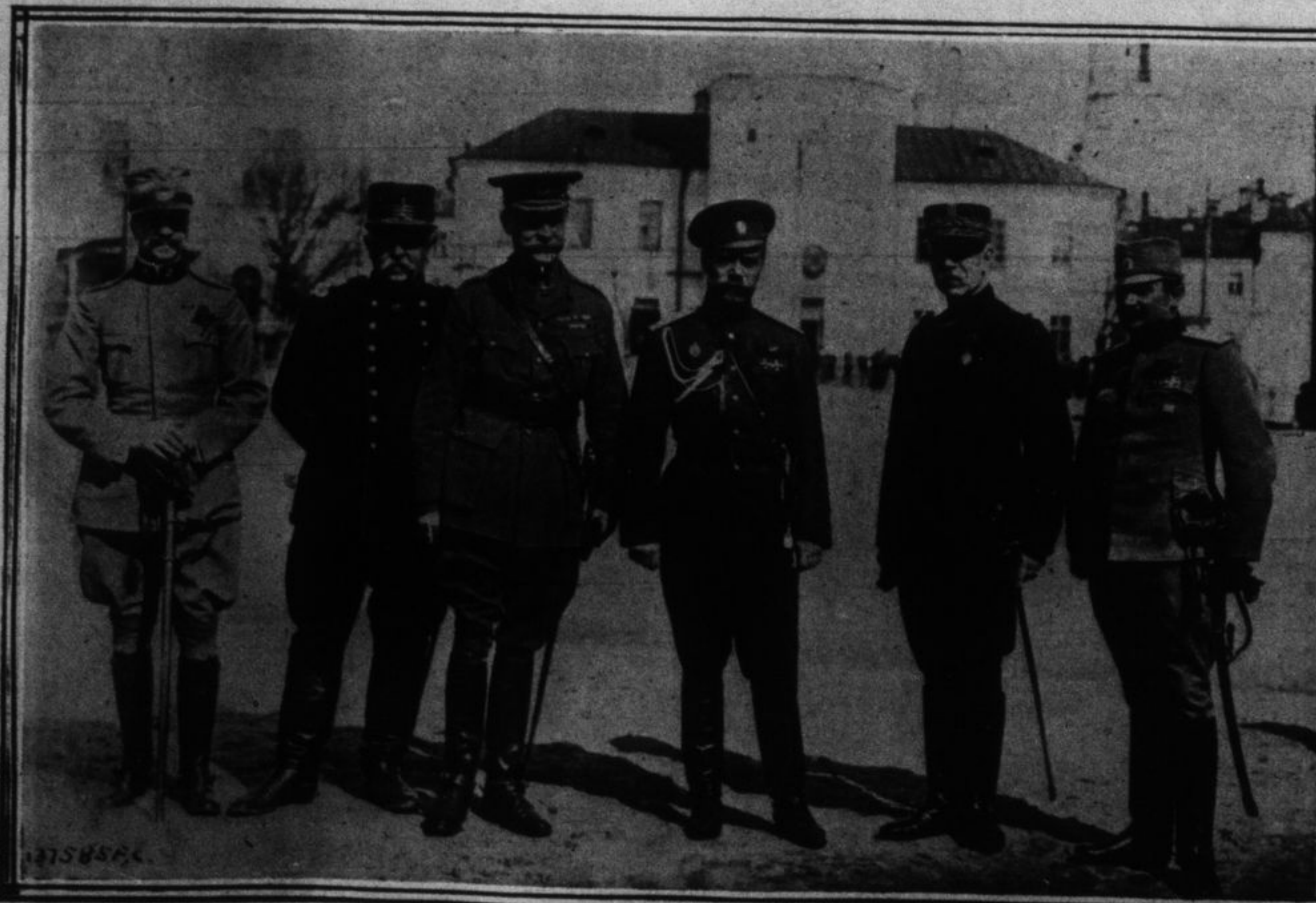
CZAR OF RUSSIA RECEIVES REPRESENTATIVES OF ALLIED POWERS. Czar of Russia (4th from left) received a delegation of representatives from the allied powers. The photo shows the Czar in regulation army dress.