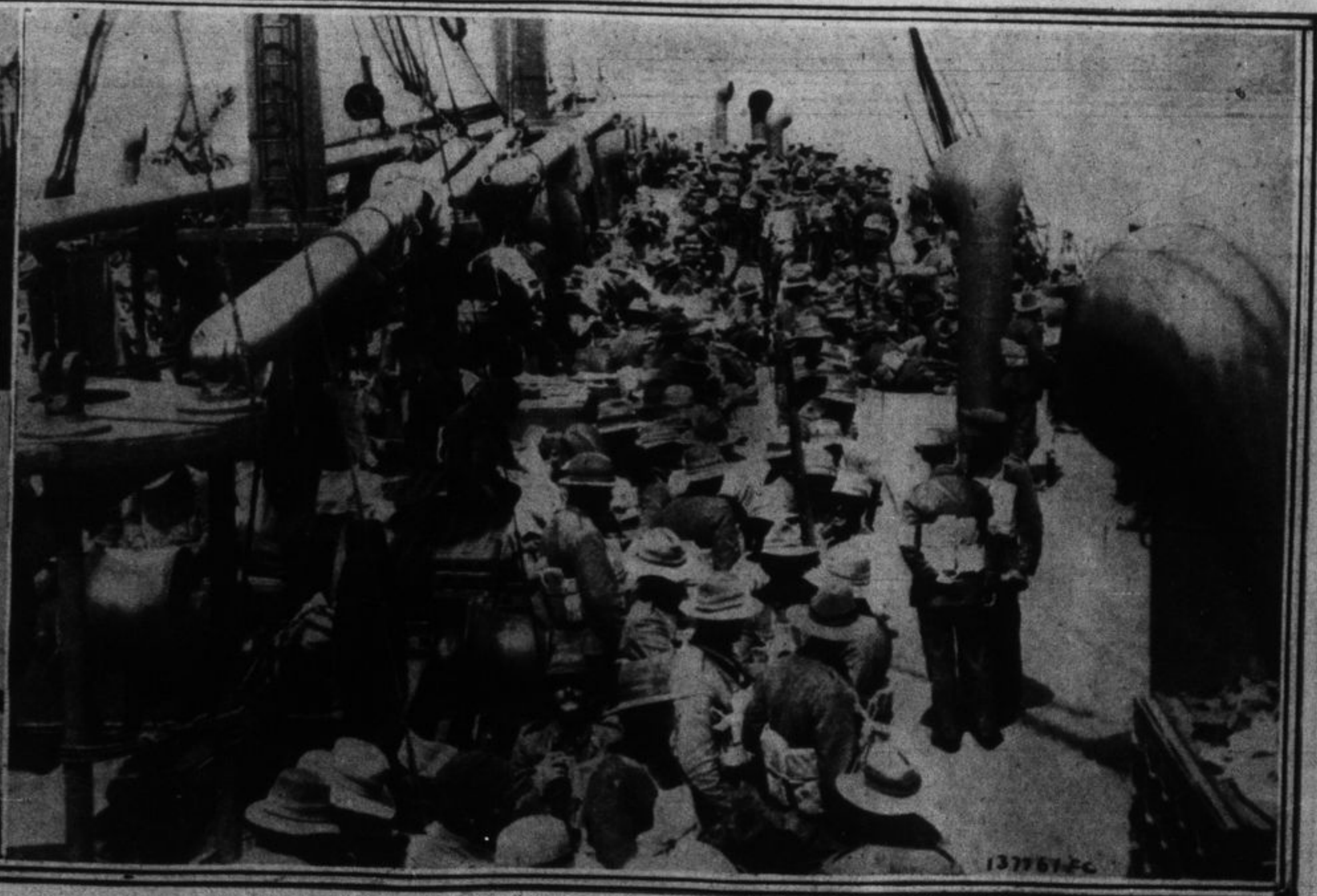
ANZACS LEAVE EGYPT TO FIGHT FOR FRANCE. The Anzacs leaving Egypt for France, where they will fight in the trenches. Most of the men are seasoned warriors, have fought in the Boer War, and in putting down minor rebellions in Africa. Each man is wearing his cork life belt in preparedness for being torpedoed.