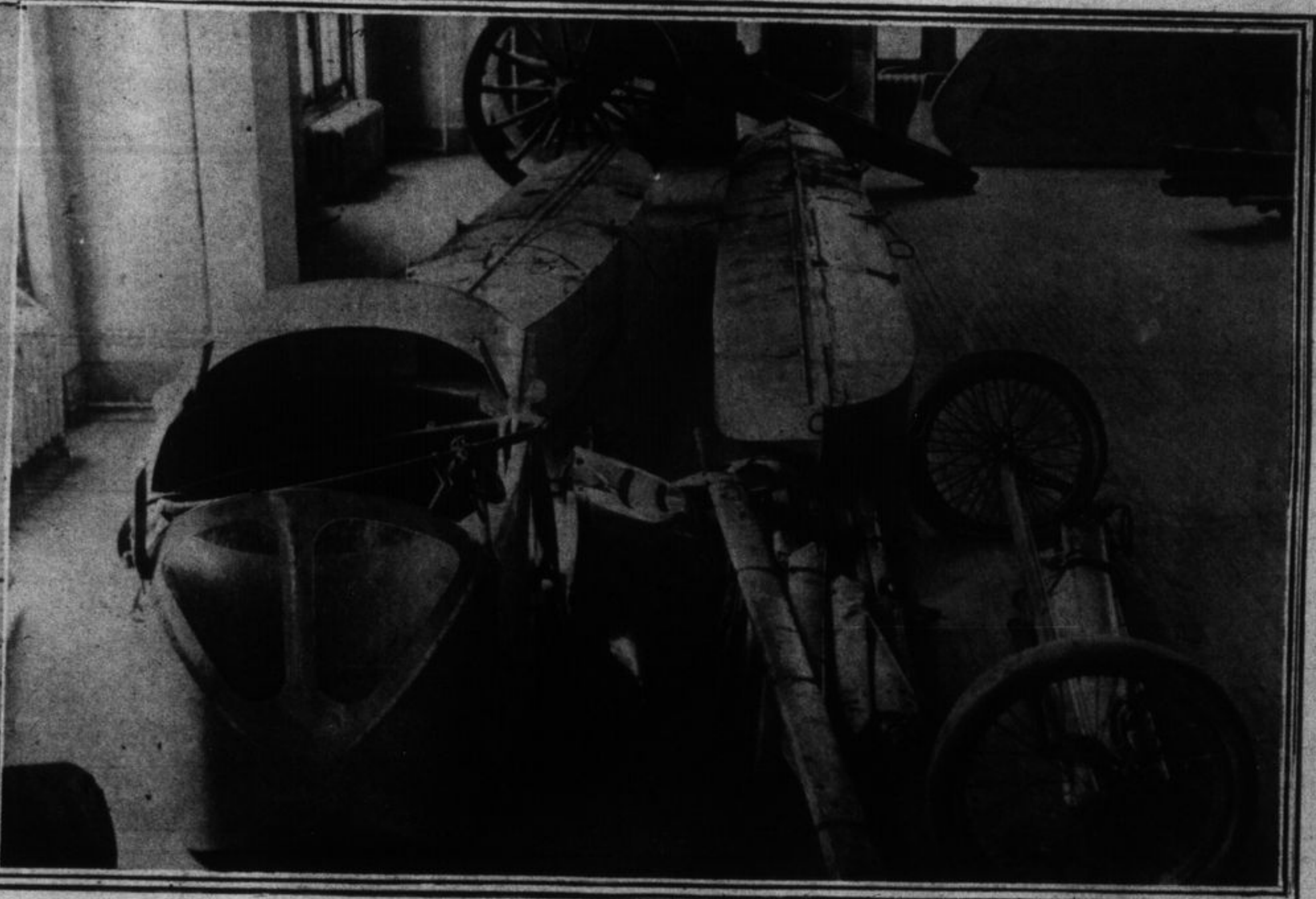
WRECK OF A GERMAN HYDRO AEROPLANE. Machine was brought down "somewhere in France" after a long chase, and when the aviator was driven into the line of fire of the French anti-aeroplane guns.