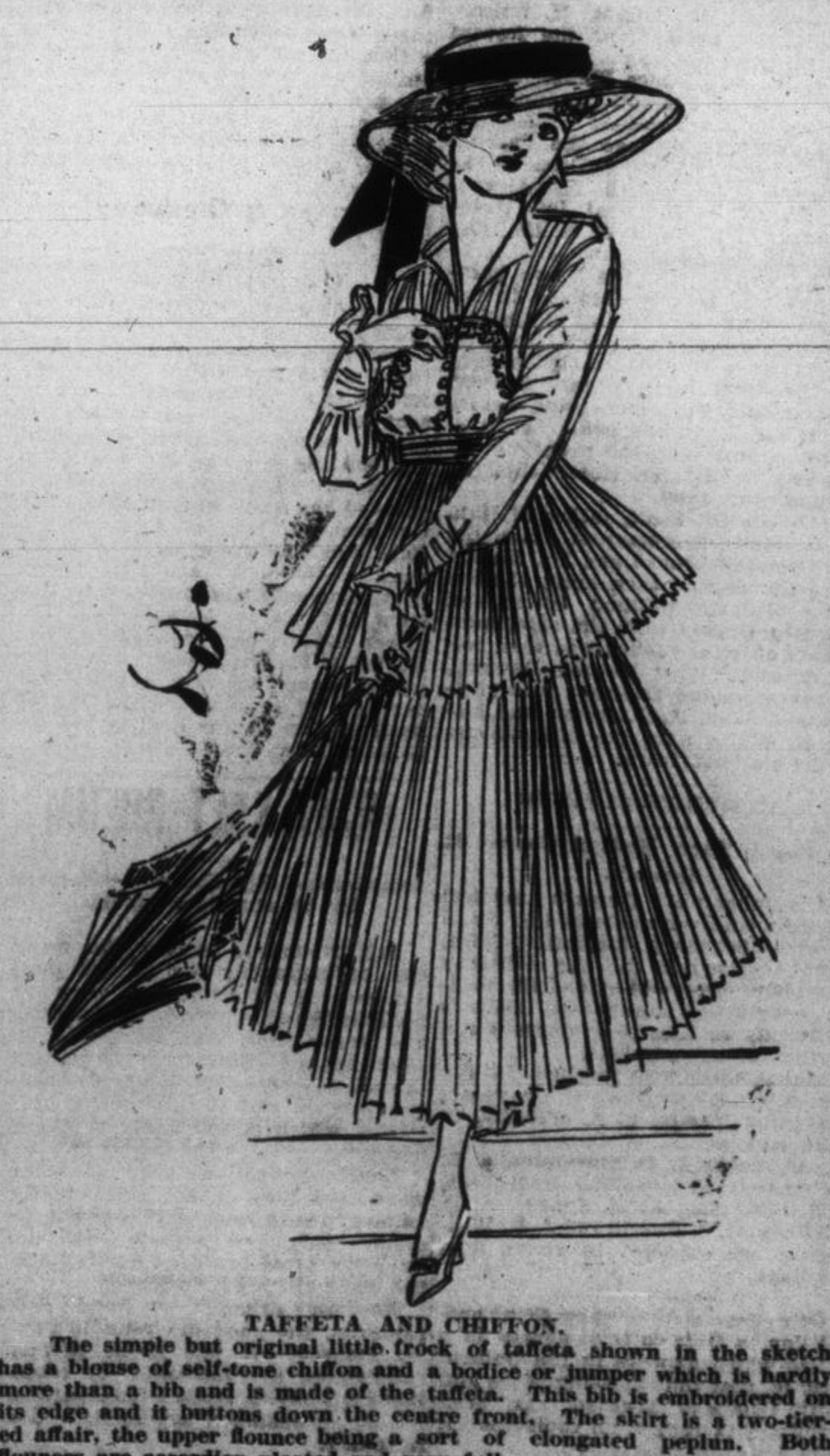
TAFFETA AND CHIFFON. The simple but original little frock of taffeta shown in the sketch has a blouse of self-tone chiffon and a bodice or jumper which is hardly more than a bib and is made of the taffeta. This bib is embroidered on its edge and it buttons down the centre front. The skirt is a two-tiered affair, the upper flounce being a sort of elongated peplum. Both flounces are accordion pleated and very full.