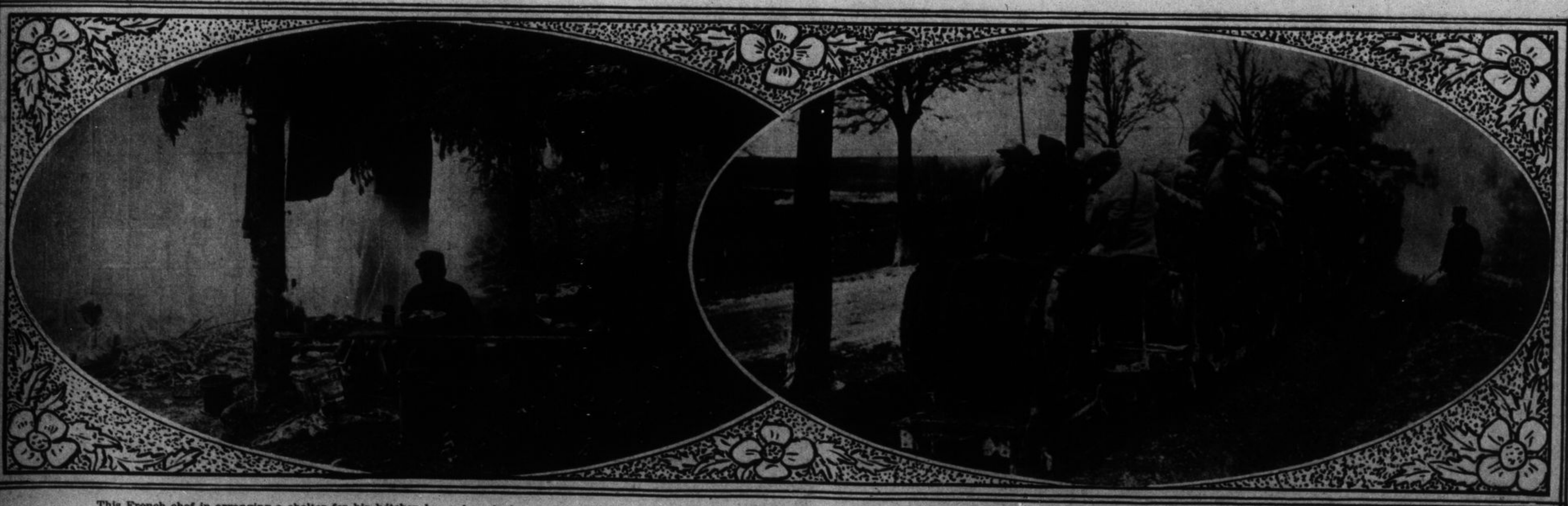
This French chef in arranging a shelter for his kitchen has unknowingly constructed a picturesque setting.