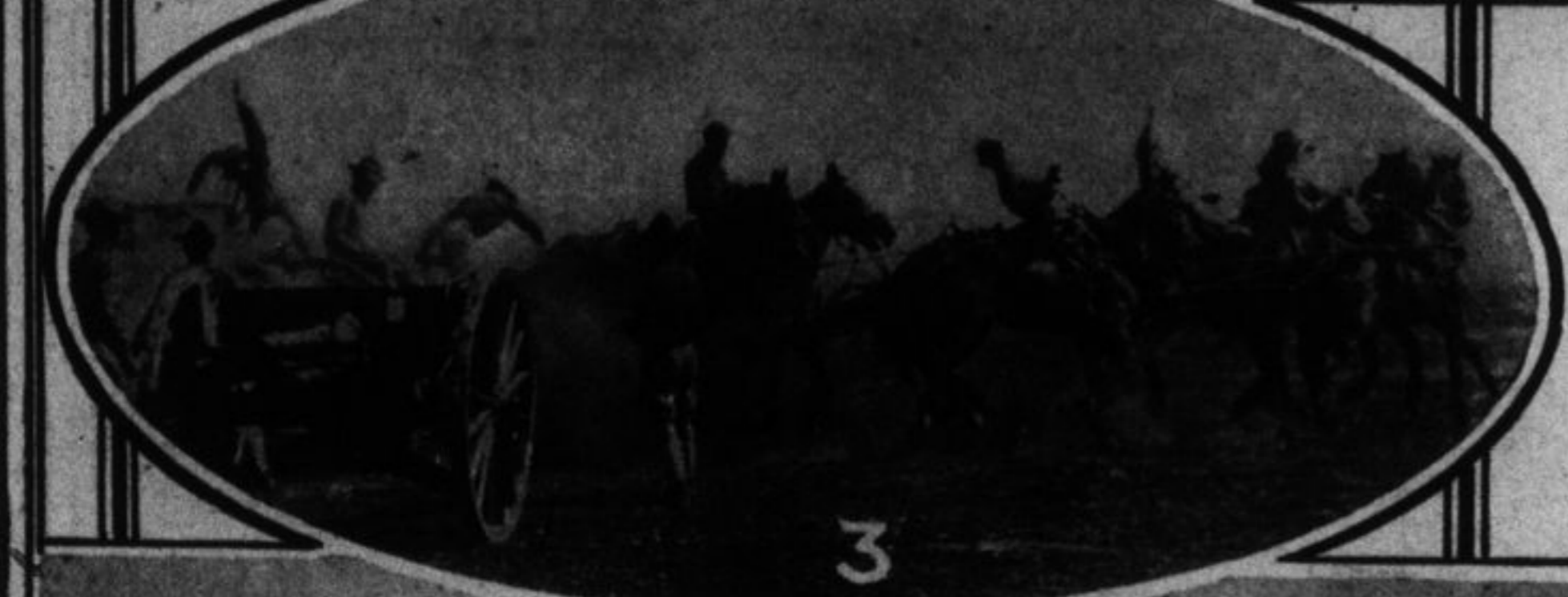
3.—Army manoeuvres by the troops on the Texas border. Unlimbering field artillery.