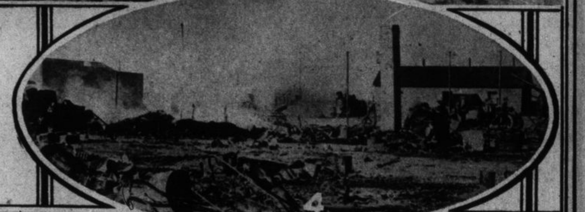
4.—View of Columbus, N.M., after the raid by Villa's bandits. The close-up ruins are of the Commercial Hotel in which six Americans were killed and their bodies cremated.