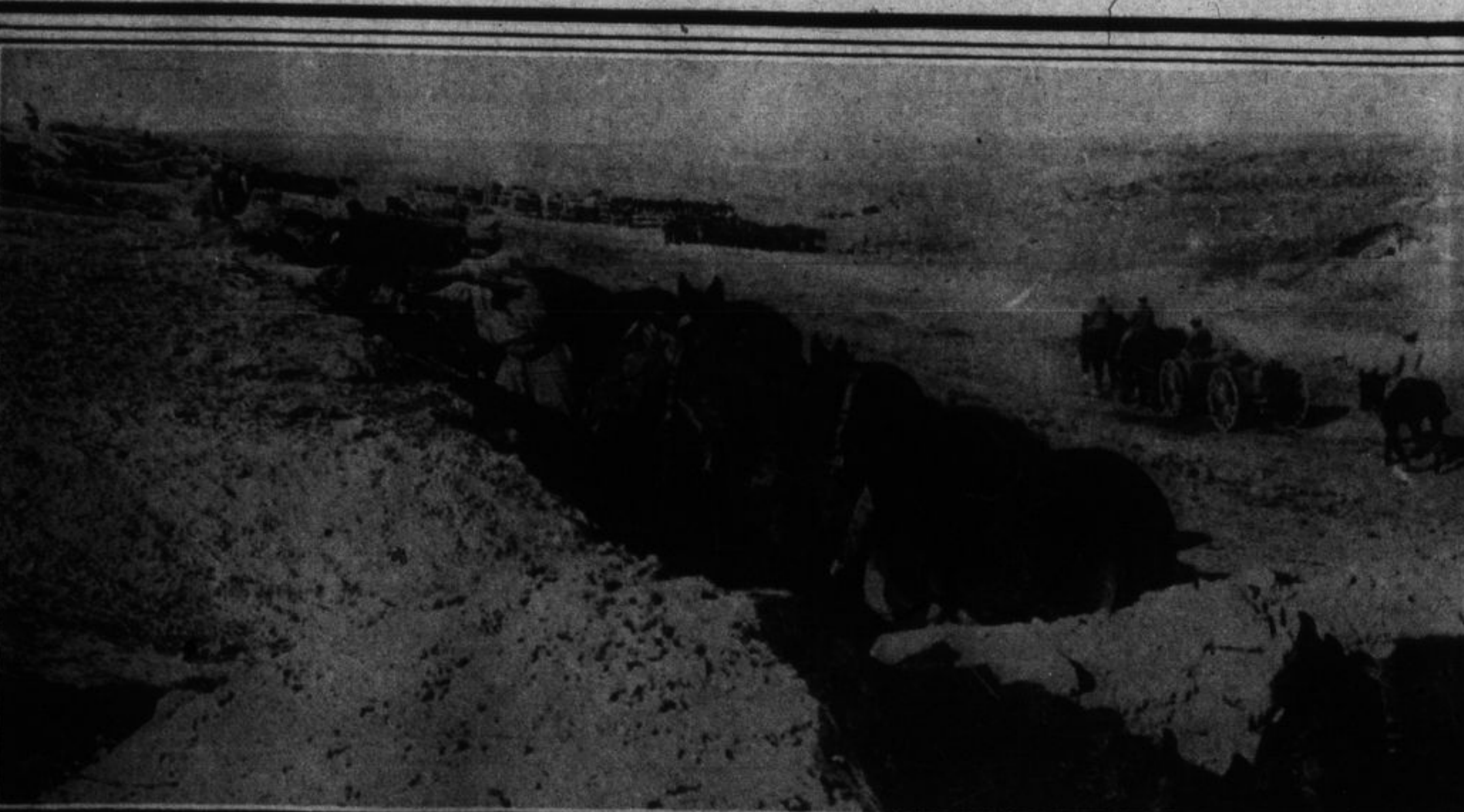
A TRENCH FOR HORSES, ON THE MACEDONIAN FRONT.

To keep horses from wandering away to look for a grazing place, where there is none, the French artillerymen have devised an ingenious method of "digging the horses in." Trenches are cut into the earth and the horses driven into what is not unlike a stall. This stall, besides keeping the animals from wandering away, is a great protection for them from the biting winds.