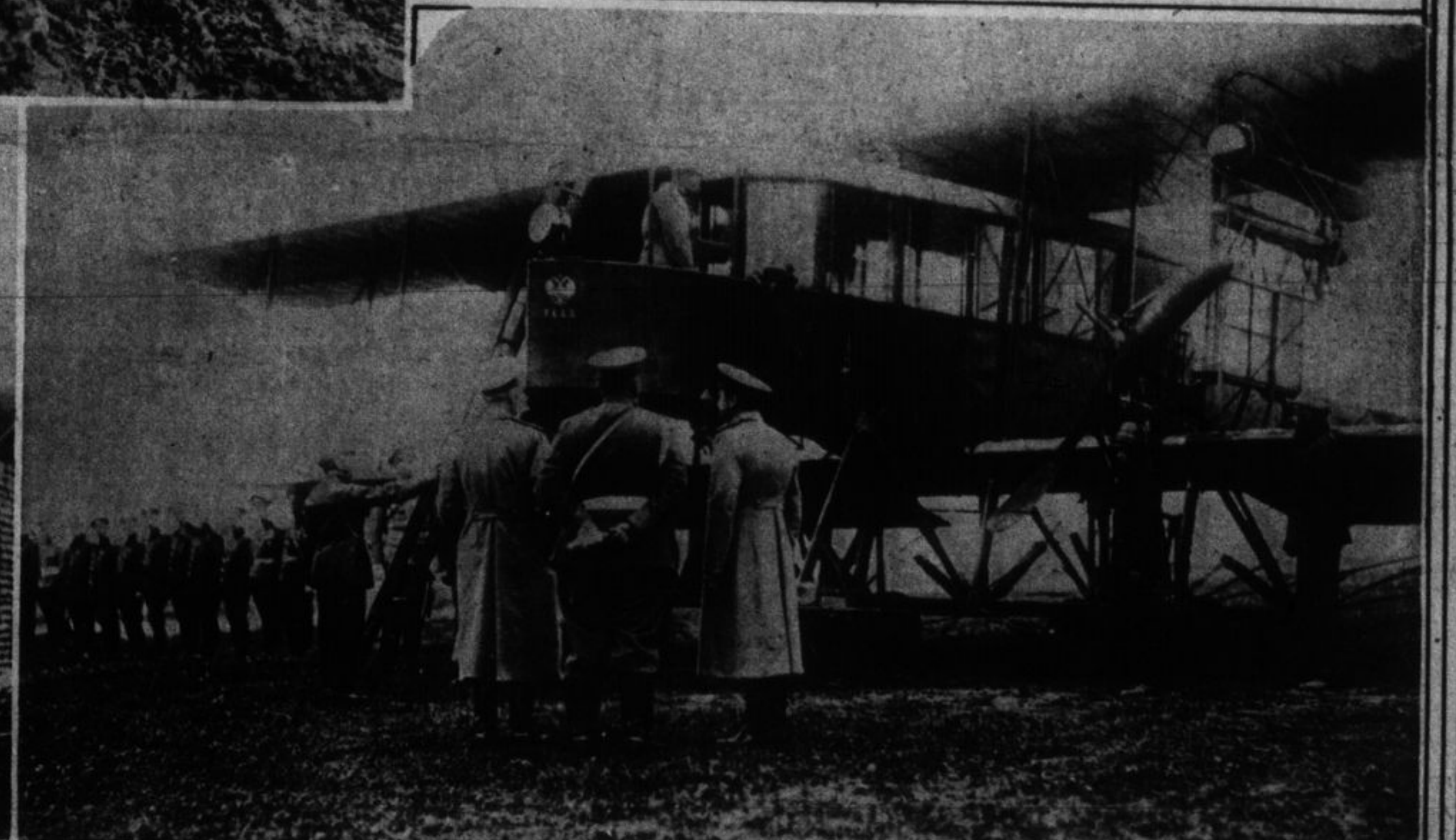
FIRST PHOTO OF THE RUSSIAN CZAR, ON THE GALICIAN FRONT. Showing the Czar, in the car of the plane, inspecting one of the new giant Russian biplanes, which has made a successful flight on which it carried thirty-two passengers. The biplane is of the Sikorsky type.