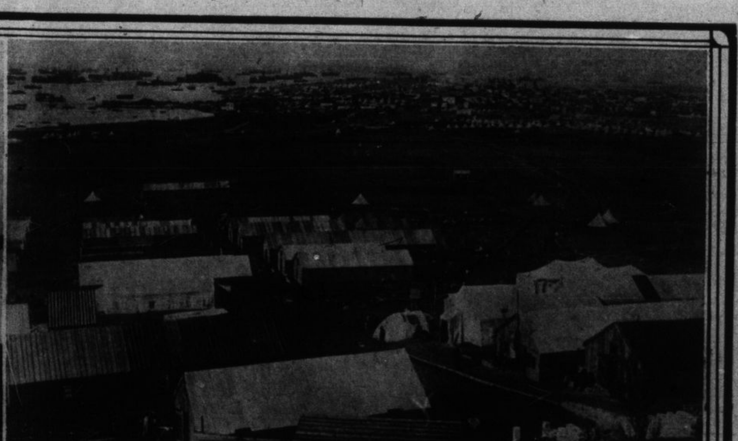
Most of the troops used in the Dardanelles operations have been transferred to Mudros Island in the Mediterranean, to remain there until the contemplated spring offensive of the Allies at Salonika. View of camp at Mudros.

To keep horses from wandering away to look for a grazing place, where there is none, the French artillerymen have devised an ingenious method of "digging the horses in." Trenches are cut into the earth and the horses driven into what is not unlike a stall. This stall, besides keeping the animals from wandering away, is a great protection for them from the biting winds.