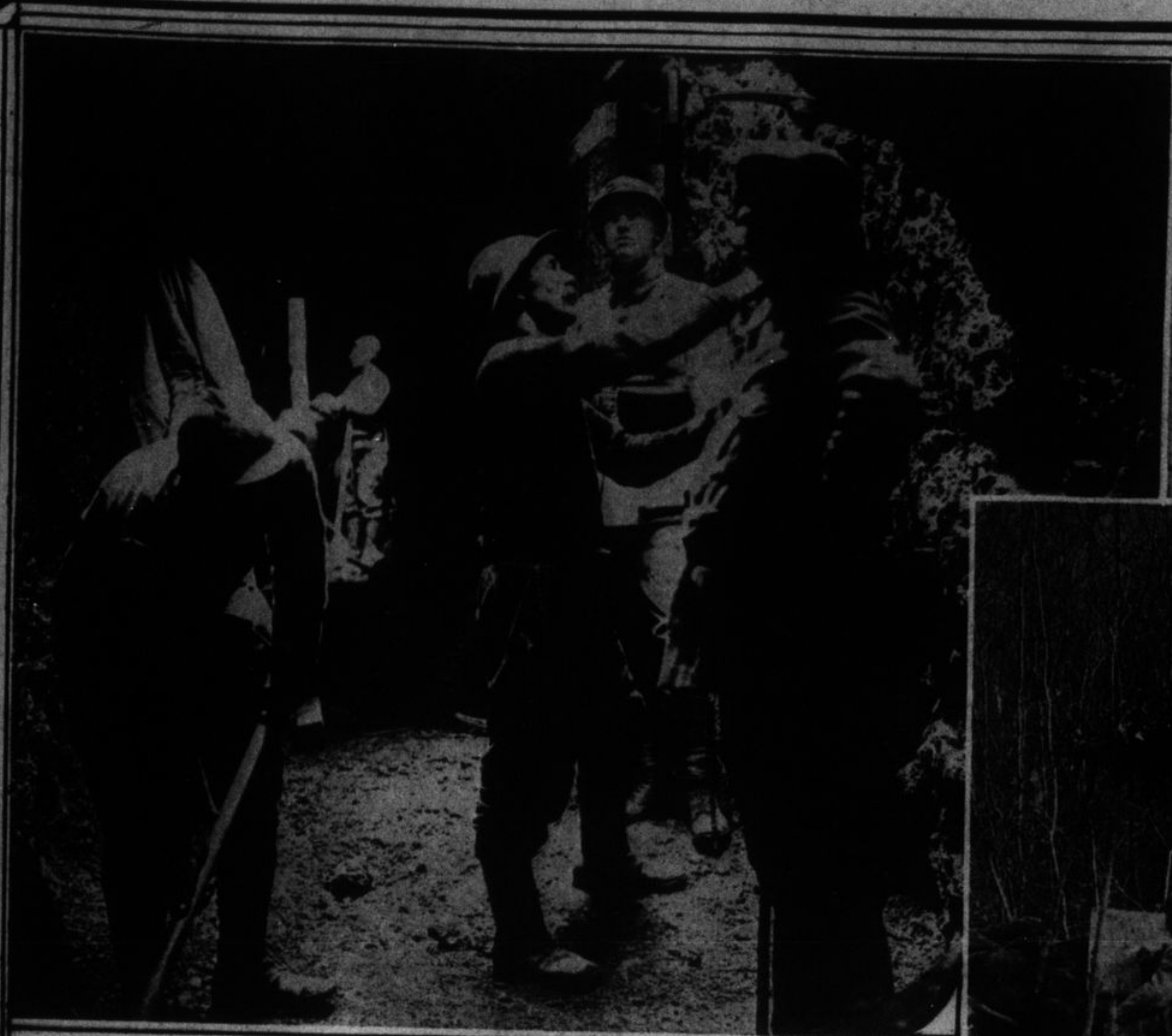
SAPPERS AT WORK, UNDER GERMAN LINES, AT VERDUN. A party of French sappers who are at work placing time fuses on the mines which have been under German lines at Verdun.