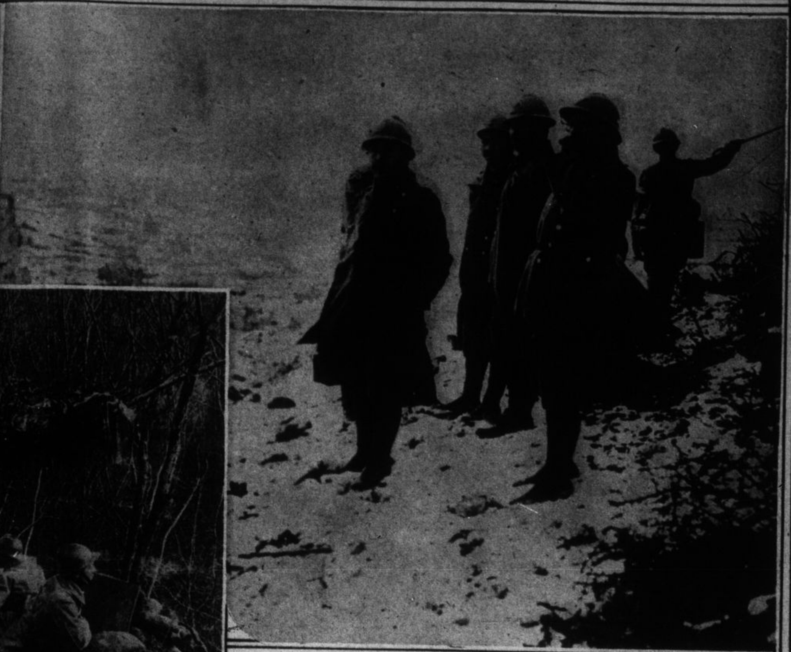
SPECIAL PHOTOS OF THE FIGHTING IN THE REGION OF VERDUN. Japanese officers in French uniforms, observing the operations of the French army now fighting in Verdun.