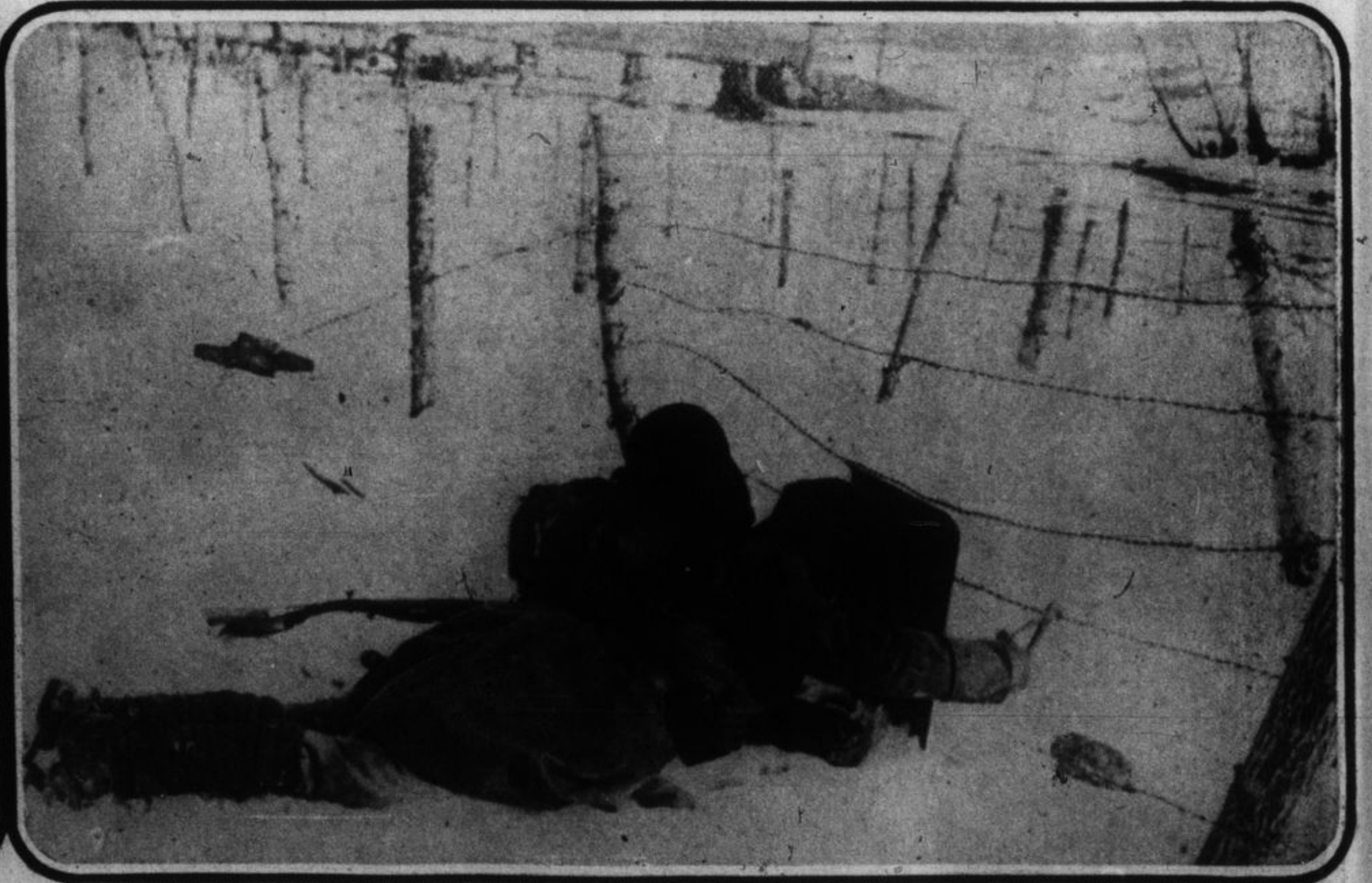
CUTTING BARB-WIRE ENTANGLEMENTS—A DANGEROUS BUSINESS! Showing the method employed by an infantryman of the Austrian-Hungarian troops operating along the Galician front. With a shield of metal but large enough to cover him, he wriggles forward to the trench of the enemy and proceeds to work with the pliers.