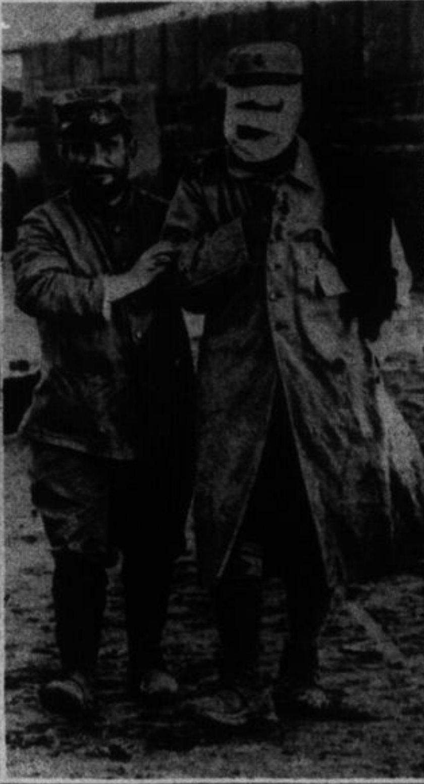
French wounded cavalryman being brought down to the pier to embark on a hospital ship. This man was on shore but a few minutes when the fragments of a bursting shell struck him in the face.