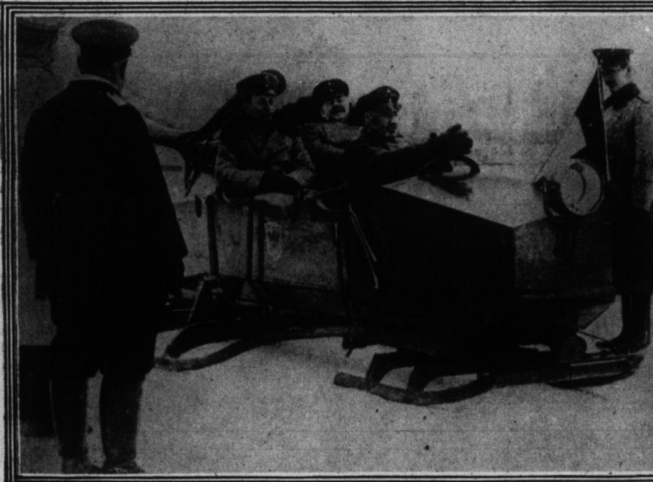
KAISER'S YOUNGEST SON IN PRUSSIAN MILITARY MOTOR SLEIGH. Prince Joachim (on left) in an aerial-propelled motor-sled in Poland.