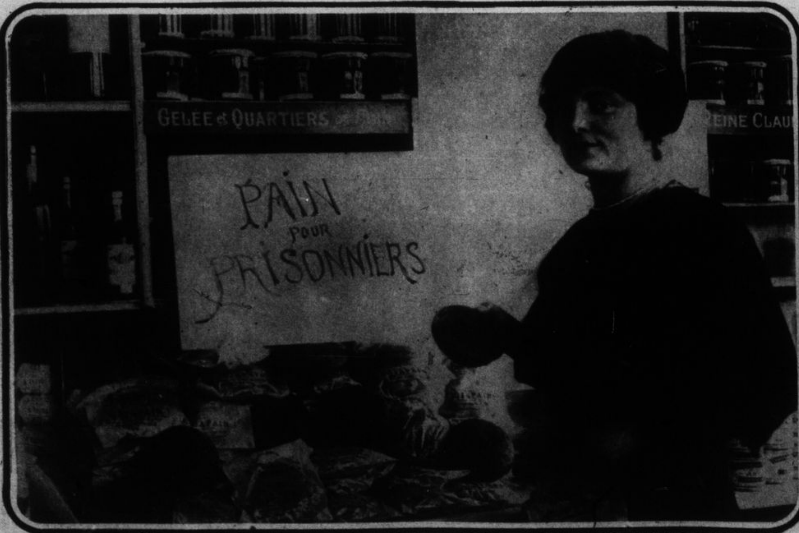
FRANCE SUPPLIES HER PRISONERS IN GERMANY WITH EDIBLE BREAD! Due to the number of letters received by the friends of the French soldiers in the German prison camps, complaining of the food given them, the bakers of France have devised a method of making bread which will keep fresh for at least three weeks.