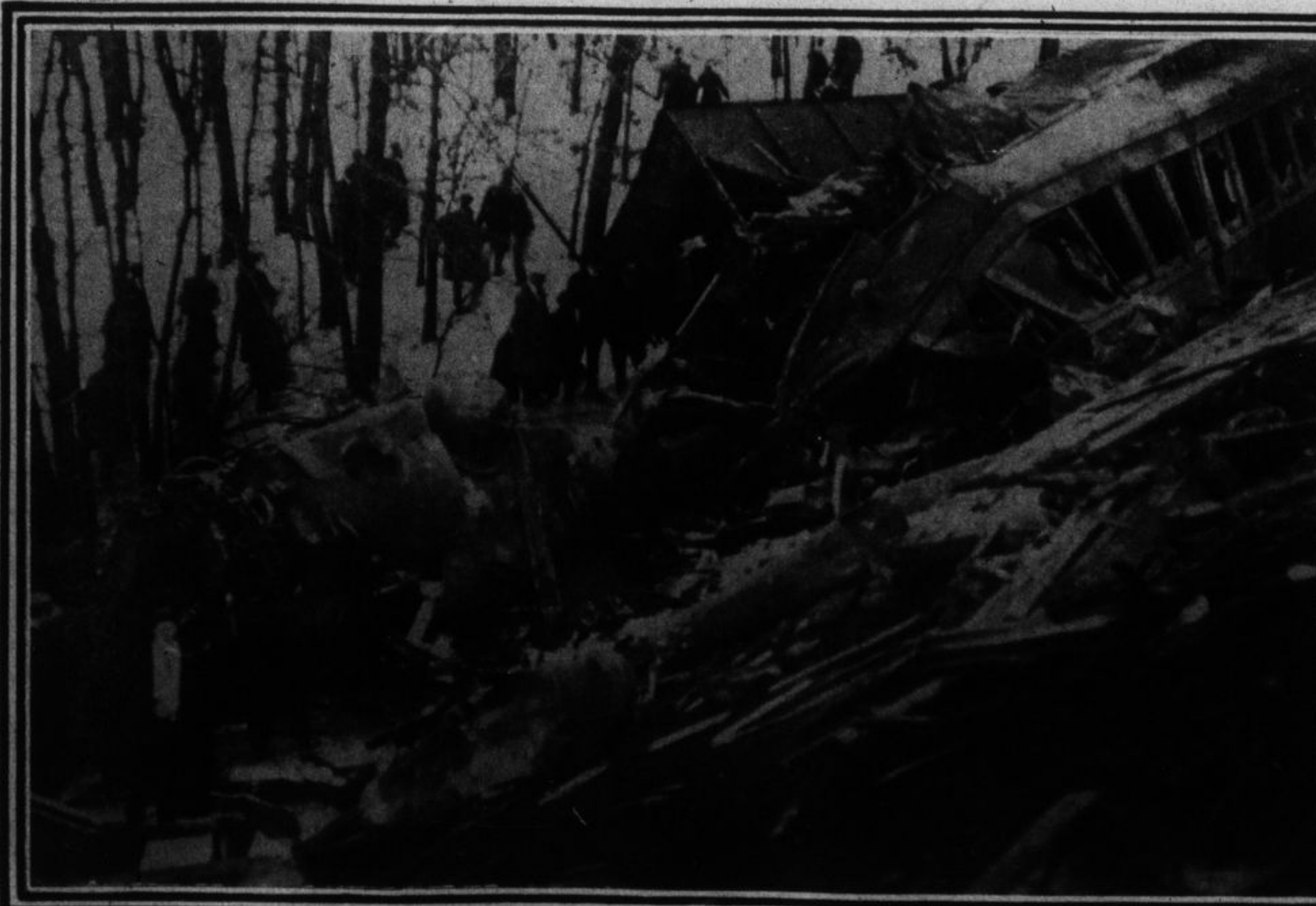
The New Haven wreck at Milford, Conn., in which nine were killed and fifty injured. Photo shows locomotive of the special, the gondolas, freight and passenger coach after rolling down the embankment.