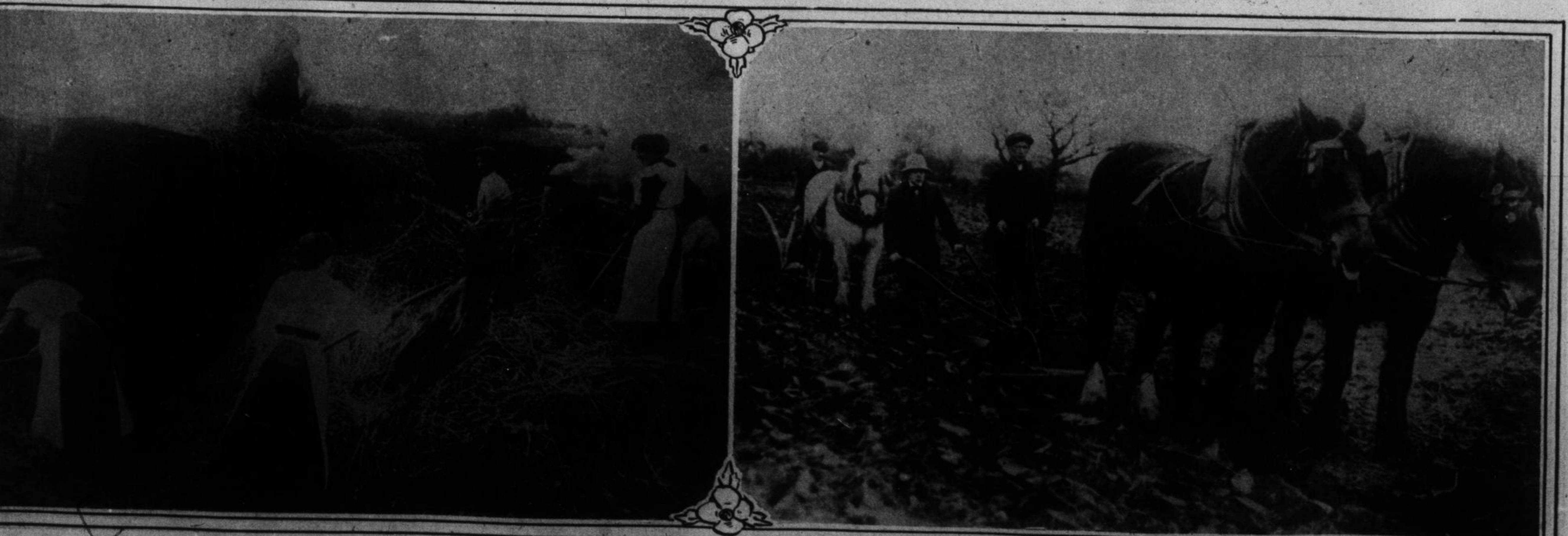
The British Government is about to organise a recruiting campaign among women for agricultural work. Every village will be canvassed by women committees. Our photo shows women feeding a threshing machine on an English farm.