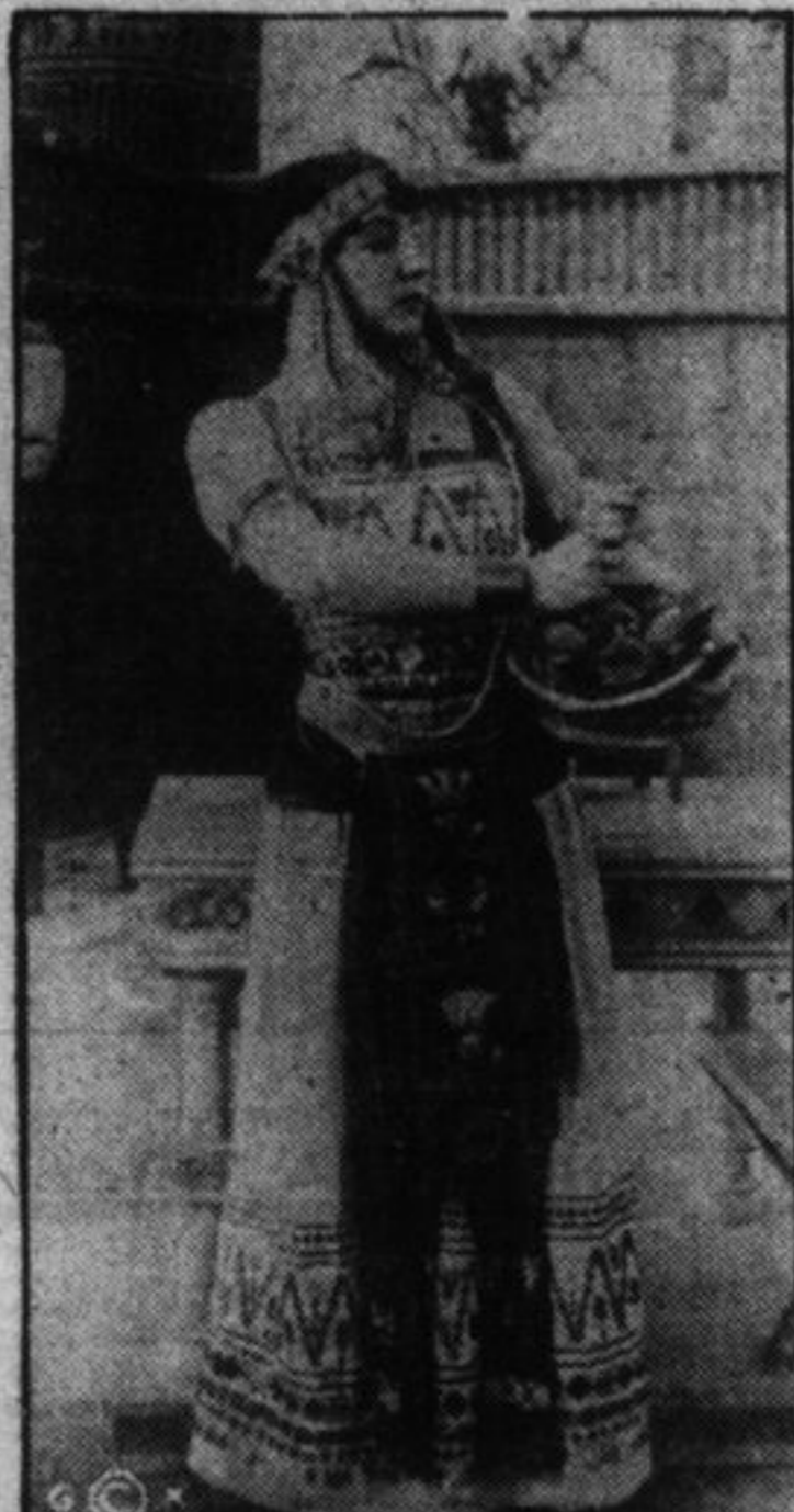
CLEOPATRA. At Griffiths' Theatre, Wednesday and Thursday. The wonderful photo drama "Antony and Cleopatra."

At Griffiths' Theatre, Wednesday and Thursday. The wonderful photo drama "Antony and Cleopatra."