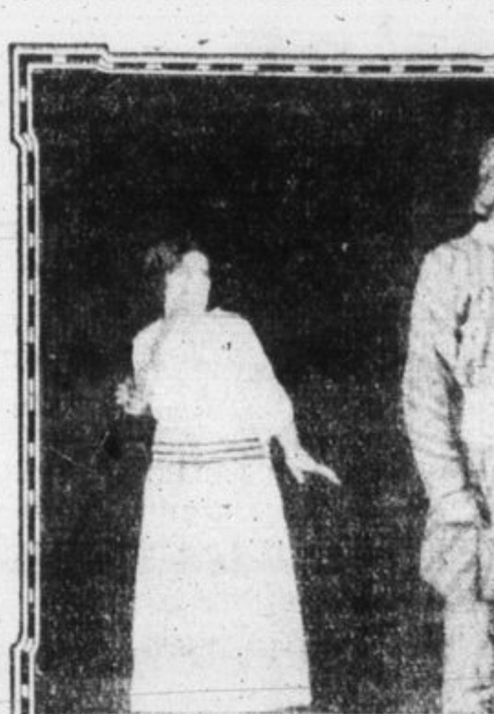
Scene from "One Million Dollars," the five act Metro Star Film, in which William Faversham appears at the Strand 8-night, Tuesday and Wednesday.