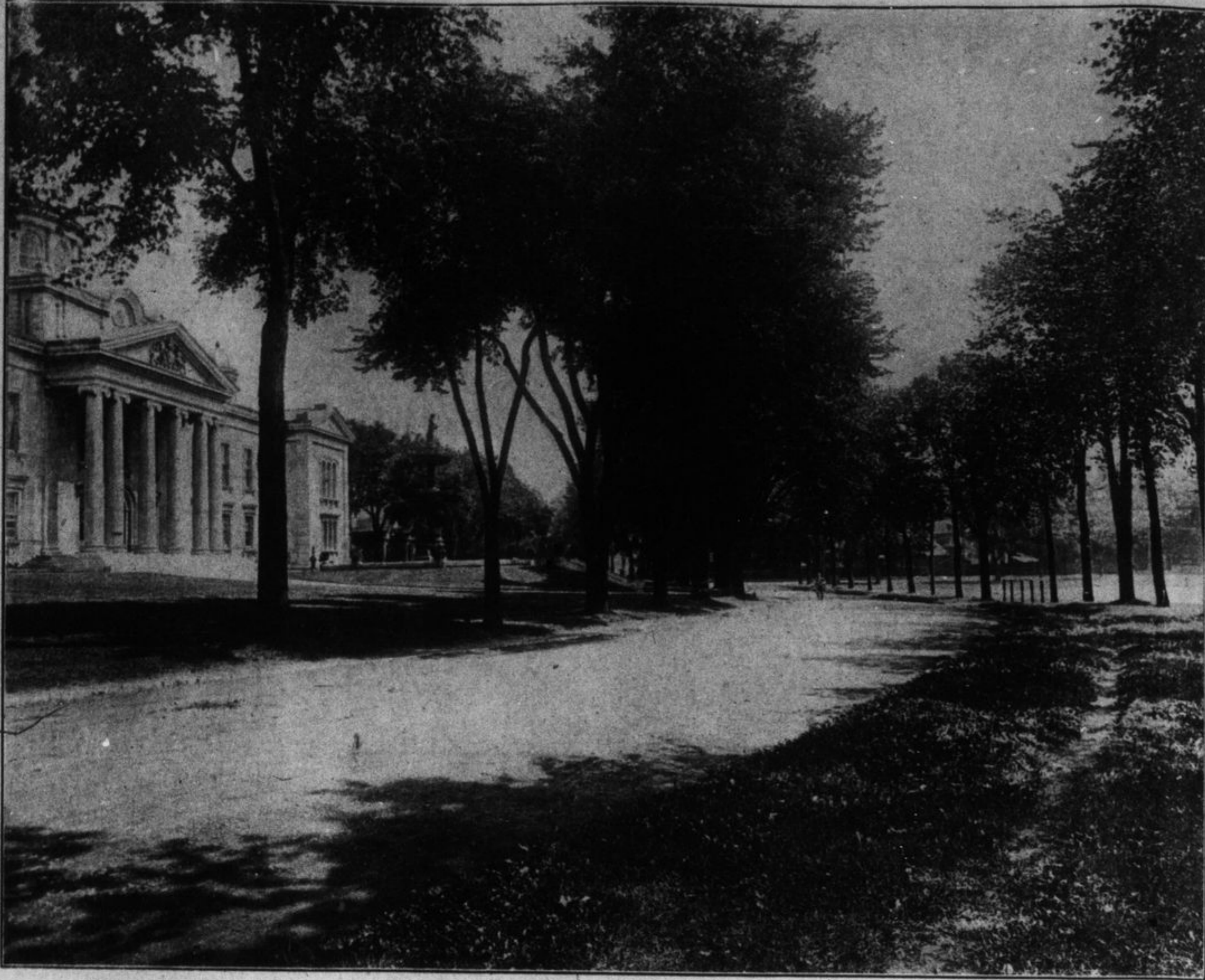
ONE OF KINGSTON'S BEAUTY SPOTS. A charming driveway, showing portion of Court House and the Lieut.-Gov. Kirkpatrick Memorial Fountain.