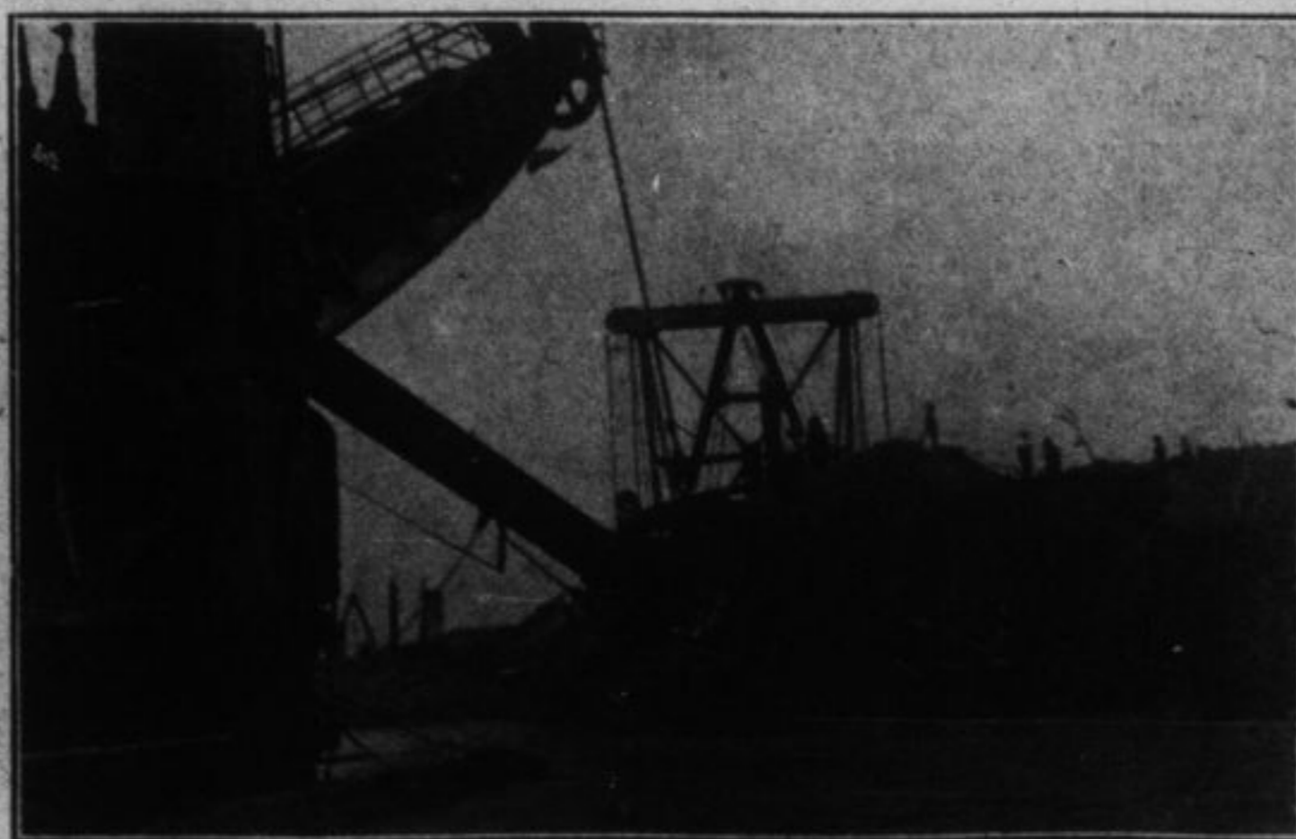
Latest photograph from the Canal, showing the huge dredge at work removing the earth that has closed the slide for so long a time.