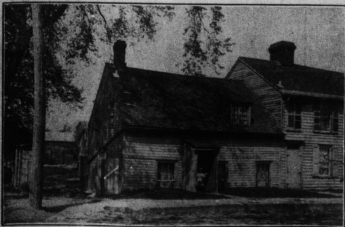
"GOVERNMENT HOUSE," KINGSTON, ONT. Where Col. John Graves Simcoe met his Executive Council, July 17th, 1792, and took the necessary preliminary steps to the opening of the first Parliament of Upper Canada.