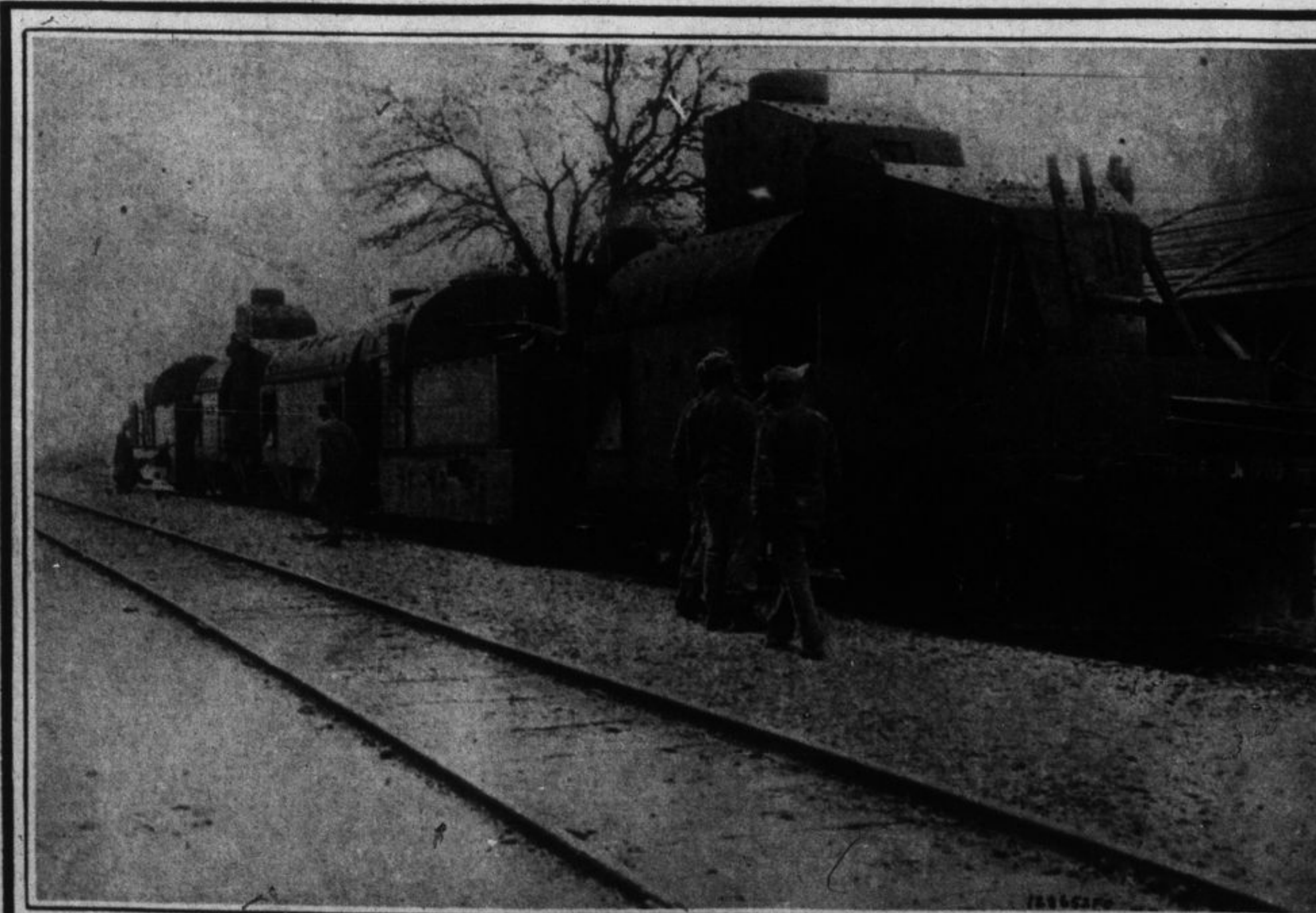
AUSTRIAN ARMORED TRAIN USED FOR RECONNOITERING.

Small calibre rapid firing guns and auto guns are mounted on this armored train, which is used by the Austrian for reconnoitering.