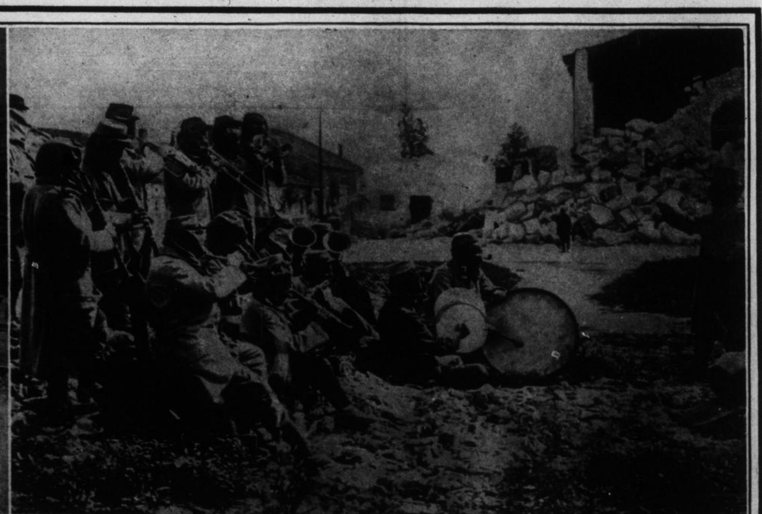
French soldier band composed of members of the dare-devil company of French soldiers whose duty it is to reconnoitre the enemy's position previous to an attack. Very often the men meet the death dealing poison gas, and all are equipped with anti-gas masks.

Small calibre rapid firing guns and auto guns are mounted on this armored train, which is used by the Austrian for reconnoitering.