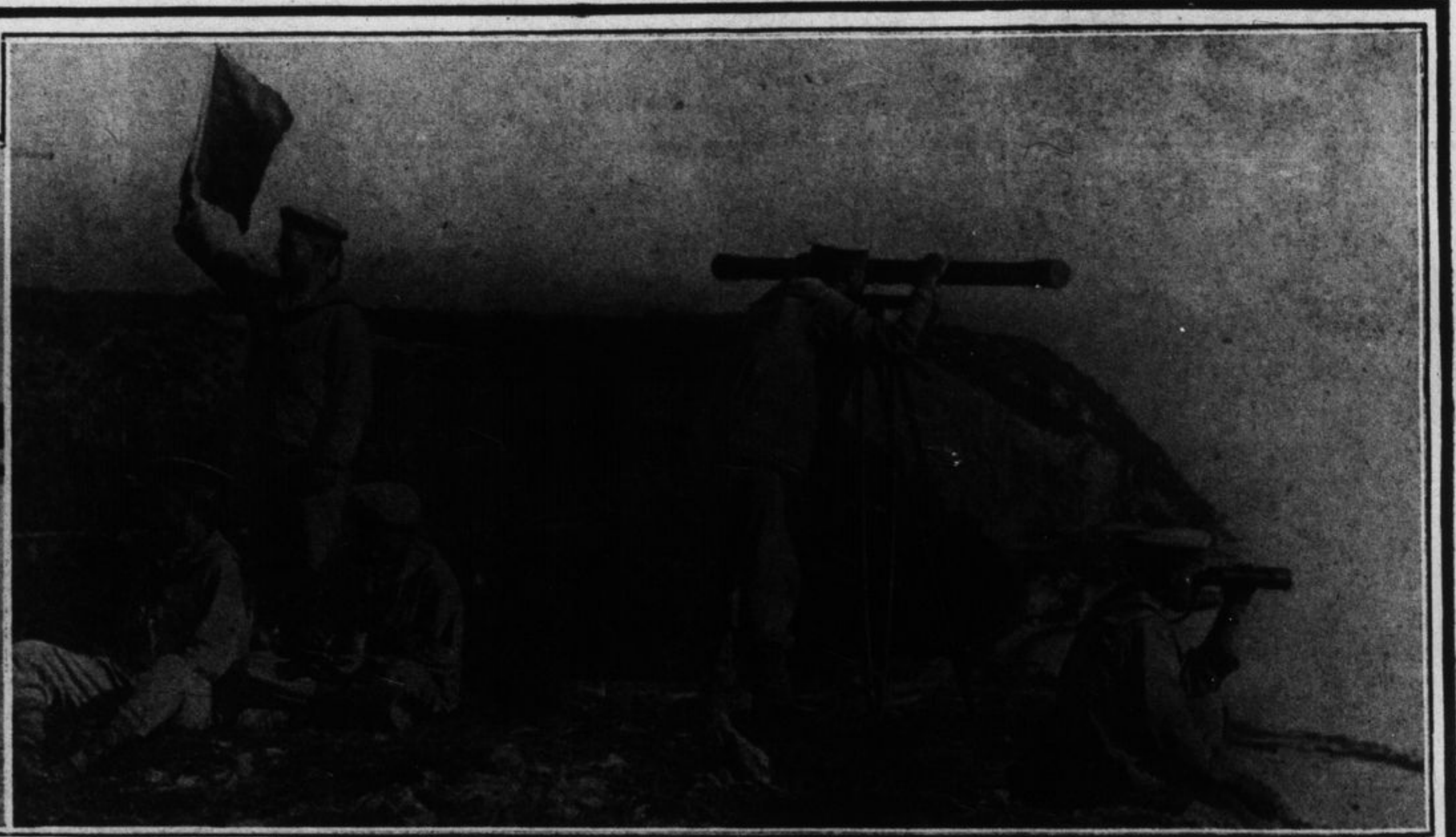
AN AUSTRO-HUNGARIAN COAST SIGNAL STATION ALONG THE ADRIATIC COAST.