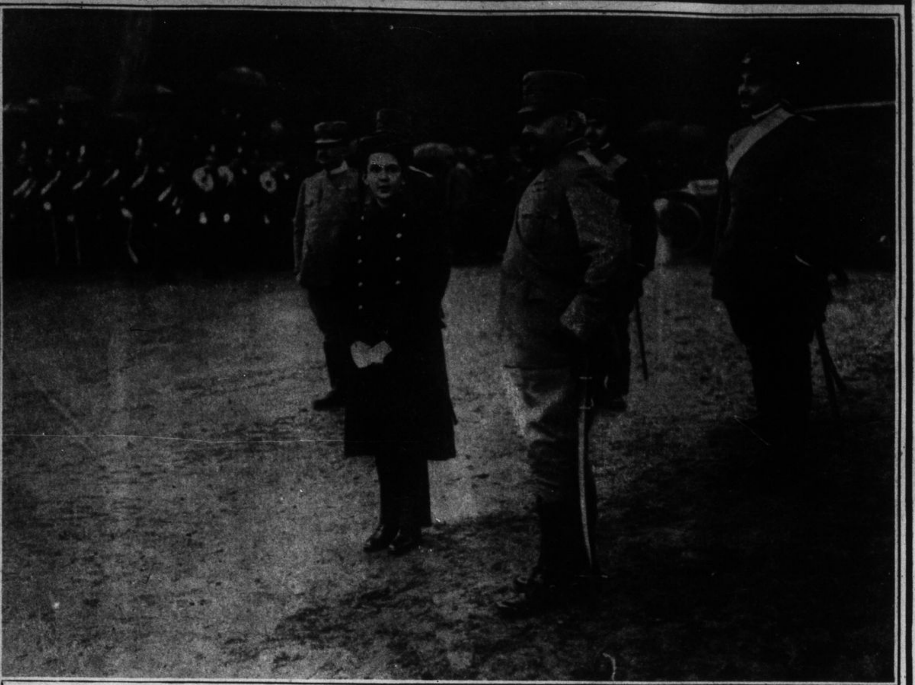
Crown Prince Umberto of Italy. Latest photo of the heir to the Italian throne, taken as he is assisting in the bestowing of decorations on the Italian heroes of the war.

The scene at the camp at Ede. Transport cars are seen waiting to be loaded up preparatory to starting on their way to Jaunde, the capital of the last but one remaining German colony.