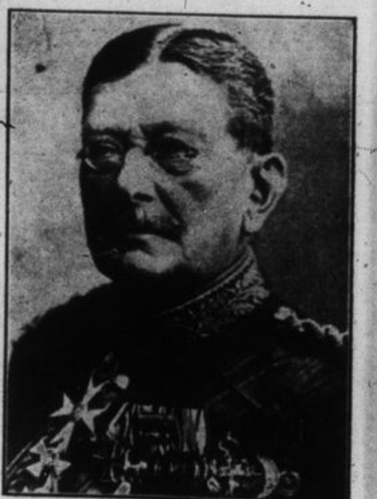
Field Marshal Von der Goltz, who will command the Teuton Turkish expedition against the Suez Canal and Egypt.