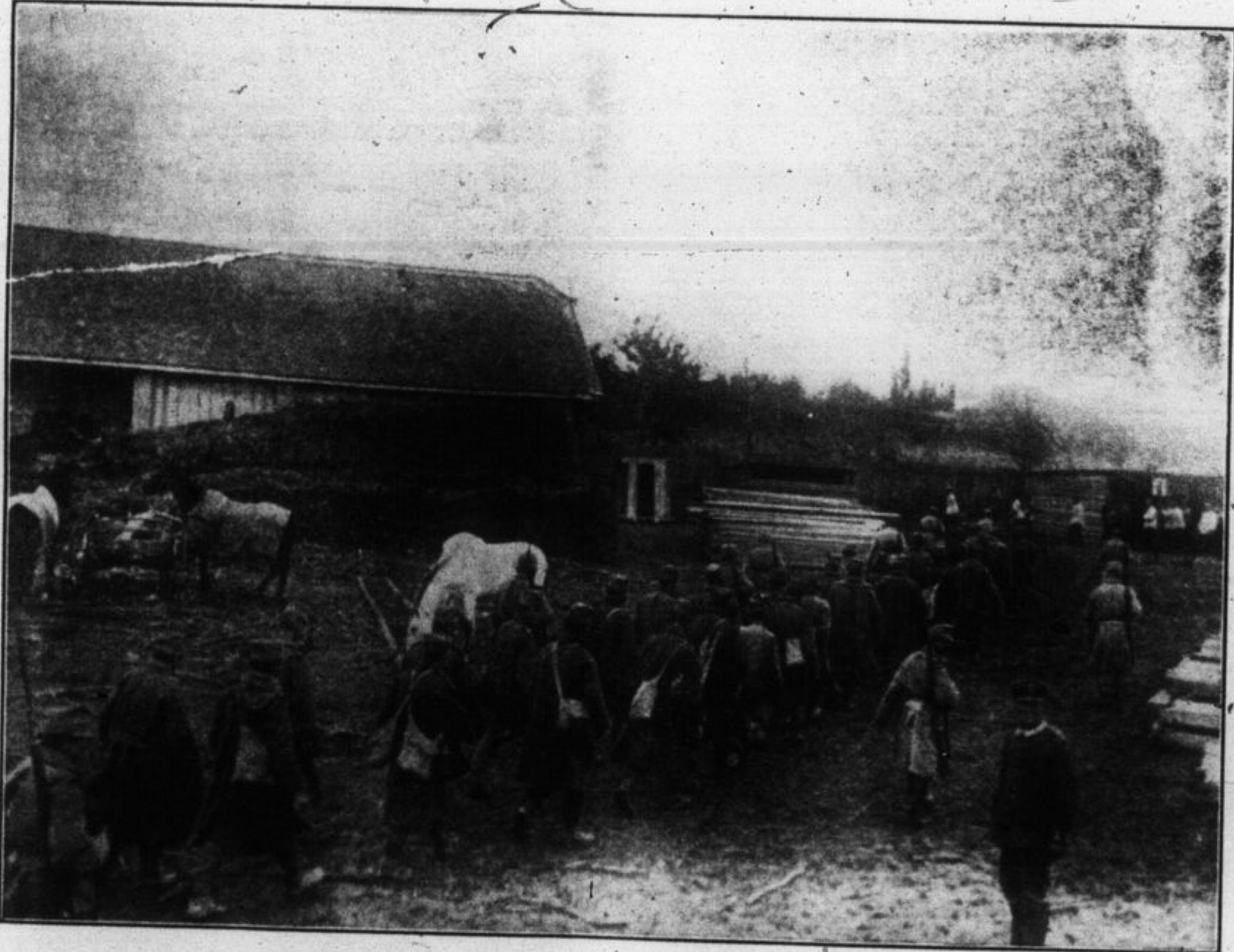
Retreating Serbian soldiers passing through a hamlet on their way to a haven on Greek soil.