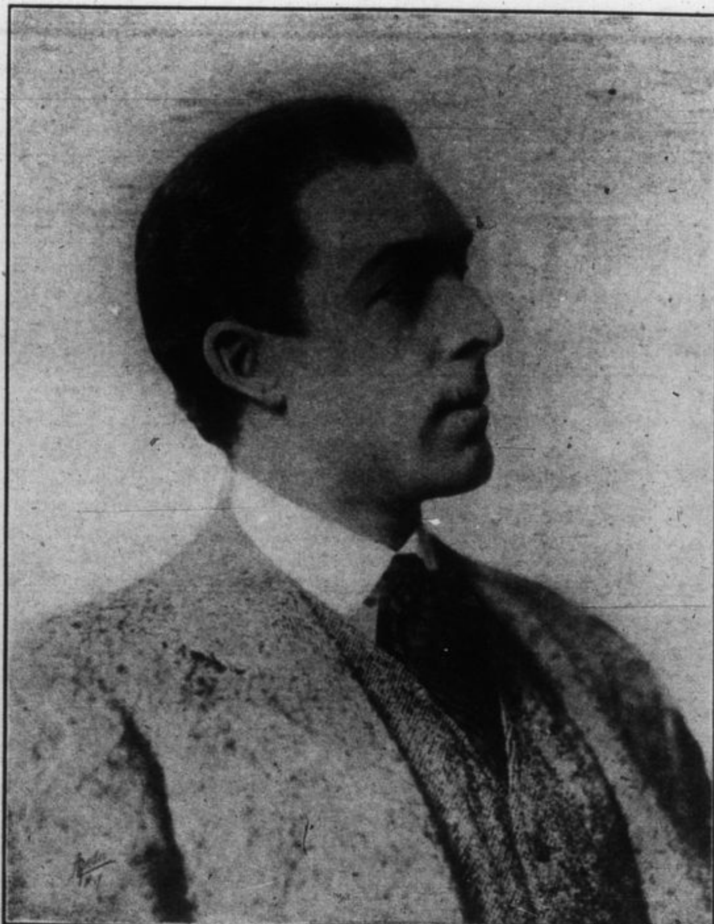
William Faversham, star of Sir Gilbert Parker's "The Right of Way," five act Metro Feature, at the Strand Theatre, Kingston, Jan. 17, 18, 19.