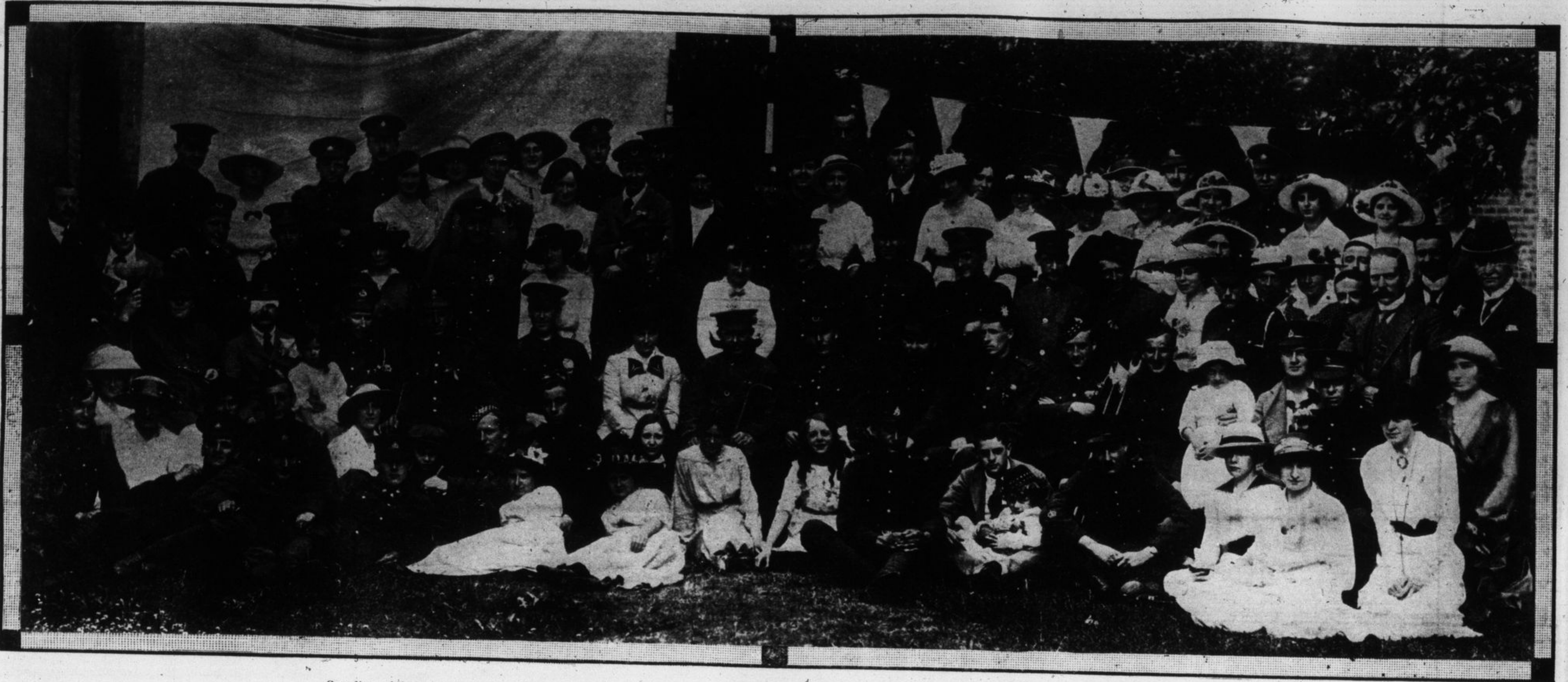
Canadian soldiers convalescing at Lewisham Military Hospital, England. The photograph shows the soldiers, with their friends and relatives.