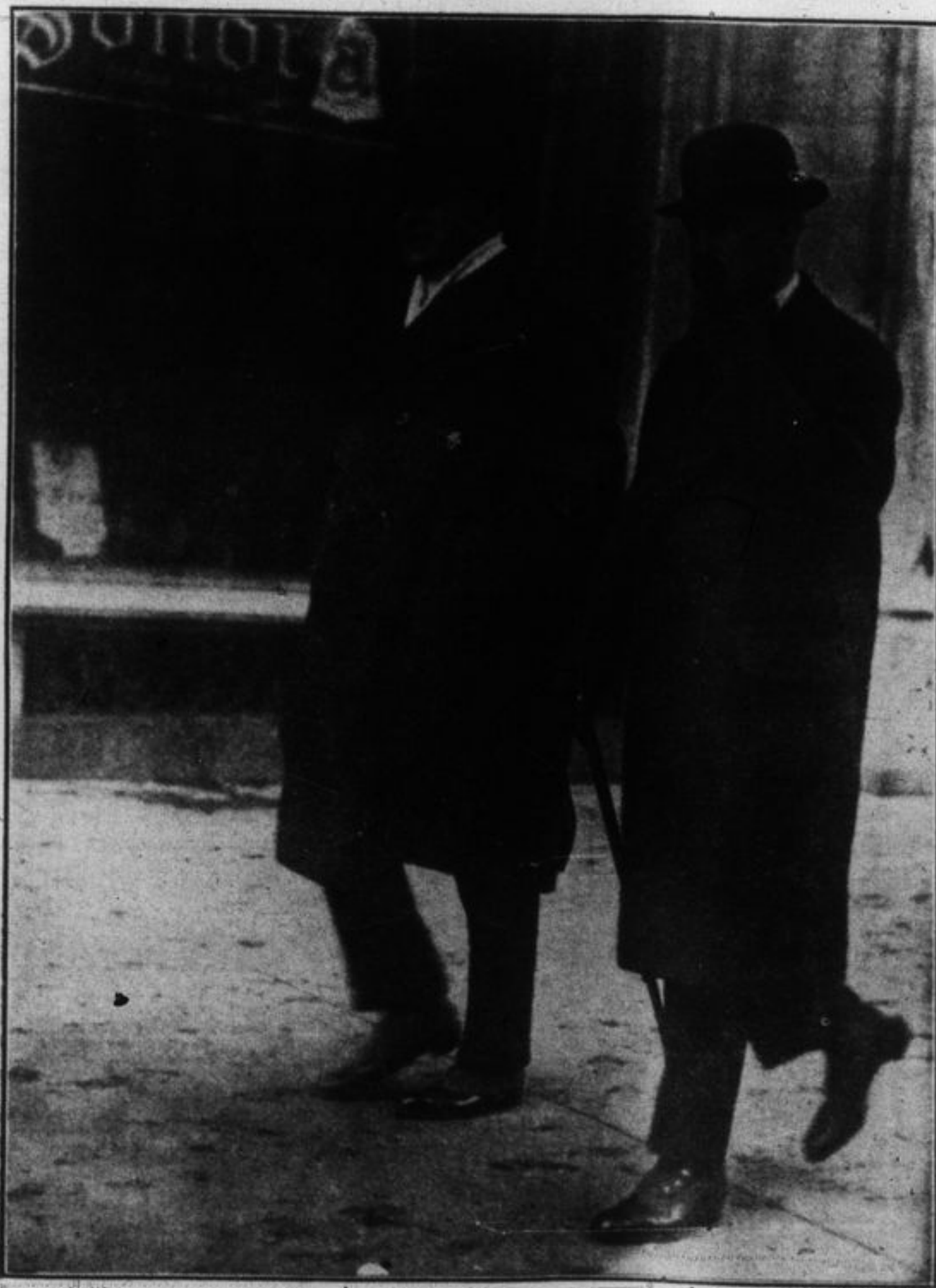
A snapshot made (Dec. 16) of Captain Karl Boyed (left) and Captain Franz von Pappen, the recalled German Naval and Military Attachees, respectively, walking on Fifth Avenue, New York City. Captain Boyed tried desperately to prevent the making of the picture, and it was made after much difficulty, and exclusively by a member of the staff of the American Press Association.