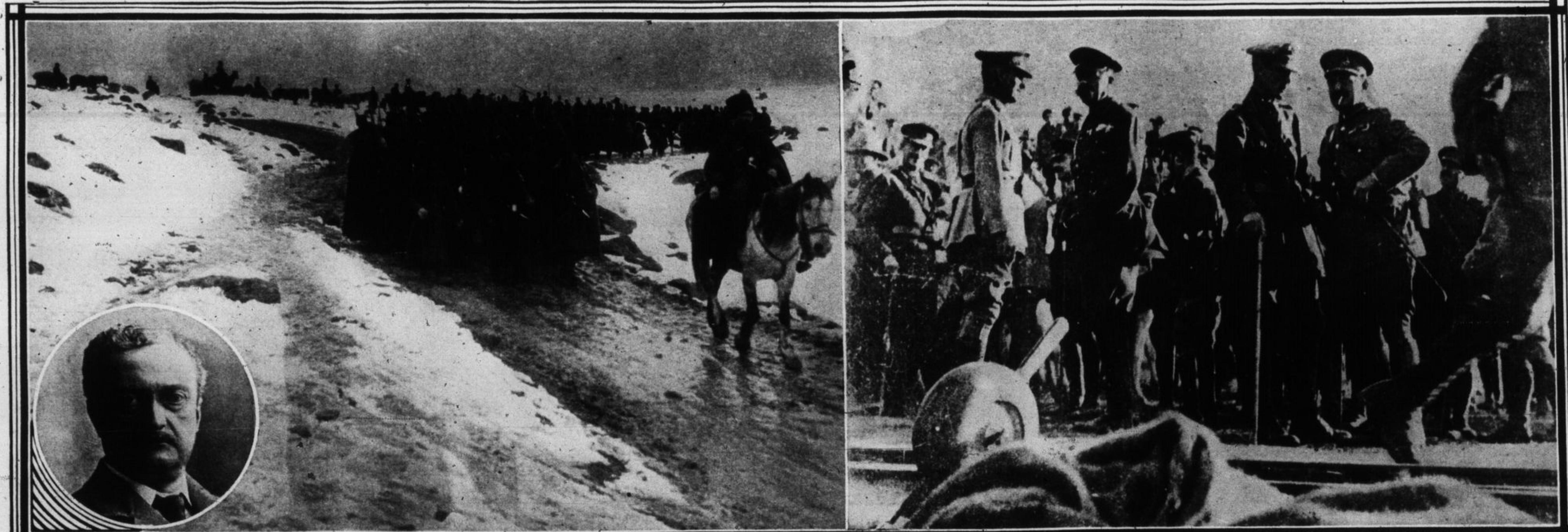
John Redmond, the leader of Irish Nationalists, who is opposing conscription by every means in his power.