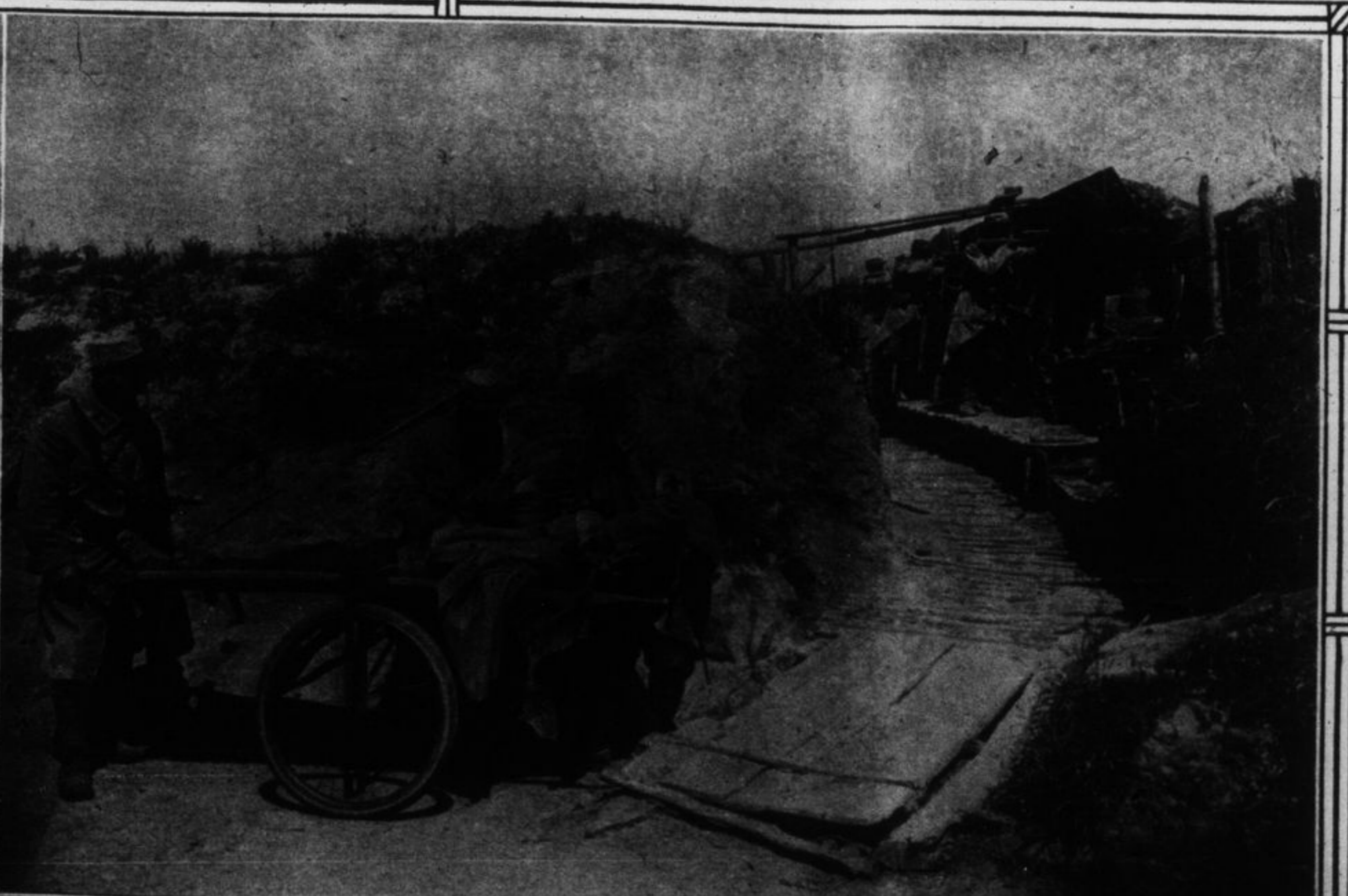
The Suez Canal, guarded against invasion. The reports state that 300,000 Turks and Germans are advancing to Egypt from Palestine. Photo shows native Egyptians on guard.