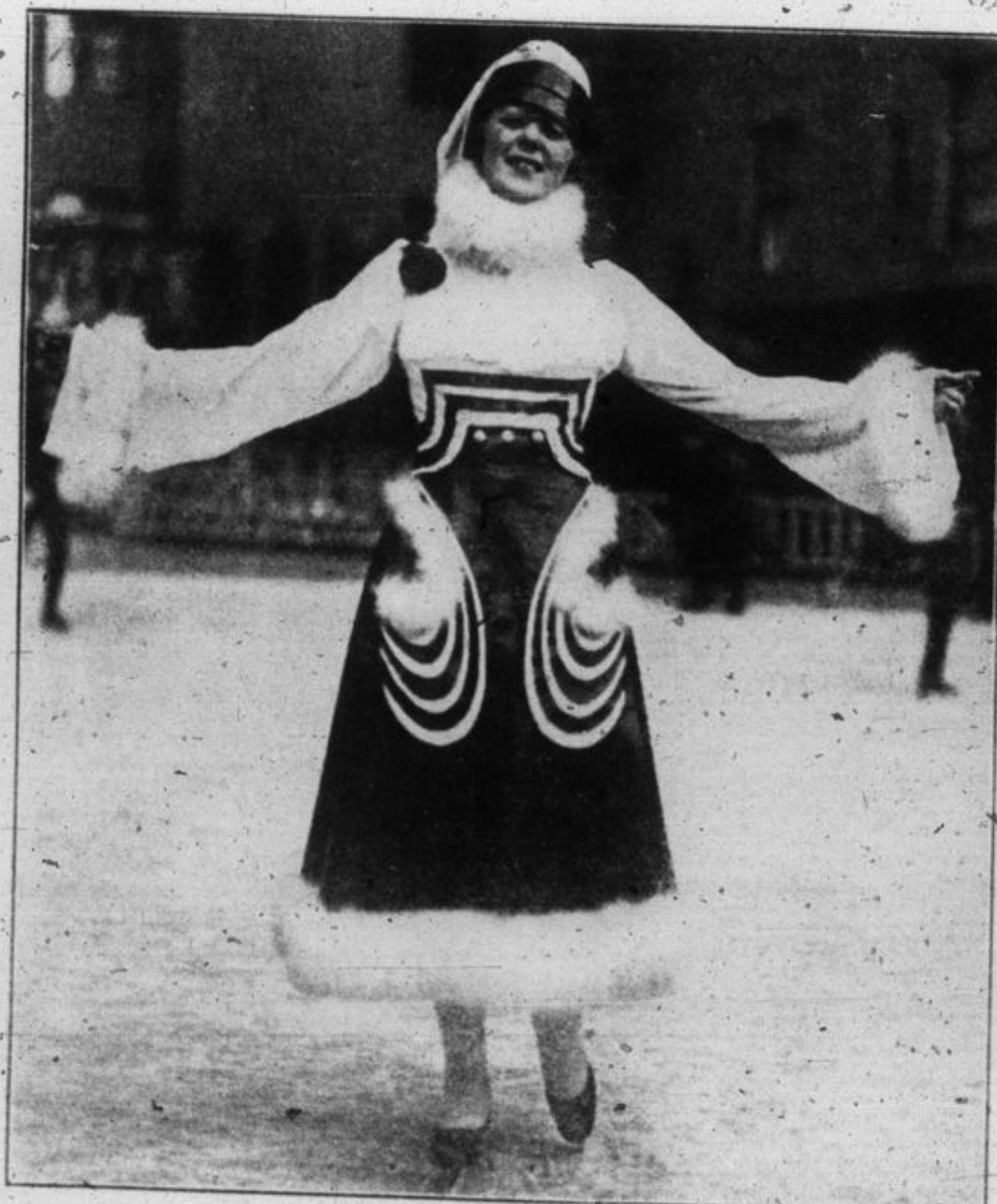
Latest skating fashion, as seen at the Biltmore Hotel Rink, is a blue leather skirt, worn with the same color georgette crepe waist. The trimming is of white fox.