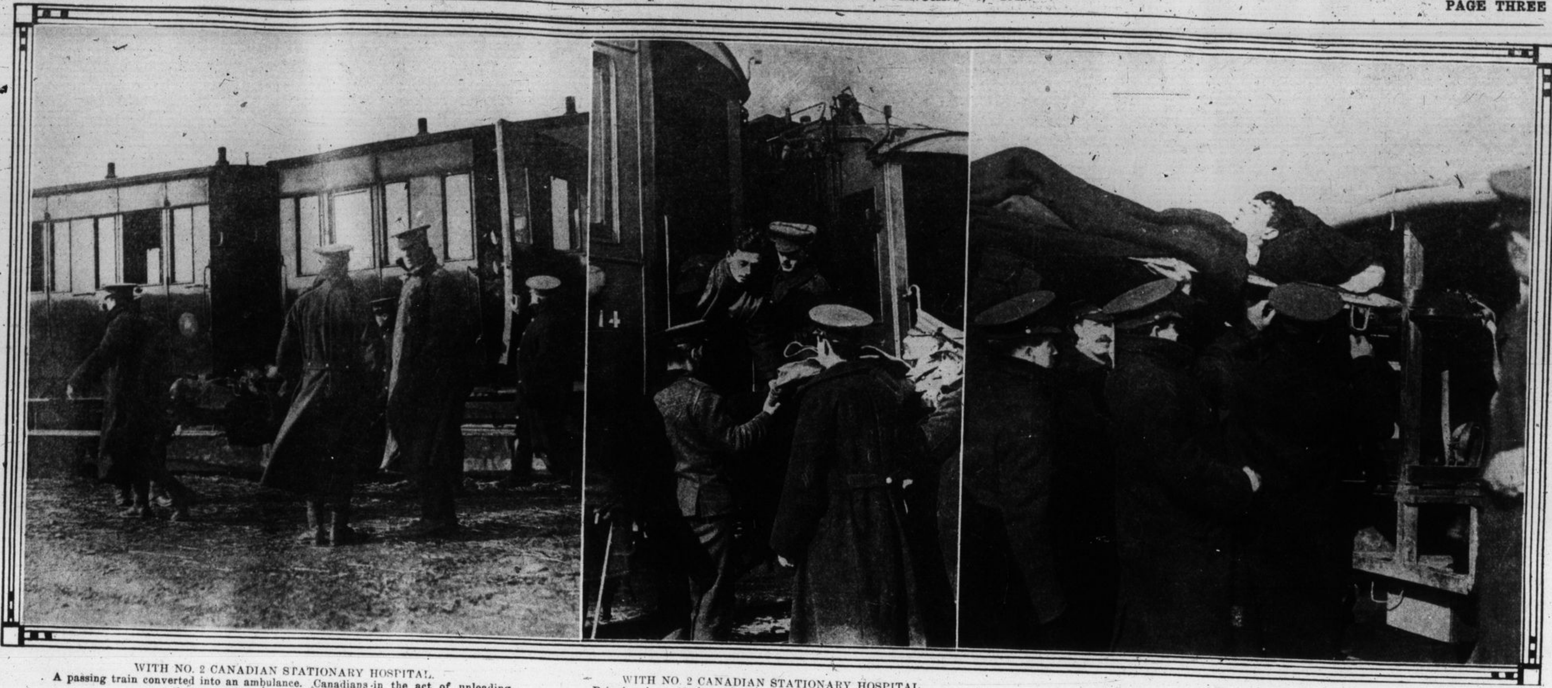
WITH NO. 2 CANADIAN STATIONARY HOSPITAL. A passing train converted into an ambulance. Canadians in the act of unloading the wounded—"somewhere in France."