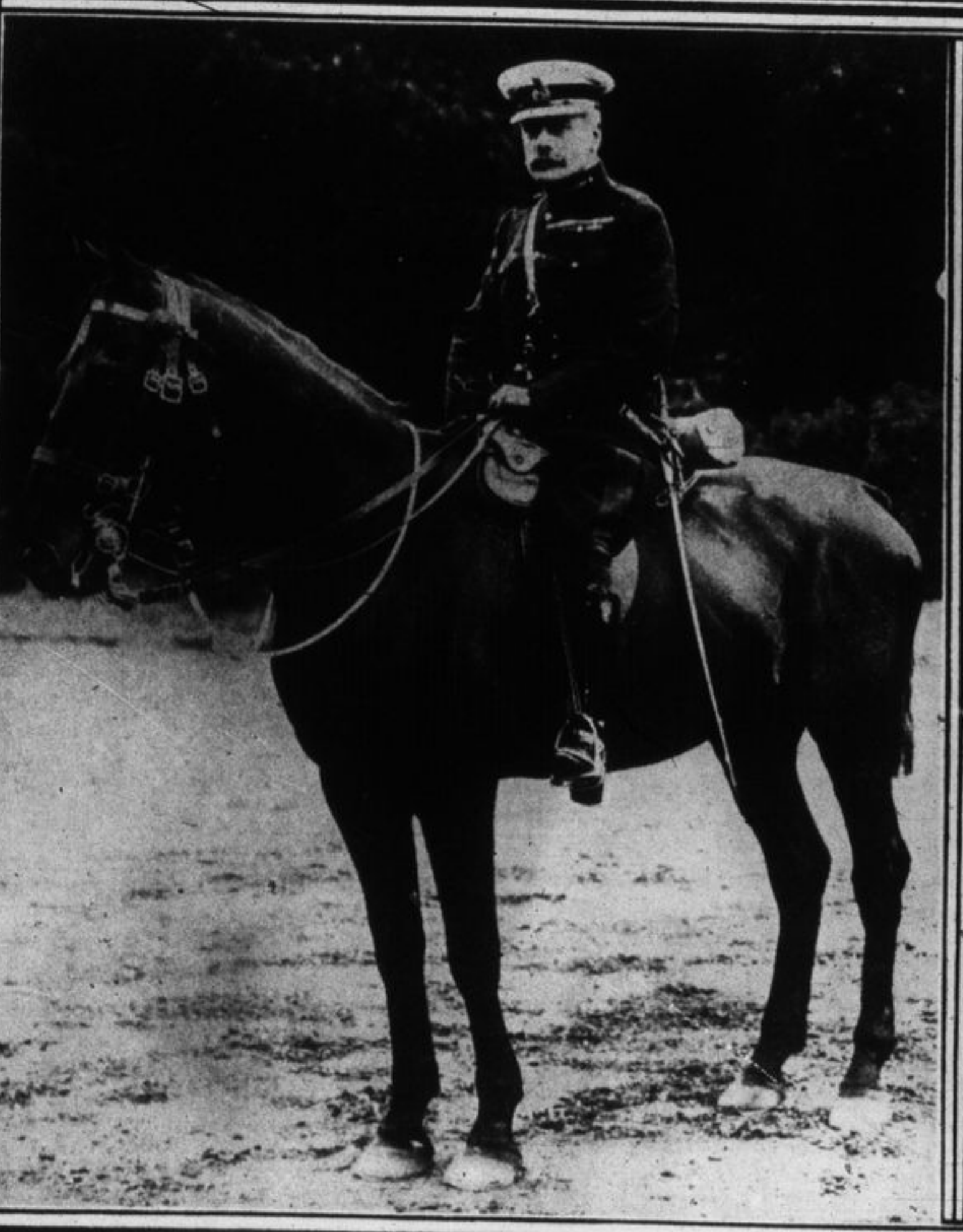
General Sir Douglas Haig, who has succeeded Gen. Sir John French in command of the English troops in Flanders and France.