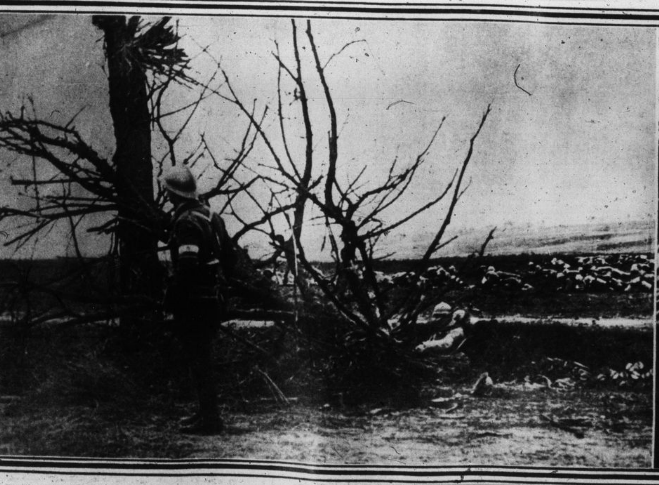
Awaiting the lull of the German bombardment, French soldiers are looking for their officer to command the charge.