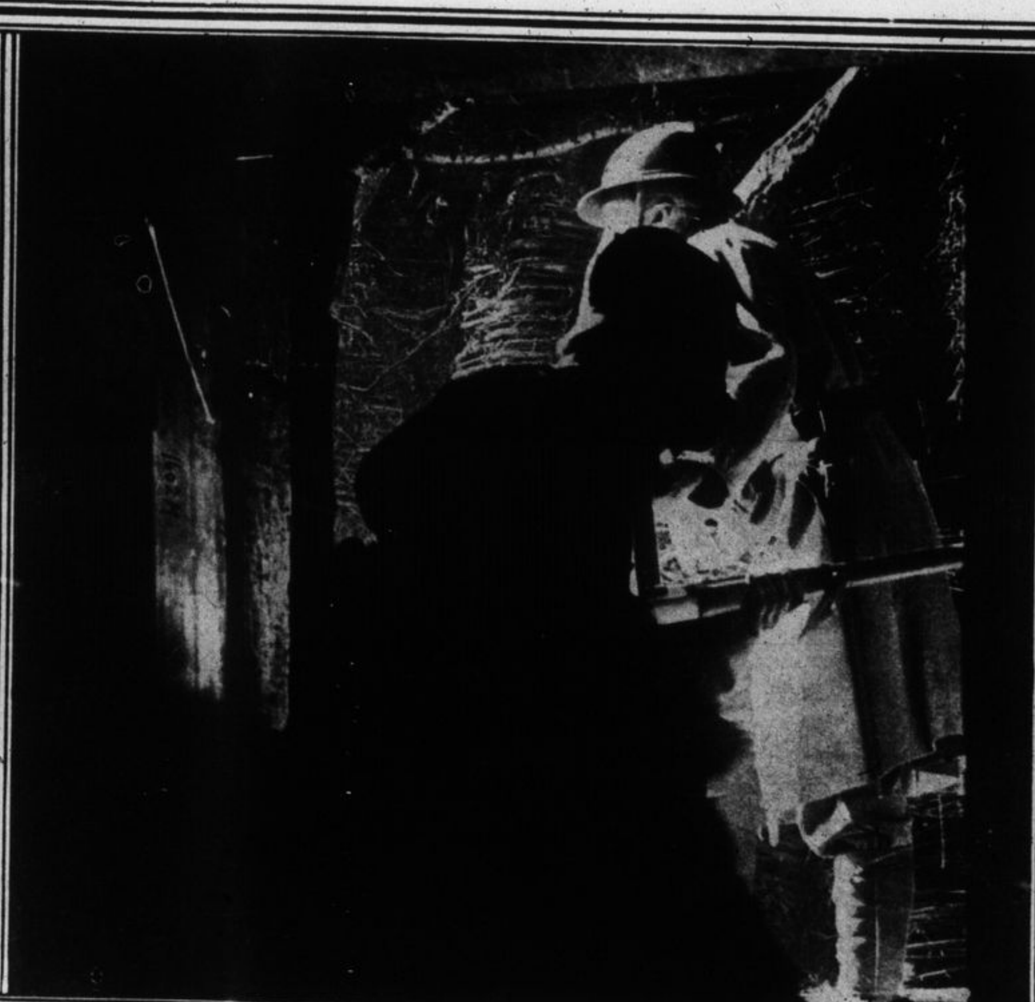
French lookout wearing gas mask watching for the enemy's approach.