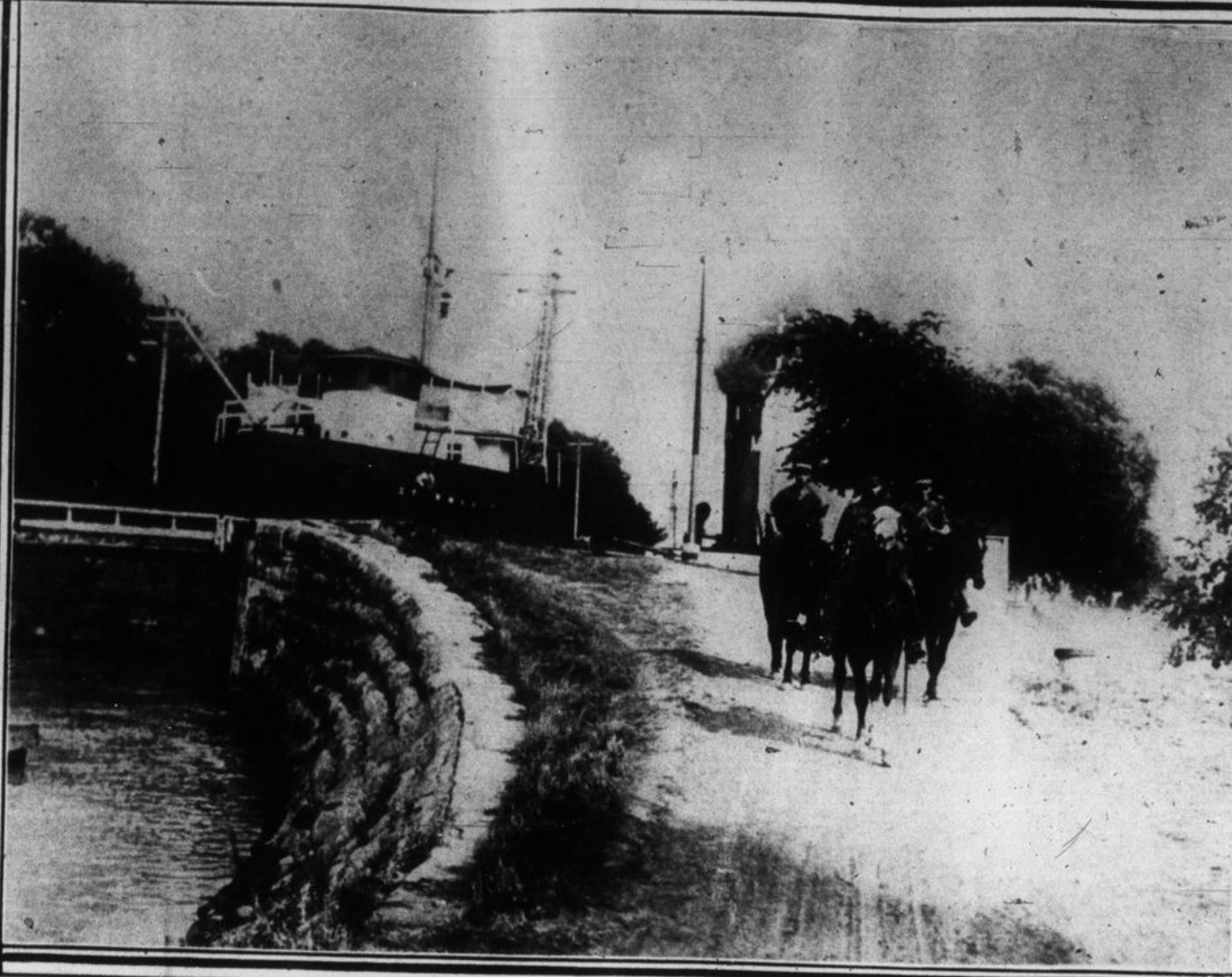
CANADIAN CAVALRY PATROLLING THE WELAND CANAL.