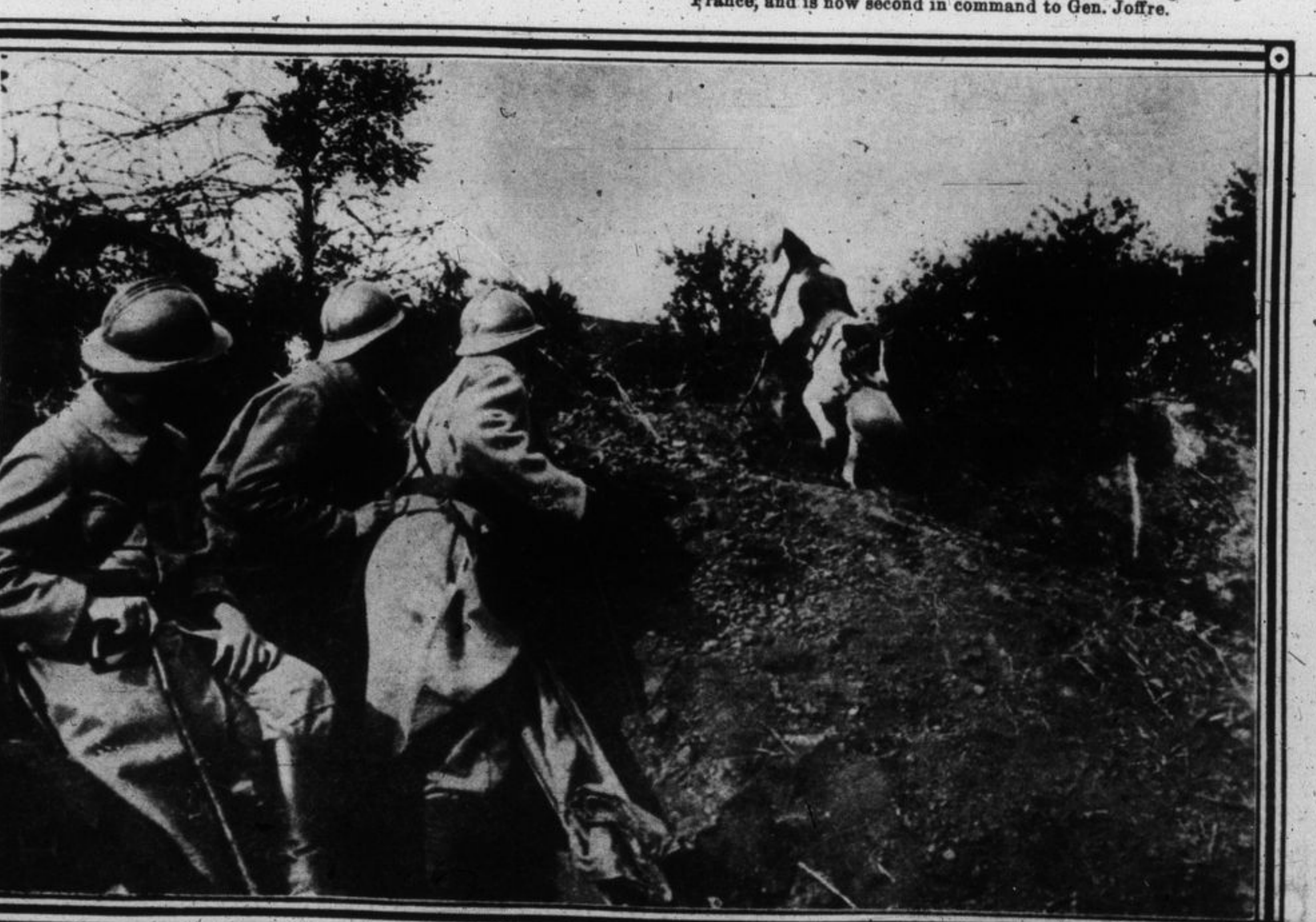
French Red Cross dog bringing helmet of a wounded soldier back to his comrades. They follow immediately to search for him.